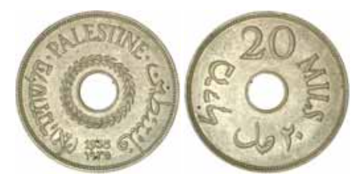
Lot 3697 part