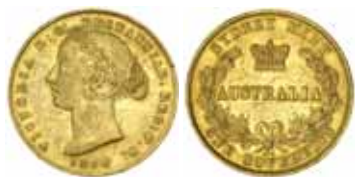
914* Queen Victoria , second type, 1864. Toned, very fine/ good very fine. $350

Ex Douro Cargo (lot 992) and Noble Numismatics Sale 56 (lot 1359) and 66 (lot 1235).