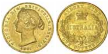
910* Queen Victoria , second type, 1861. Hairline die breaks top and bottom of date, good very fine and rare thus. $600