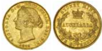
911* Queen Victoria , second type, 1863. Toned, nearly very fine. $350