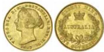
918* Queen Victoria , second type, 1866. Top of last 6 of date scuffed otherwise extremely fine/ good extremely fine. $800