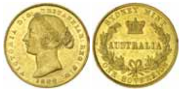
913* Queen Victoria , second type, 1864. Obverse bruise otherwise nearly extremely fine/extremely fine. $350