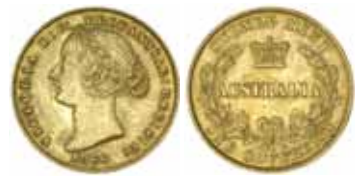
920* Queen Victoria , second type, 1866. Nearly extremely fine. $600