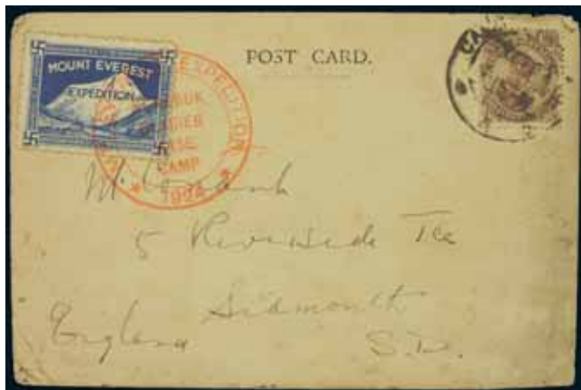
LOt 1194 part