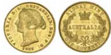
919* Queen Victoria , second type, 1866. Extremely fine/ good extremely fine. $750

Ex Douro Cargo (lot 992) and Noble Numismatics Sale 56 (lot 1359) and 66 (lot 1235).