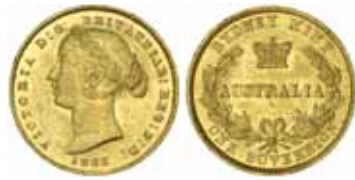
916* Queen Victoria , second type, 1866. Extremely fine/good extremely fine. $1,000