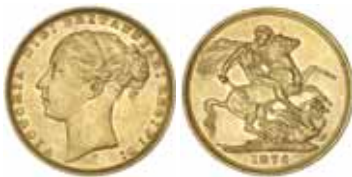
Lot 1008 part

1007 Queen Victoria , 1876 Melbourne. Nearly extremely fine. $250