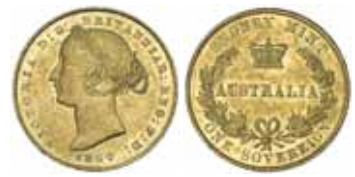
912* Queen Victoria , second type, 1864. Some mint bloom, extremely fine or better. $900