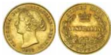
921* Queen Victoria , second type, 1866. Nearly extremely fine. $500