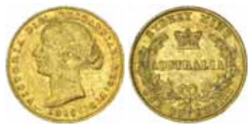
915* Queen Victoria , second type, 1865. Heavy obverse surface marking otherwise nearly very fine/very fine $250