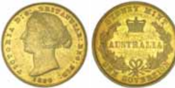
917* Queen Victoria , second type, 1866. Surface marking on obverse otherwise extremely fine/good extremely fine. $1,000