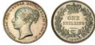
933* Queen Victoria , young head shilling, 1842, no WW, (S.3904, ESC 1288). Brilliant, good extremely fine and scarce. $250