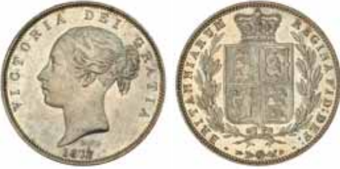
929* Queen Victoria , young head, halfcrown, 1877, (S.3889, ESC 700). Brilliant, good extremely fine and scarce. $280