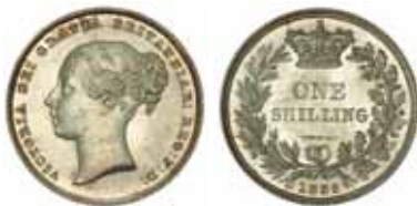
932* Queen Victoria , young head shilling, 1839, no WW, (S.3904, ESC 1283). Brilliant, uncirculated and scarce. $350