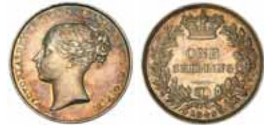
934* Queen Victoria , young head shilling, 1843, no WW, (S.3904, ESC 1290). Golden tone, nearly extremely fine/ extremely fine and rare. $200