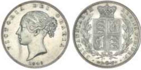
928* Queen Victoria , young head halfcrown, 1849 (S.3888) large date. Cleaned otherwise nearly extremely fine. $300