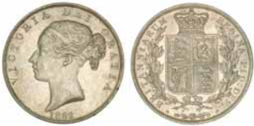
930* Queen Victoria , young head, halfcrown, 1882 (S.3889). Extremely fine. $200