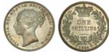
936* Queen Victoria , young head shilling, 1845, no WW, (S.3904, ESC 1292). Brilliant, nearly uncirculated and rare. $250