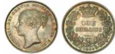
935* Queen Victoria , young head shilling, 1844, no WW, (S.3904, ESC 1291). Golden blue peripheral tone, nearly uncirculated and scarce. $250