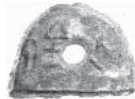
1753* China , Chou Dynasty, Middle and late period, (475-221 B.C.), bronze, small half round with central hole, value one, Mann Chin Huo, height 25mm, (5.6 grams), (Coole -, TFP -, JM QB -). Green patina with partial cleaning, nearly very fine and unpublished. $400

Ex Noble Numismatics Sale 56 (lot 3388). This piece previously unpublished was recently (1996) excavated in Hupei Province, China.