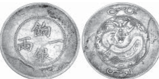
1795* China , Sinkiang Province, under empire, silver dollar, nd (1905), (KM.Y.7.1, Kann 1101a). Nearly very fine and scarce.