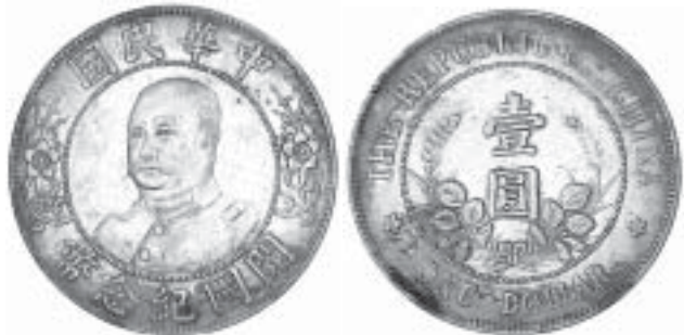
1797* China , Republic, General Issue, silver dollar not dated (c.1912), obv. Li Yuan-hung facing with bare head, and military uniform, rev. ONE DOLLAR, (KM. Y.321, Kann 639). Good very fine and scarce.