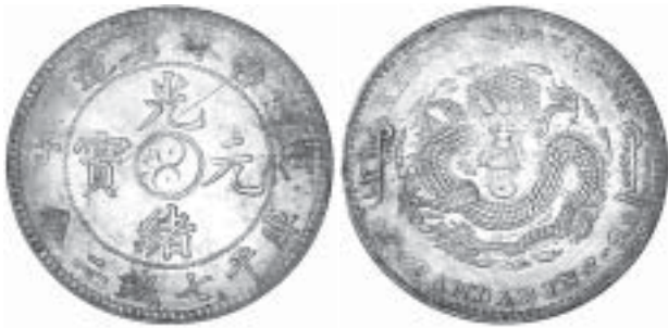
1793* China , Kirin Province, under Empire, silver dollar, obv. Yin-Yang symbol in centre, cd 1900, (KM.Y.183a). Lightly toned, nearly uncirculated and very scarce.