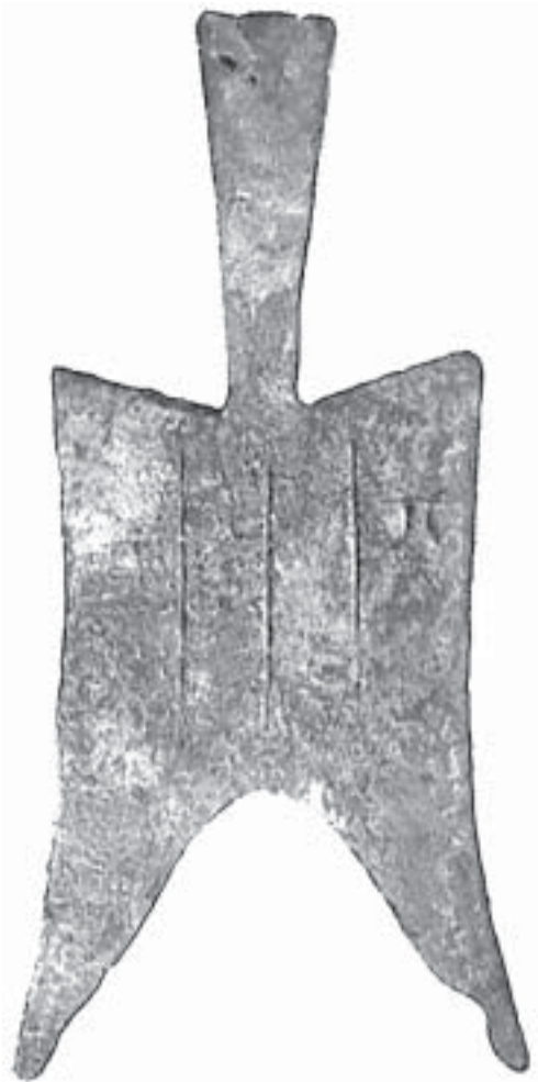
1751* China , Chou Dynasty, Middle to late period, (from 5th - 3rd century B.C.), large size hollow handled spade money type I (Wang Yu-Ch'uan), with pointed feet, uncertain letter in right field (Da?), Coole type of Kan Tan (Sweet Cinnabar), 60.4 grams, height 131mm, (cf.Cooles Vol.1 411, p.166, cf.Sch.43, cf.TFP 11). Green oxidation on most of surface character clear, otherwise very fine and very rare. $700