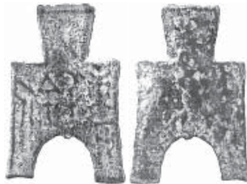
1754* China , Chou Dynasty, Middle to late period, (475-221 B.C.), bronze, small square shouldered square footed spade money, value one, Shu Fan pan Chin Huo, (Treaty I Chin), [Shu Chou Hsien a city near Hochienhsien in Hopei Province, after dynasty of Chin, in revolt {Fan}], height 45mm, (5.6 grams), (cf.Cooles Vol.3 4468, cf.TFP 264, JMBQ p.48). Light corrosion, some green patination, fine and very rare. $200

Ex Noble Numismatics Sale 56 (lot 3388). This piece previously unpublished was recently (1996) excavated in Hupei Province, China.