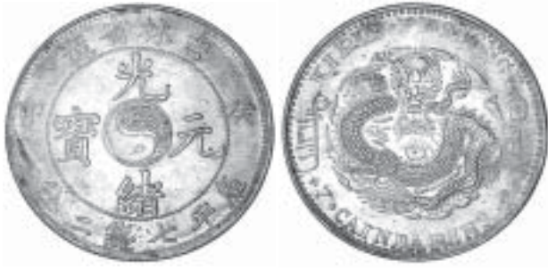
1792* China , Kirin Province, under Empire, silver dollar, obv. beady eyed dragon symbol in centre, cd 1903, (KM.Y.183a.2). Lightly toned, nearly uncirculated and very scarce.