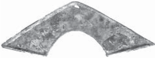
1750* China , uncertain period, "Ch'in" series, plain type, odd shaped medium of exchange, and also known as "bridge money", (c.1000-500 B.C.), length 128 mm., (cf.Cooles 6708, Vol.5 p.473, Not in Sch. or TFP). With green patina, fine and rare. $120