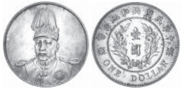
1796* China , Republic, pattern silver dollar, Yuan Shih-kai facing bust, plain above right shoulder nd. 1914, (KM.322). Brilliant, nearly uncirculated and rare.