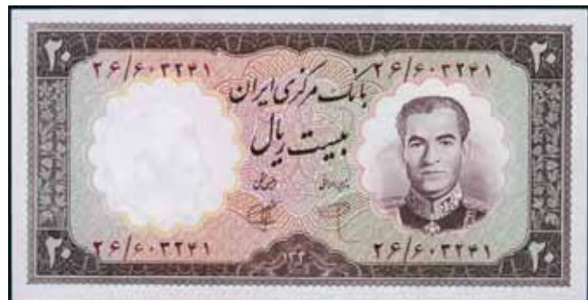
lot 3604 part