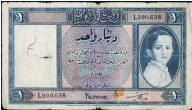
3612* Iraq , Faisal II, dinar (1942), L 990,638 (P.18a). Perforated, also horizontal fold, edge chips, very good. $100