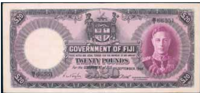
3526* Fiji , Government of Fiji, George VI, twenty pounds, 1st September, 1948, B/1 66,551 (P.43). Very fine or better and rare.