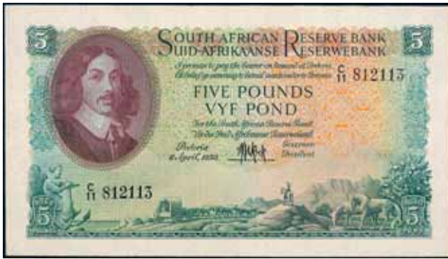
3729* South Africa , South African Reserve Bank, five pounds, Pretoria, 6 April, 1950 C/11 812113 (P.97a). Uncirculated.