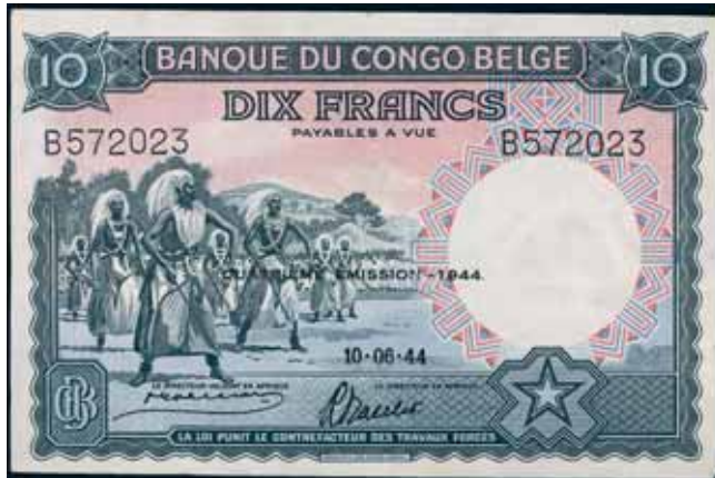
3463* Belgian Congo , Banque du Congo Belge, ten francs 10.07.42 (P.14B) 10.06.44 (P.14D); twenty francs 10.04.46 (P.15E). Good fine; good extremely fine; extremely fine. (3)