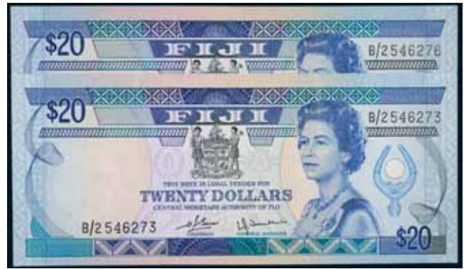
3536* Fiji , Central Monetary Authority of Fiji, Elizabeth II, twenty dollars, undated (1980), B/2 546273, 6 (P.80a). Centre folds, extremely fine. (2)