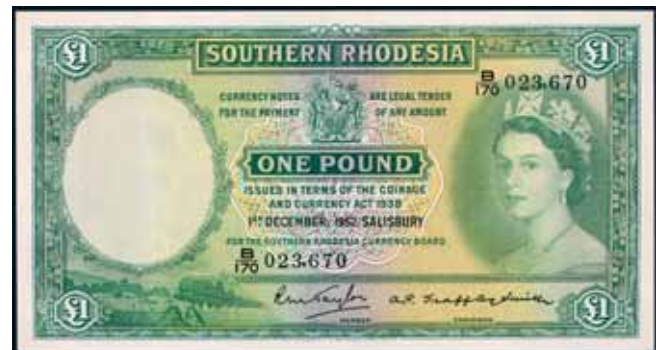
3734* Southern Rhodesia , Southern Rhodesia Currency Board, Elizabeth II, one pound, 1st December 1952, B/170 023,670 (P.13a). Good extremely fine.