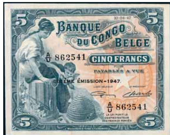
lot 1462 part