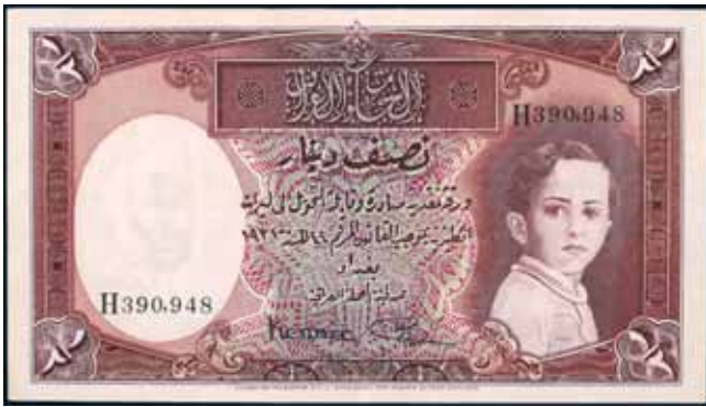
3611* Iraq , Faisal II, half dinar (1942), H 390,948 (P.176). Crisp, good extremely fine and rare, especially in this condition. $1,500