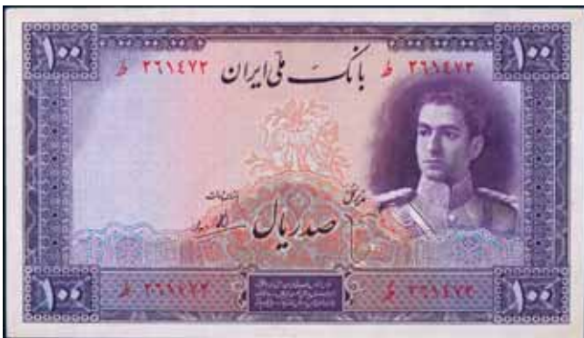
lot 3603 part