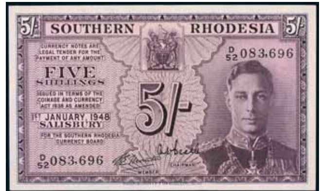
3733* Southern Rhodesia , Southern Rhodesia Currency Board, George VI, five shillings, 1st January 1948, D/52 083,696 (P.8Ab). Good extremely fine.