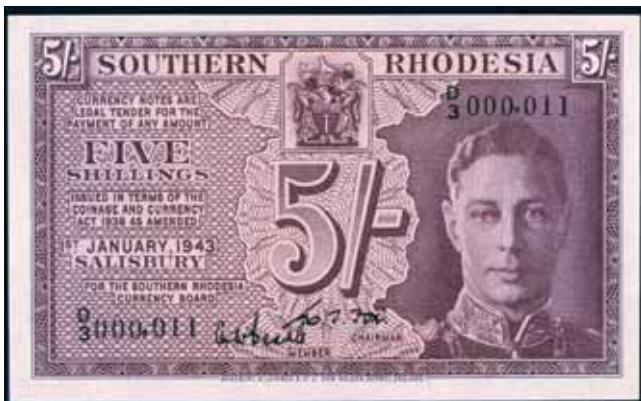
3732* Southern Rhodesia , Southern Rhodesia Currency Board, type II, five shillings, 1st January 1943, D/3 000,011 (P.8a). Nearly uncirculated.