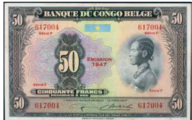
3465* Belgian Congo , Banque du Congo Belge, fifty francs, series F, emission 1947 overprint (P.16e). Quarter folds, otherwise good extremely fine.