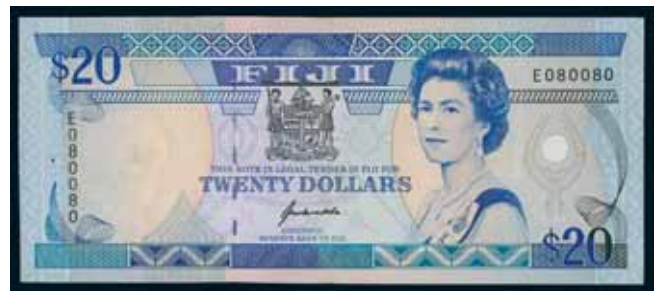
3541* Fiji , Reserve Bank of Fiji, Elizabeth II, twenty dollars, undated (1992) E 080080 (P.95a) radar number. Staple hole at left, extremely fine.