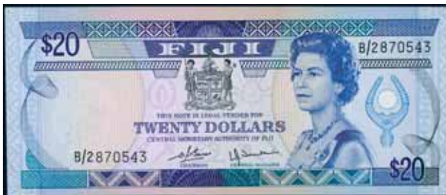
3535* Fiji , Central Monetary Authority, Elizabeth II, twenty dollars (1980) B/2 870543 (P.80). Good extremely fine/extremely fine.