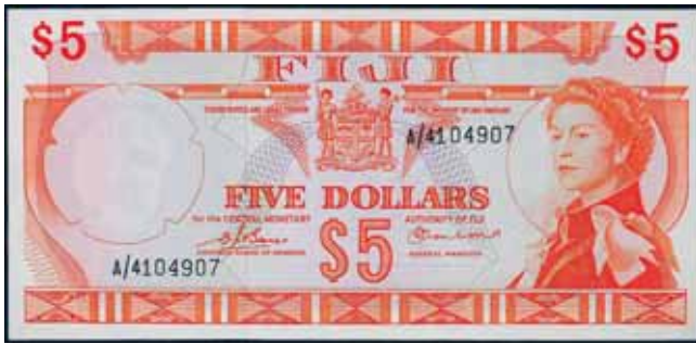
3532* Fiji , Central Monetary Authority of Fiji, Elizabeth II, five dollars (1974), A/4104907 (P.73b). Uncirculated.