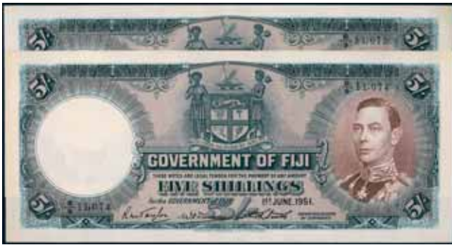
3524* Fiji , Government of Fiji, George VI, five shillings, 1st June 1951 B/9 11,074/5 (P.29c), consecutive pair. Slight centre bend, nearly uncirculated. (2)