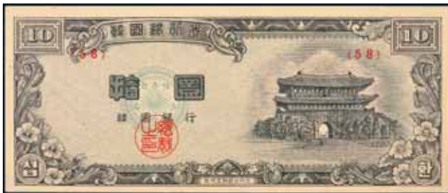
3731* South Korea , ten hwan (1953), (58) 4286 (P.17a). Uncirculated.