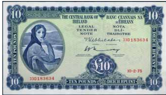
3614* Ireland , Republic, Central Bank of Ireland, ten shillings, 6.6.68; one pound, 17.9.70; five pounds, 24.10.55; ten pounds, 10.2.75 (P.63a, 64b, 58c, 66c). Nearly uncirculated - uncirculated. (4) $300