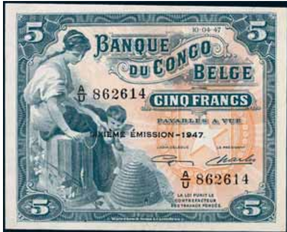
3462* Belgian Congo , Banque du Congo Belge, five francs, 10.04.47 (P.13Ad). Crisp, good very fine. (2)