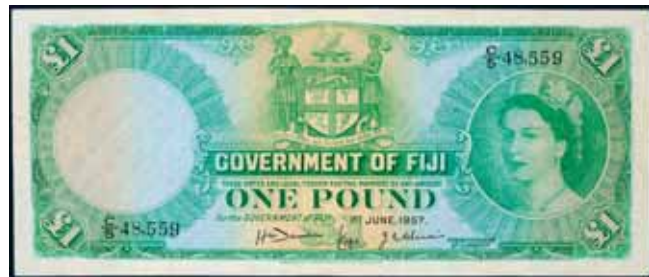
3529* Fiji , Government of Fiji, Elizabeth II, one pound, 1st June 1957, C/5 48,559 (P.53b). Cleaned, otherwise good fine or better.