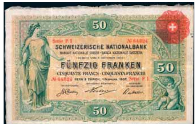
3735* Switzerland , Schweizerische Nationalbank, fifty franken, 1 Februar 1907, series P1, No.64824 (P.1). Flattened of folds and creases, six pin holes, good.