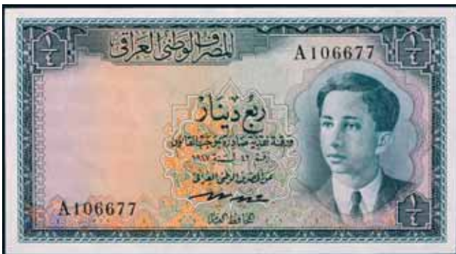
3613* Iraq , Faisal II, National Bank of Iraq, quarter dinar (1950). Nearly uncirculated. $100