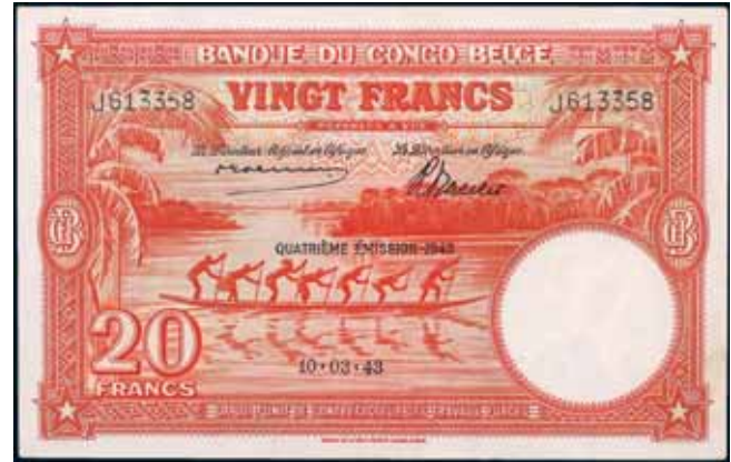
3464* Belgian Congo , Banque du Congo Belge, twenty francs, 10.03.43 (P.15c). Crisp, good extremely fine.