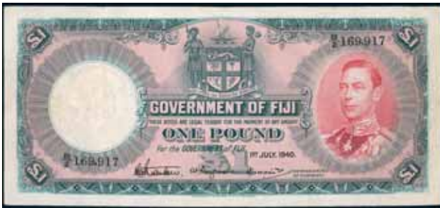
3525* Fiji , Government of Fiji, George VI, one pound, 1st July 1940, B/2 169,917 (P.39c). Crease or fold line on back, otherwise nearly very fine.