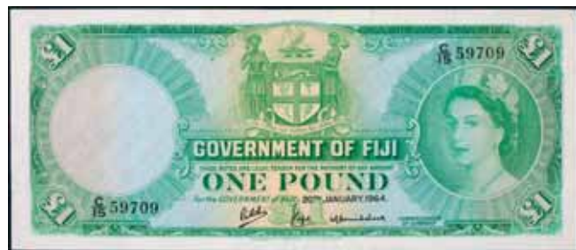
3530* Fiji , Government of Fiji, Elizabeth II, one pound, 20th January 1964, C/15 59709 (P.53e). Crisp original extremely fine.