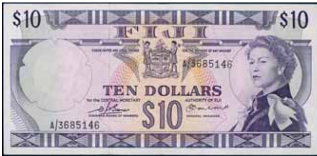
3533* Fiji , Central Monetary Authority of Fiji, ten dollars (1974), A/3685146 (P.74b), Good extremely fine.