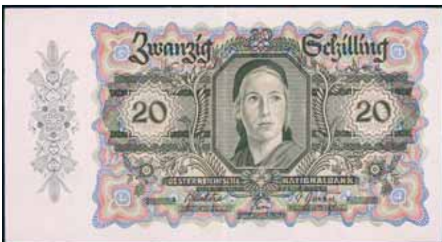
lot 3458 part

3458* Austria , various issues from World War I and II and later, including ten and twenty schillings 1946 (P.122, 123), all in Spink album. Very good - mostly uncirculated. (32) $250