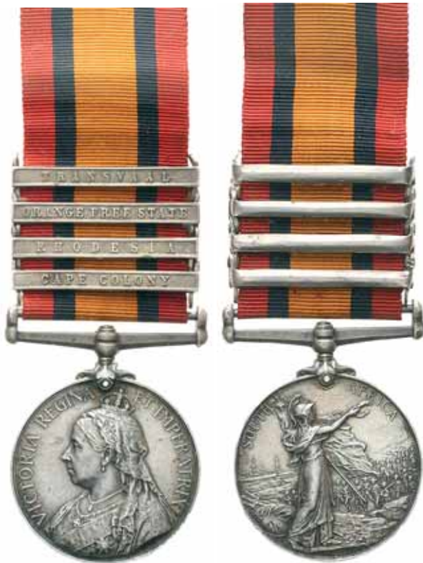
3219* Queen's South Africa Medal 1899 , (type 2 reverse), - four clasps - Cape Colony, Rhodesia, Orange Free State, Transvaal. 333 Corl A.P.Anderson, Victorian M.R. Impressed. The group of four clasps not attached to the suspender; otherwise good very fine.