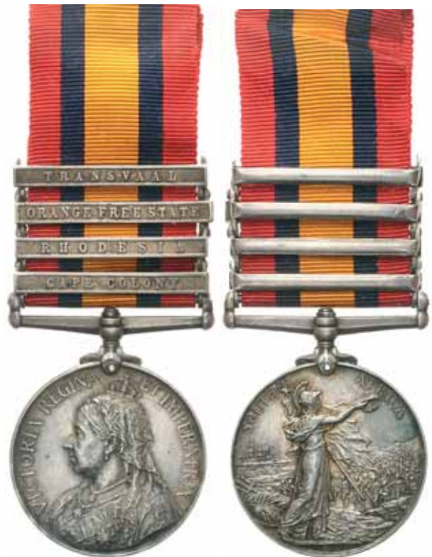
3220* Queen's South Africa Medal 1899 to WIA , (type 2 reverse with traces of ghost dates), - four clasps - Cape Colony, Rhodesia, Orange Free State, Transvaal. 6 Tpr: W.O.Jones, 1st W. Aus. Bshmn. Impressed. A few very small edge bumps, otherwise toned good very fine.

With copy of unit roll page featuring A.P.Anderson.