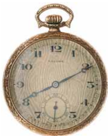
lot 3308 part