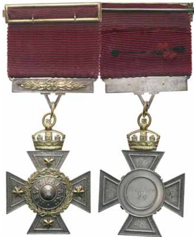
3190* New Zealand Cross 1869 , an official replica by P&F Ltd in 18ct gold and sterling silver, with brooch bar, reverse centre marked, 'Replica 49', being a limited edition made officially in the 1980s from original dies. In original case of issue, uncirculated and scarce only 67 issued. $900

Originally 200 replica crosses were to be produced by the New Zealand Mint for the New Zealand Coin & Medal Co Ltd in 1982 but only 67 were completed. Refer to the book titled 'The New Zealand Cross: The Rarest Bravery Award in the World' by Dr. Brian L. Kieran.