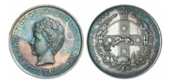
1651* Exhibition of Women's Industries, Sydney, 1888, in silver (39mm) (C.1888/14), by Amor, Sydney. Some hairlines, otherwise nicely toned and extremely fine.