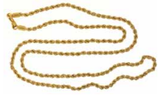
1513* Gold necklace , yellow gold rope chain (24ct; 44.96g; 67cm). Extremely fine. $2,500