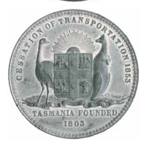
1644* Cessation of Transportation , 1853, in white metal (58mm) (C.1853/2), by Royal Mint, London. Short, thin scratch on reverse, otherwise nearly extremely fine with some mint bloom.