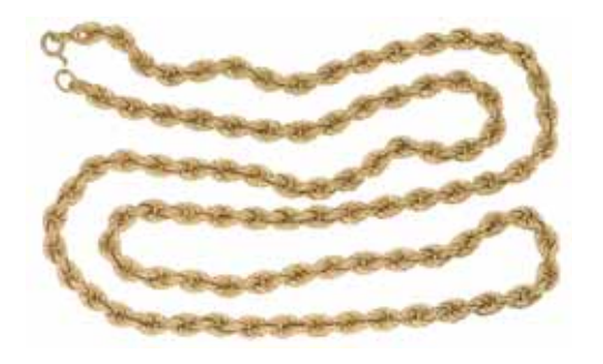
1512* Gold necklace , yellow gold rope chain (18ct; 43.7g; 80cm). Extremely fine.