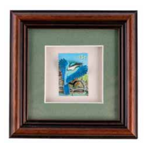
lot 1558 part