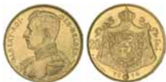
2974* Belgium , Albert, twenty francs, 1914 (KM.78). Nearly uncirculated.