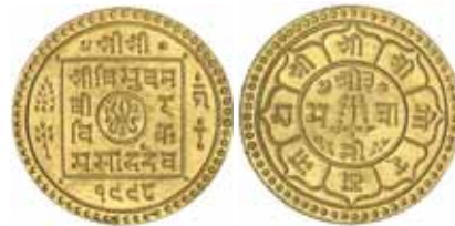
3080* Nepal , Tribhvana Bir Bikram (1911-1950), Ashraphi (tola) VS 1998 (KM.703.1). Nearly uncirculated.