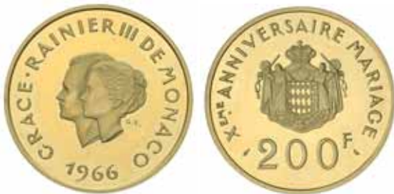
3077* Monaco , Prince Rainier III and Princess Grace, proof-like two hundred francs, 1966 (KM.X.M2). Nearly FDC.