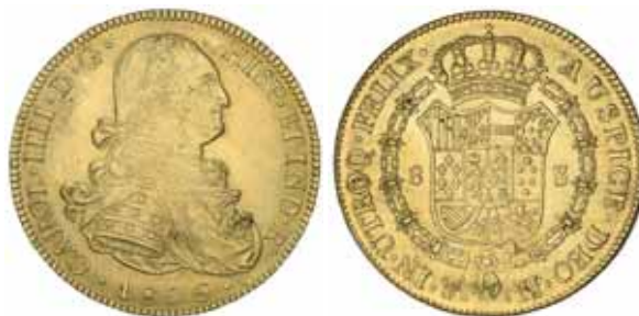
2976* Bolivia , Charles III, eight escudos, 1806PJ, Potosi Mint (KM.81). Extremely fine.