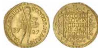
3081* Netherlands , Holland, trade coinage, ducat, 1727 (KM.12.2). Good extremely fine.