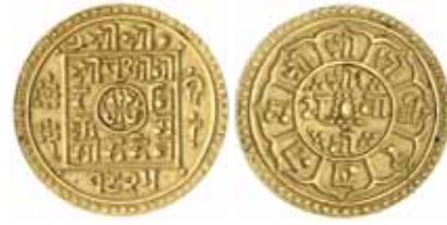
3078* Nepal , Prithvi Bir Bikram (1881-1911), tola, SE1825 (KM.674.3), plain edge. Nearly uncirculated.