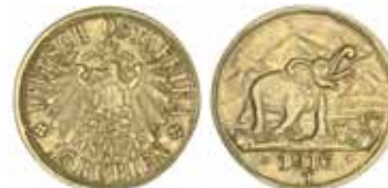
3007* German East Africa , fifteen rupien, 1916T (Tabora) (KM.16.2). Nearly extremely fine.