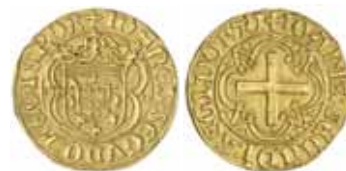
3103* Portugal , John II (1481-1495), cruzado (Fr.19). Good very fine.