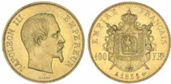
3000* France , Napoleon III, one hundred francs, 1856A (KM.786.1). Good very fine.