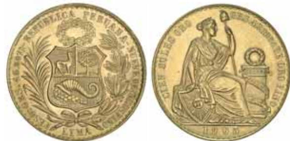
3102* Peru , Republic, one hundred soles, 1965 (KM.231). Uncirculated.