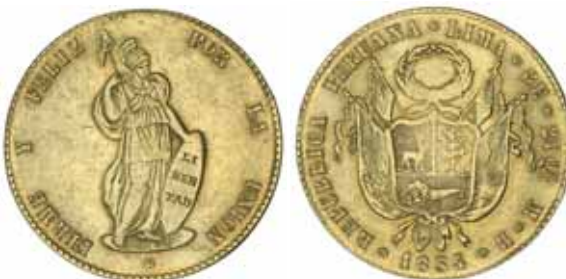
3099* Peru , Republic, eight escudos, 1854MB, Lima Mint (KM.148.4). Good very fine.