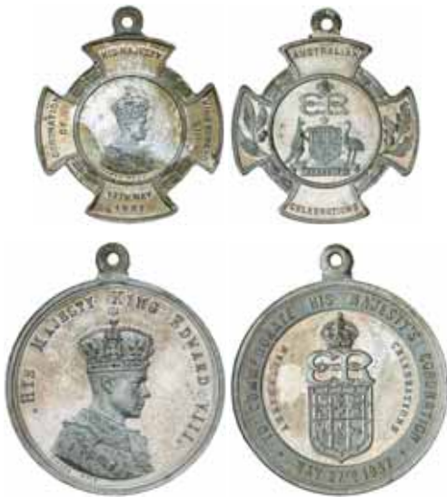
2851* Australia , Edward VIII Proposed Coronation, 1937, in silver (31mm) (G.CM263b; C.1937/8), with suspension loop, obverse, crowned and robed bust of Edward VIII right, reverse, crowned E VIII R cipher over Arms of Australia; another in silver (31mm) (G.CM264; C.1937/1), with suspension loop, obverse, crowned and robed bust of Edward VIII right, reverse, crowned E VIII R cipher over Arms of Australia including kangaroo and emu supporters. Toned, otherwise extremely fine. (2)