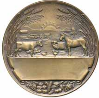
2850* Australia , Edward VIII, Victoria, Melbourne Royal Show, 1936, in bronze (54mm) (G.CM174; C.1936/9), by Stokes, unnamed, obverse, barehead of Edward VIII right, reverse, farm scene. Toned, otherwise extremely fine.