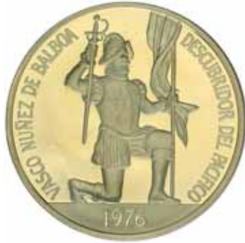
3097* Panama , proof five hundred balboa, 1976 (KM.42). In pack of issue, FDC.