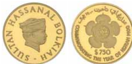
2979* Brunei , proof seven hundred and fifty dollars, AH 1400 (1980) commemorating the year of the Hejira (KM.25). Nearly FDC.