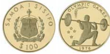
3156* Western Samoa , proof gold one hundred tala, 1976, weightlifter, struck by the Royal Australian Mint (KM.23). In case of issue with certificate, number 183, FDC.