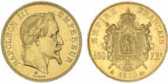
3002* France , Napoleon III, one hundred francs, 1869A (KM.802.1). A little polished, nearly extremely fine.