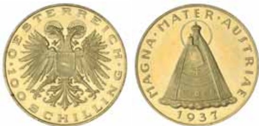
2972* Austria , Republic, one hundred schilling, 1937 (KM.2857). Proof-like uncirculated and scarce.