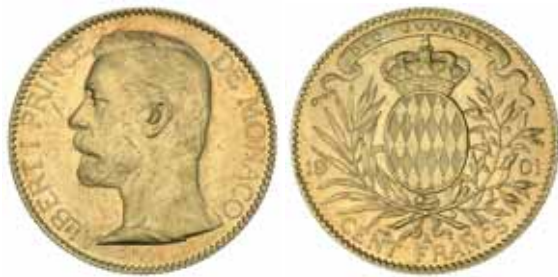
3076* Monaco , Prince Albert I, one hundred francs, 1901A (KM.105). Extremely fine/good extremely fine.