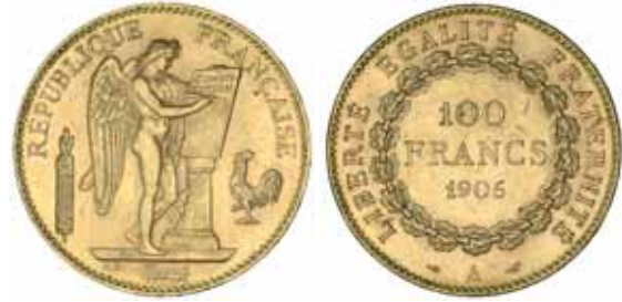
3004* France , Republic, one hundred francs, 1906A (KM.832). Nearly uncirculated.