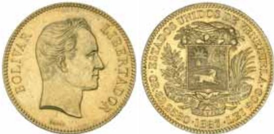
3155* Venezuela , Republic, one hundred bolivares, 1887 (KM. Y34). Extremely fine/good extremely fine.