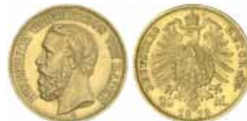
3008* Germany , Baden, Friedrich I, twenty marks, 1873G (KM.261). Nearly uncirculated.