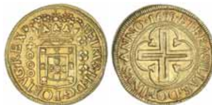
2977* Brazil , Peter II (Pedro), four thousand reis, 1699 (KM.99, Fr.21). Very fine.