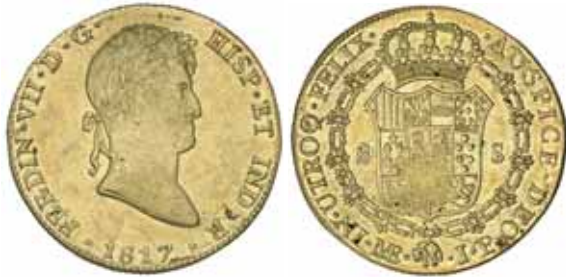
3098* Peru , Ferdinand VII, eight escudos, 1817JP, Lima Mint (KM.129.1). Nearly extremely fine.