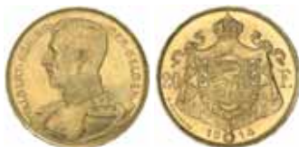
2975* Belgium , Albert, twenty francs, 1914 (KM.79). Uncirculated.