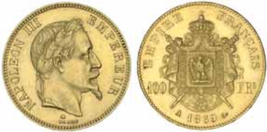
3001* France , Napoleon III, one hundred francs, 1869A (KM.802.1). Extremely fine.