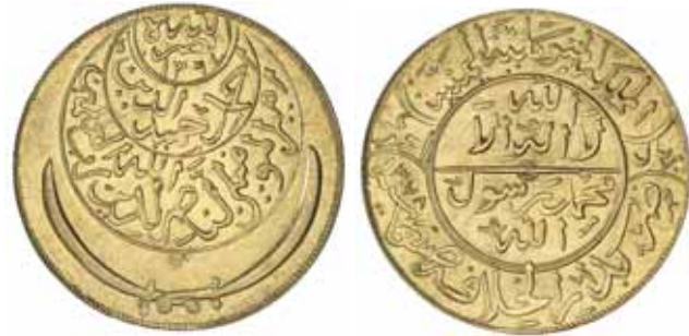
3157* Yemen , five lira or four sovereigns, gold riyal, AH1378 (KM. G17.2). Uncirculated and rare.