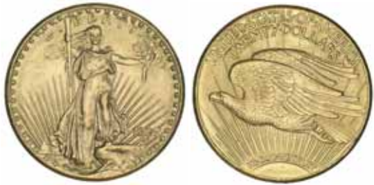
3153* USA , twenty dollars or double eagle, 1927, St Gaudens. Nearly uncirculated.