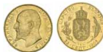
2980* Bulgaria , Ferdinand I, twenty leva, 1912, Declaration of Independence 1908 commemorative (KM.33). Extremely fine/good extremely fine.