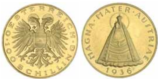
2971* Austria , Republic, one hundred schilling, 1936 (KM.2857). Proof-like, nearly uncirculated.