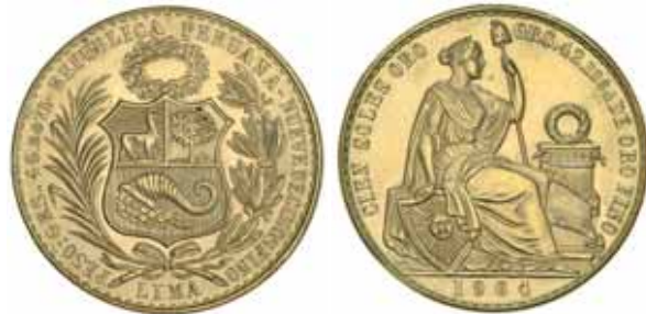
3101* Peru , Republic, one hundred soles, 1964 (KM.231). Uncirculated.