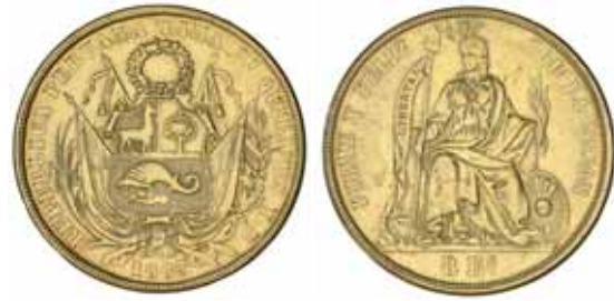
3100* Peru , Republic, eight escudos, 1863YB (KM.183). Good very fine.