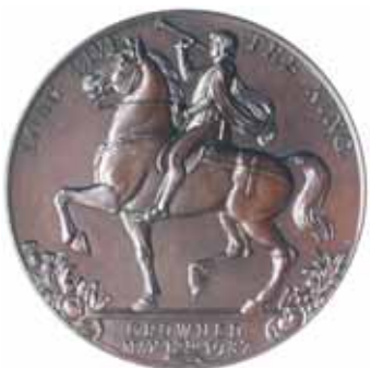
2883* Great Britain , Edward VIII Proposed Coronation, 1937, in dark bronze (44mm) (G.CM184b; BHM4284), by G.Allen, obverse, crowned and robed bust of Edward VIII right, reverse, herald on prancing horse left, standing on a plaque bordered with rose, thistle and shamrock and in relief, 'Crowned/May 12th 1937'. Small nick in left obverse field, obverse toned, otherwise uncirculated.