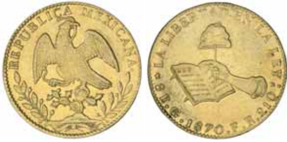
3074* Mexico , Republic, eight escudos, 1870 F.R. Guanajuato Mint (KM.383.7). Nearly uncirculated.