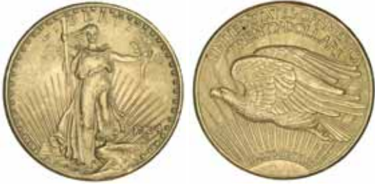
3152* USA , twenty dollars or double eagle, 1924, St Gaudens. Well struck and unmarked, uncirculated.