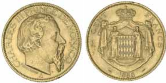
3075* Monaco , Charles III, one hundred francs, 1886A (KM.99). Extremely fine/good extremely fine.