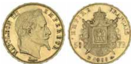
3003* France , Napoleon III, fifty francs, 1866BB (KM.804.2). Nearly extremely fine.