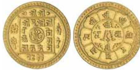
3079* Nepal , Prithvi Biv Bikram (1881-1911), double tola (duitola Asarphi) (SE1833) (KM.680). Nearly extremely fine and scarce.