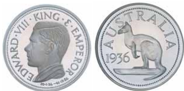
lot 2848 part