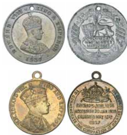
lot 2885 part (following page)