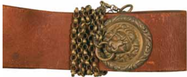
4778* NSW Military Forces , c1900, leather slip-on shoulder belt with attached brass metal lion boss keeper (cf Grebert p116) with chain and attached at the other end is a brass whistle in a fitted brass holder affixed to the belt, also attached to the belt by white metal rings are floral patterned white metal brackets for fitting to a belt pouch. Very fine.