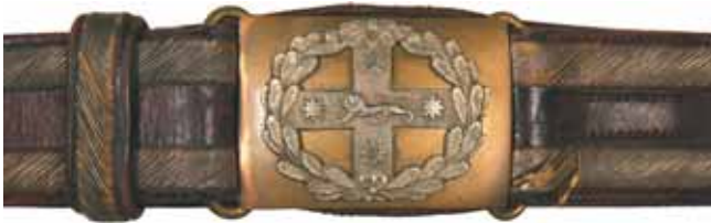
4777 NSW Military Forces , c1899, leather shoulder belt with attached white metal lion boss keeper (Grebert p116) with chain and attached at the other end is a white metal whistle in a fitted white metal holder affixed to the belt, also attached to the belt by brass rings is a pouch, this missing badge. Fine - very fine.