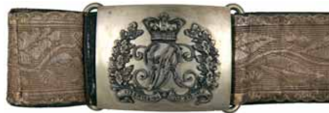
4774* NSW Military Forces , pre Federation, silk covered leather belt with officer's universal type buckle (Grebert p99) in white metal and with two attached belts including sword sling, both with buckle (cf Grebert p107) in white metal. Stitching on silk attaching it to belt is loose in places, otherwise very good, belt buckle very fine.