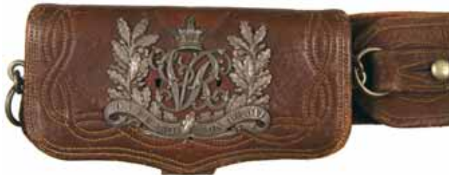
4775* NSW Military Forces , shoulder belt and attached pouch with affixed universal type staff officer's badge in white metal (cf Grebert p99). Pouch with pierced holes for prior badge, otherwise pouch and belt fine, the badge very fine.