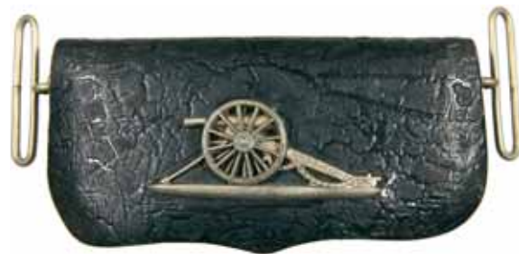
4779* Australian States , pouch with universal Permanent Artillery badge, c1880s-1890s, in white metal (83x38mm) (Grebert p126), pouch with white metal floral fittings at sides with attached belt fittings. The top of the ramrod is missing from the badge, otherwise very fine, the pouch in very fine condition for its age.