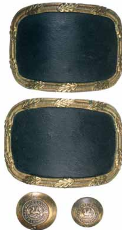
lot 4737 part