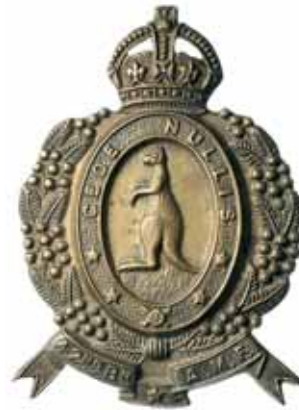
4723* Australia , 42nd Infantry Battalion (The Capricornia Regiment) 1930-39, hat badge in brass (52mm). Very fine .