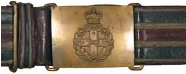
4772* NSW Military Forces , pre Federation dress belt with buckle (Grebert p96) in brass and with attached sword belt sling with buckle (Grebert p102) in brass. Fine.