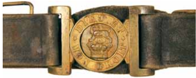
4776* NSW Military Forces , post 1881, belt and British General Service Pattern buckle in brass (Grebert p101). Fine.