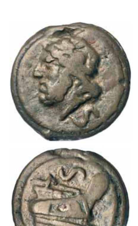
4615* Republic, Anonymous, (c.240-225 B.C.), Aes Grave Series, Rome mint, AE semis, (127.78 g), obv. Saturn head to left, S below, rev. prow of galley to right with S above, (S.574, Cr.35/2, Syd.73). Bronze coloured patina, casting fault on obverse above head, very fine and very scarce.