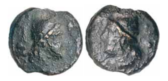
4614* Republic , Anonymous Series, (c.280-269 B.C.), AE cast sextans, (49.30 g), obv. Dioscuri head right in conical cap two pellets behind, rev. other Dioscuri head to left in conical cap two dots behind, (S.552, Cr.18/5, Syd.19). Very deeply toned, edge breaks, usual rough surface, fine and very scarce.