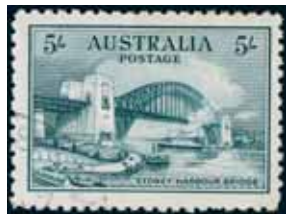
3553* Australia , Sydney Harbour bridge, 5/- blue-green, no Wmk., SG 14338 (CV £190). Very fine used .

The cover with Kingsford-Smith signature comes with a signed letter of authenticity from Robert Kennedy, dated 18.09.2010.