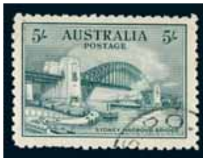
3554* Australia , 1932 5/- Bridge, well-centred 'CTO', (CV $350). Fine used .