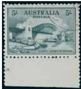
3552* Australia , 5/- bridge, (SG 143). CTO with full gum, with bottom selvege as part of imprint block.