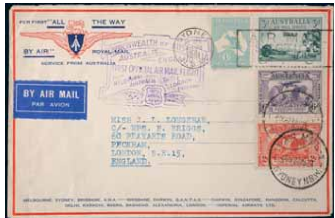
3556* Australia , George V, 1931, April 23, First Official Air Mail Cover Melbourne to London, fixed with 1/- kangaroo, 3d air mail, 2d and 6d Kingsford Smith, on a display sheet with write up. Used .