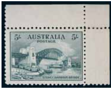
3551* Australia , Opening of Sydney Harbour Bridge, 5/- blue-green a top RHS corner piece, SG 143. MUH , a well centred example.