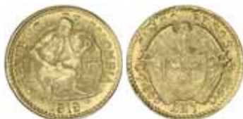
2219* Colombia , Republic, five pesos, 1919 (KM.195.1). Nearly uncirculated.