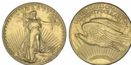
2301* USA , twenty dollars or double eagle, 1924, St.Gaudens. Good extremely fine.