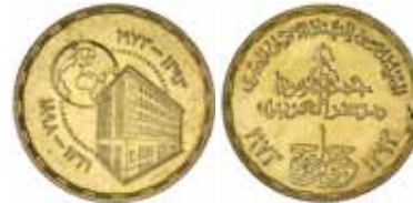
2222* Egypt , Arab Republic, one pound (1973) 75th Anniversary of the National Bank (KM.440). Choice uncirculated.