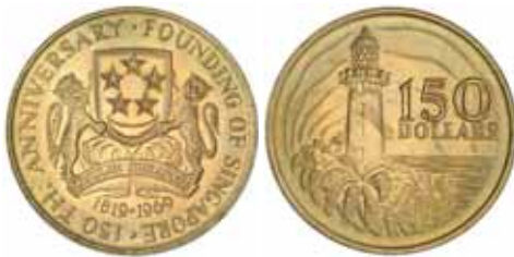
2270* Singapore , mint one hundred and fifty dollars, 1969, 150th Anniversary of the Founding of Singapore (KM.7). In case of issue, uncirculated.