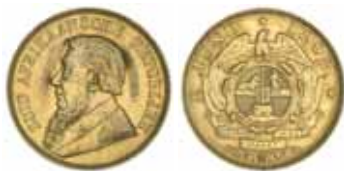
2271* South Africa , ZAR, Paul Kruger, one pond, 1892, double shaft (KM.10.1). A little rubbed, otherwise extremely fine and scarce thus.