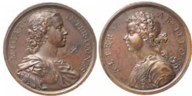
2093* Prince Charles and Prince Henry: Legitimacy of Jacobite Succession (1731) , in bronze (41mm), by O.Hamerani (MI 492/34; Eimer 521), 'He shines in the midst of all/the next after him', edge lettered. Extremely fine.