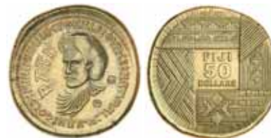
2223* Fiji , fifty dollars, half ounce natural Fiji gold, minimum 18 carat (1990) privy mark boar tusk (KM.58a). In case of issue with certificate, uncirculated.