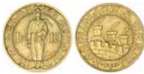
2268* San Marino , Republic, ten lire 1925R, (3.22g) (KM.7). Brilliant uncirculated, rare.