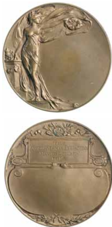
2142* The Anglo-German Exhibition , 1913, award medal in bronze (51mm), by Elkington & Co, obverse, female figure at left holding a wreath in her extended arm, reverse, flowers above a plaque inscribed, 'The/Anglo-German Exhibition/May To October/1913', below another scroll-like area for inscribing recipient's name, unnamed. In case of issue by Elkington & Co Ltd, small spot of oxidation on reverse, otherwise nearly uncirculated and scarce.

With research on Oakwood Park Hotel Golf Club, Conway, North Wales.