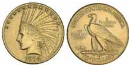
2296* USA , ten dollars or eagle, 1914D, Indian head. Good extremely fine.