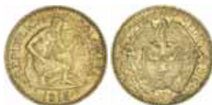
2218* Colombia , Republic, two and a half pesos, 1913 (KM.194). Nearly uncirculated.