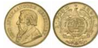
2273* South Africa , ZAR, Paul Kruger, pond, 1898 (KM.10.2). Mint bloom, good extremely fine.