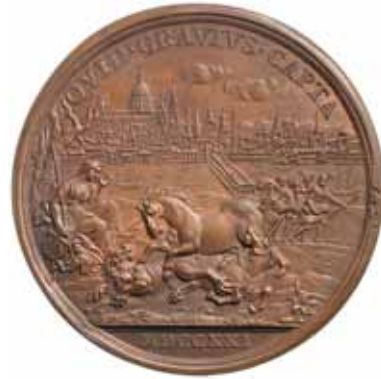
2090* Princess Clementina , Escape from Innsbruck, 1719, in bronze (48mm), by O.Hamerani (MI 444/49; Eimer 454). Good extremely fine.