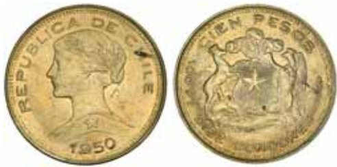
2215* Chile , Republic, one hundred pesos, 1950 (KM.175). Nearly uncirculated.