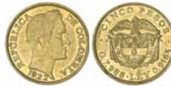
2221* Colombia , Republic, five pesos, 1922 (KM.201.1). Nearly uncirculated.