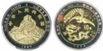
2216* China , People's Republic, bi-metallic proof ten yuan, 1994, Great Wall/Phoenix (KM.A625). FDC.