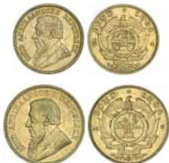
2272* South Africa , ZAR, Paul Kruger, half pond and pond, 1894 (KM.9.2, 10.2). Very fine; good very fine. (2)

Ex Western Australia Day Raffle Set, 1915.