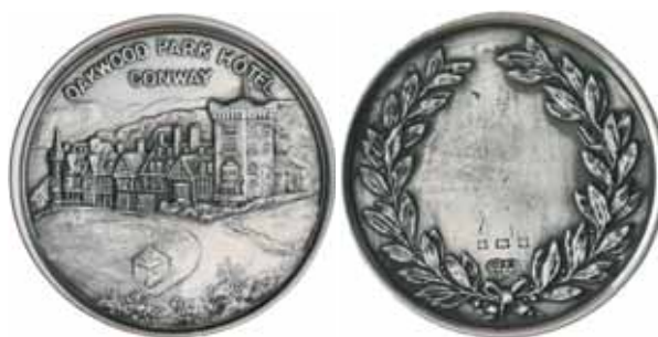
2144* North Wales , Oakwood Park Hotel, Conway, Golf Club medal, (1915), in silver (40mm), hallmarked for Birmingham 1915, obverse, image of the hotel with golf club at front, reverse, laurel wreath, unnamed. Scuffing on reverse, polished, otherwise good very fine.