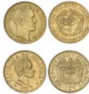
2220* Colombia , Republic, two and a half pesos, 1919 and 1927 (KM.200, 203). Good extremely fine. (2)