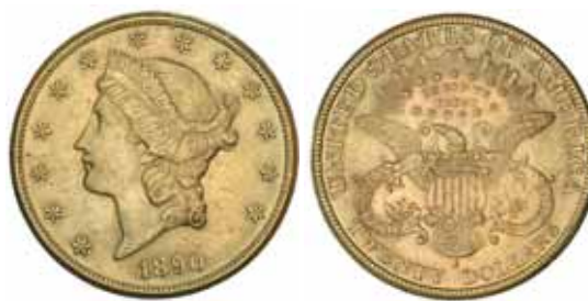
2298* USA , twenty dollars or double eagle, 1890S, Liberty head. Extremely fine.