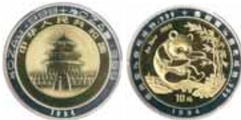
2217* China , People's Republic, bi-metallic proof ten yuan, 1994 (1/10 oz gold, 1/28 oz silver) temple/panda (KM.A625). FDC.