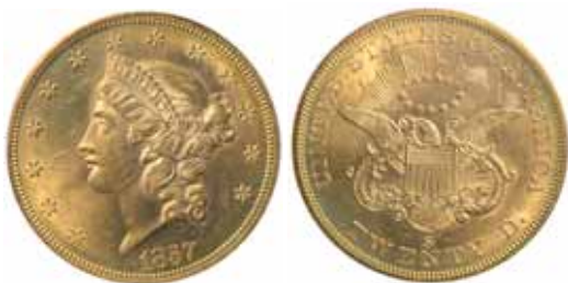
2297* USA , twenty dollars or double eagle, 1857S, Liberty head. Full mint bloom, uncirculated and rare thus.