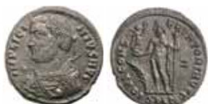
lot 4542 part