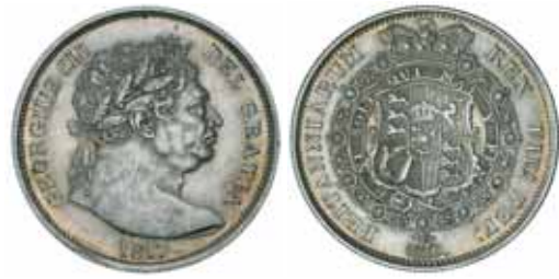
1668* George III , new coinage, halfcrown, large or 'bull' head, 1817 (S.3788). Golden peripheral tone, good extremely fine.