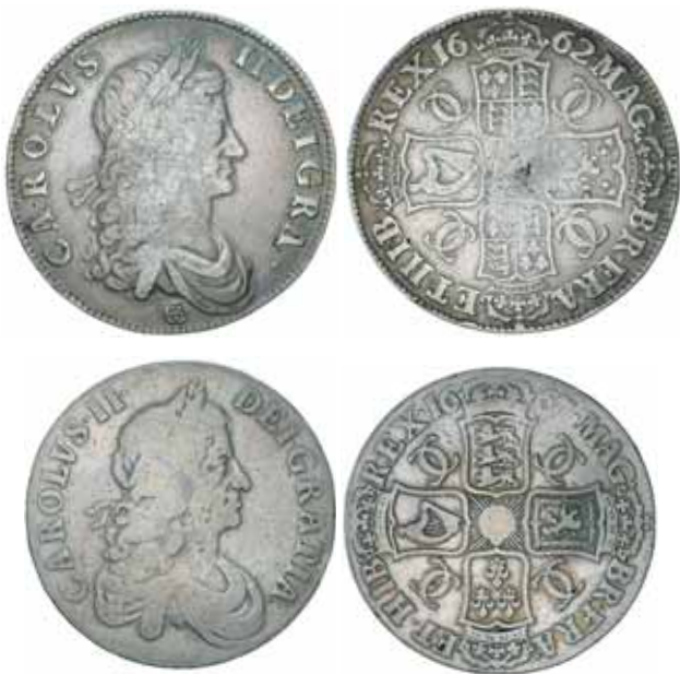
1654* Charles II , crown, first bust, 1662 rose below; second bust, crown, 1667 (S.3550, 3357). Nearly fine; very good. (2) $200