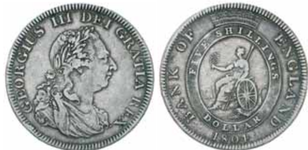
1675* George III , Bank of England, dollar or five shillings, 1804 top leaf to left side of E (S.3768). Nearly fine.