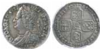
1666* George II , old head, sixpence, 1745 Lima (S.3710). Toned extremely fine.