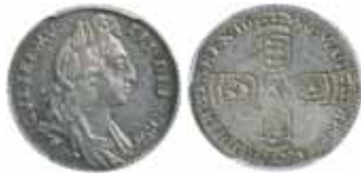
1664* William III , first bust, sixpence, 1697 early harp (S.3520). Lightly toned, good extremely fine.