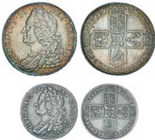
1665* George II , old head, halfcrown and shilling, 1745 Lima (S.3695, 3703). Toned, very fine. (2)