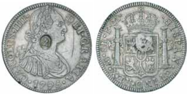
1672* George III , emergency issue, dollar (4/9), oval countermark on Charles III Mexico City Mint eight reales, 1795FM (S.3765). Scratched, good very fine.