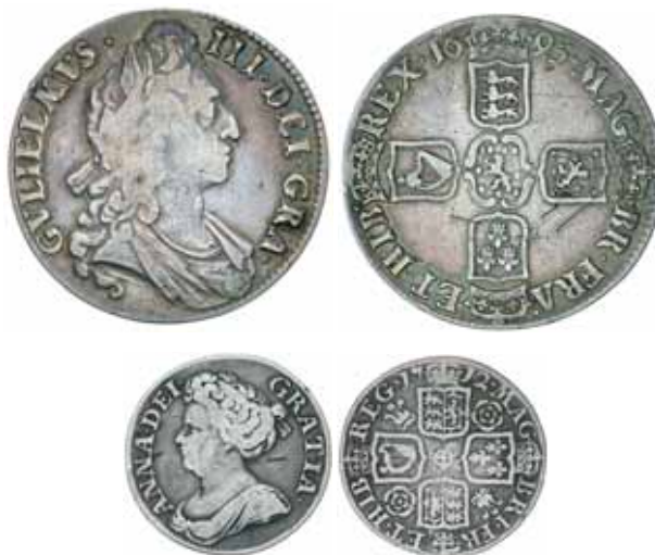
1662* William III , first bust, crown, 1695; Anne , after the Union, fourth bust, shilling, 1712 roses and plumes (S.3470, 3617). Nearly fine; very good. (2) $120