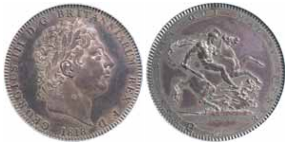
1680* George III , new coinage, crown, 1818 LVIII (S.3787). Dull grey paper tone over full subdued mint surface, good extremely fine.