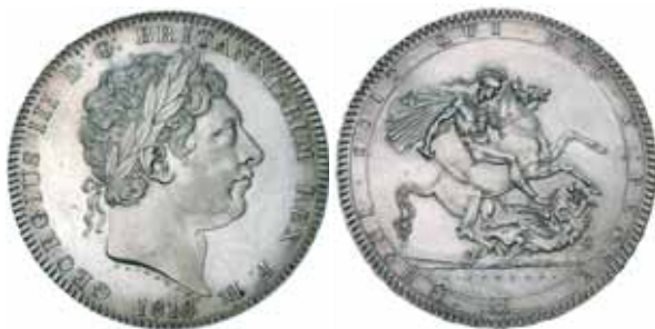
1681* George III , new coinage, crown, 1818 LVIII (S.3787). Lightly toned, minor surface marks, otherwise good extremely fine, scarce.