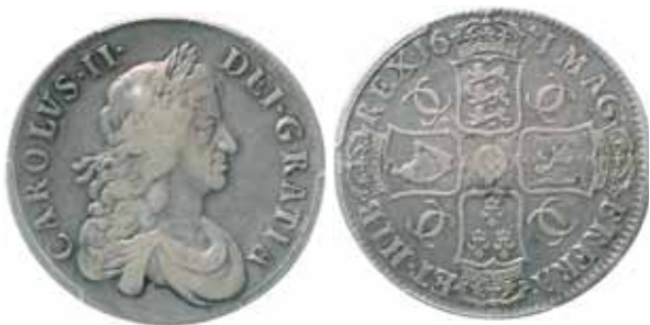
1655* Charles II , crown, second bust, 1671 (S.3357). Lightly toned, good fine. $250