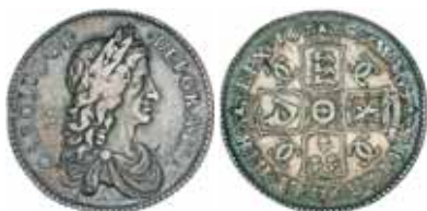
1657* Charles II , shilling, first bust, 1663 (S.3371) top ribbon opposite 0. Toned, nearly very fine. $450