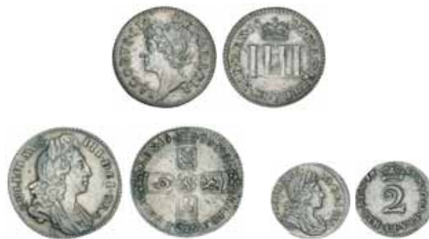
1659* James II , fourpence, 1687/6 (S.3414); William III , first bust sixpence, 1696 (S.3520; twopence, 1698 (S.3551A). Good very fine - extremely fine. (3) $240