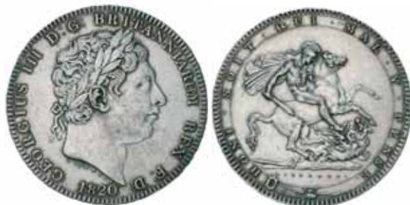
1683* George III , new coinage, crowns, 1819 LIX, 1820 LX (S.3787). Nearly fine; nearly very fine. (2)