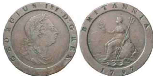
1678* George III , second issue, cartwheel twopence, 1797 (S.3776). A few small edge bumps, otherwise good fine.