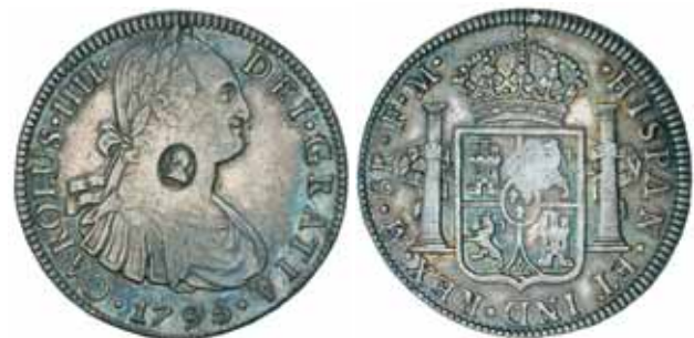
1670* George III , emergency issue, dollar (4/9) oval countermark in the centre of obverse of Charles III Mexico City Mint eight reales, 1795FM (S.3765a). Peripheral tone, good very fine.