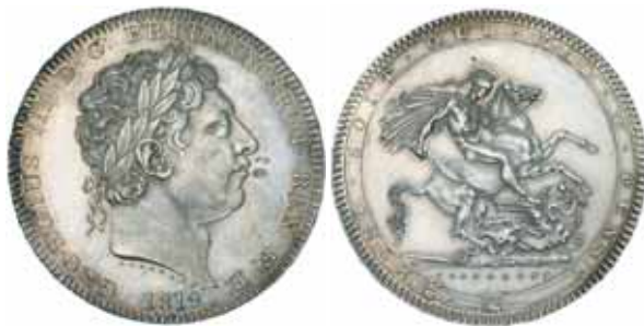
1682* George III , new coinage, crown, 1819 LIX (S.3787). Golden peripheral iridescent tone, good extremely fine.