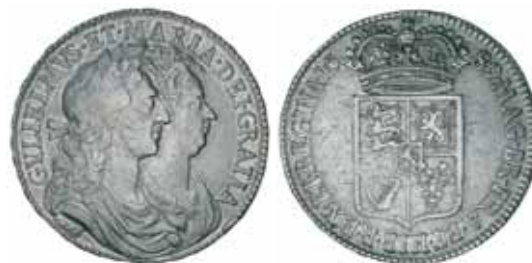
1660* William and Mary , halfcrown, first busts and reverse, 1689 (S.3434). Cleaned, nearly very fine. $250