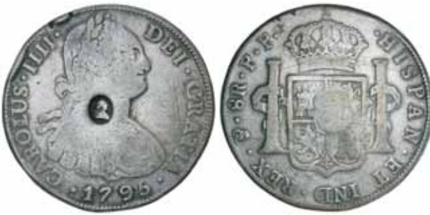
1673* George III , emergency issue, silver dollar, oval countermark on Charles III Potosi Mint eight reales, 1795PP (S.3765A). Soft strike on portrait, edge knocks and wear (possibly once mounted), otherwise nearly fine, countermark good very fine, rare.