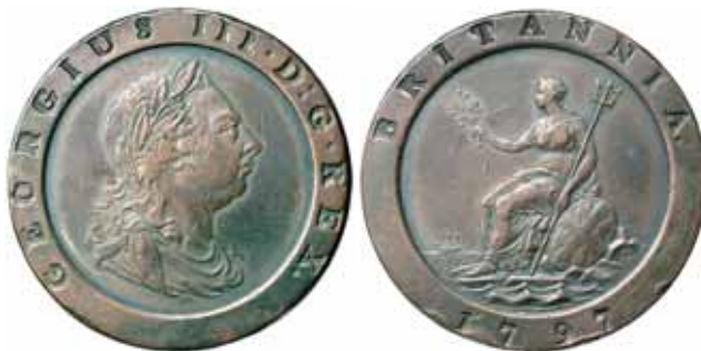
1677* George III , second issue, cartwheel twopence, 1797 (S.3776). Usual small edge bumps, otherwise very fine.