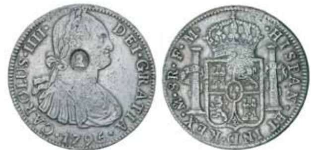
1671* George III , emergency issue, silver dollar with oval countermark on a Charles III Mexico City eight reales, 1795FM (S.3765A). Usual surface marks, lightly toned, good fine, countermark good very fine.