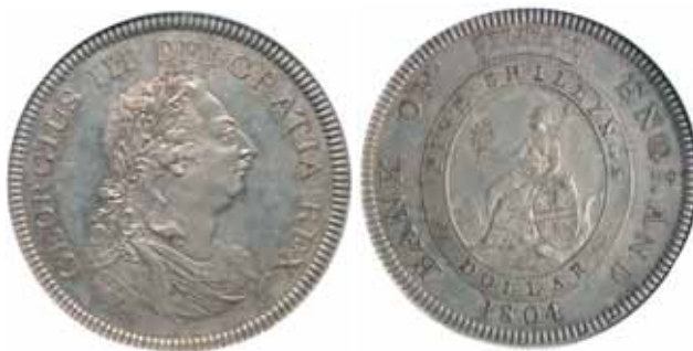
1674* George III , Bank of England, proof silver dollar or five shillings, 1804, stop after REX, (S.3768, ESC 145). Light blue and gold patination, nearly FDC and very rare.