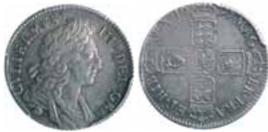
1663* William III , third bust, shilling, 1697 (S.3505). Toned, good extremely fine.