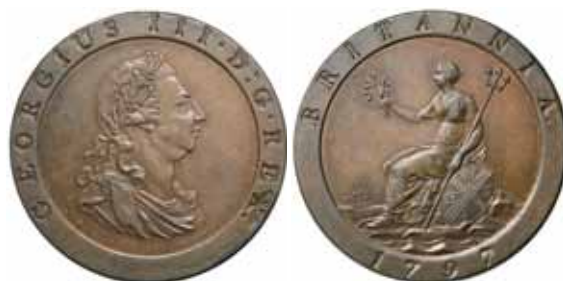
1679* George III , second issue, cartwheel penny, 1797 (S.3777). Brown, good extremely fine.