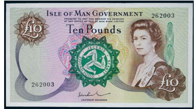
3448* Isle of Man, Isle of Man Government, Elizabeth II, ten pounds, undated (1972), 262003 (P.31b). Uncirculated and rare.