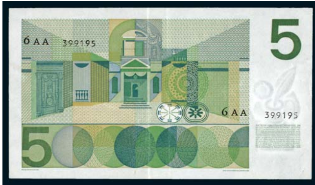
3529* Netherlands, De Nederlandsche Bank, five gulden, 26 April 1966, 6AA 399195, experimental issue (P.90c). Nearly extremely fine and rare. $200