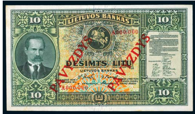
3489* Lithuania, Lietuvos Bankas, specimen ten litu, 16.2.1938, A 000,000, PAVYZDYS in red diagonally in two places on front and horizontally at lower back (P.28s). Virtually uncirculated and very rare. $4,000