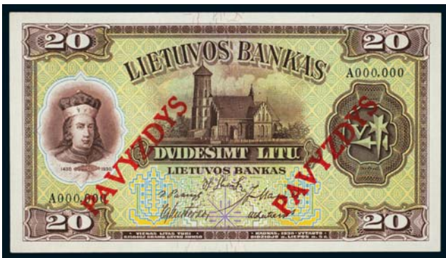
3488* Lithuania, Lietuvos Bankas, specimen twenty litu, 5.7.1930, A 000,000, PAVYZDYS in red diagonally in two places on front and horizontally in two places on the back (P.27s2). Good extremely fine. $150