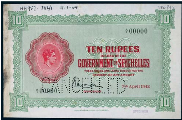
3576* Seychelles, Government of Seychelles, George VI, specimen ten rupees, 7th April 1942, A/1 00000, imprint of Thomas de la Rue & Company Limited, London, CANCELLED perforated at signature, SPECIMEN in blue in bottom margin, printer's instructions 'HH957-3112/1-11.1.44-250 B/2' in top margin (P.9s). Remnants of glue at left on front and right on back, having been mounted in a book, otherwise extremely fine.