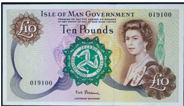
3447* Isle of Man, Isle of Man Government, Elizabeth II, ten pounds, undated (1972), 019100 (P.31a). Uncirculated and very rare.