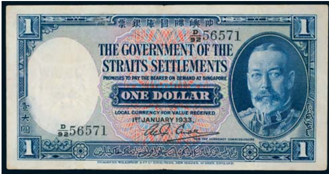
3608* Straits Settlements, The Government of the Straits Settlements, George V, one dollar, 1st January 1933, D/92 56571 (P.16a). Flattened, minute nicks in central vertical fold top and bottom margins, otherwise very fine and very rare.