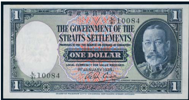
3609* Straits Settlements, The Government of the Straits Settlements, George V, one dollar, 1st January 1935, L/31 10084 (P.16b). Uncirculated and rare.