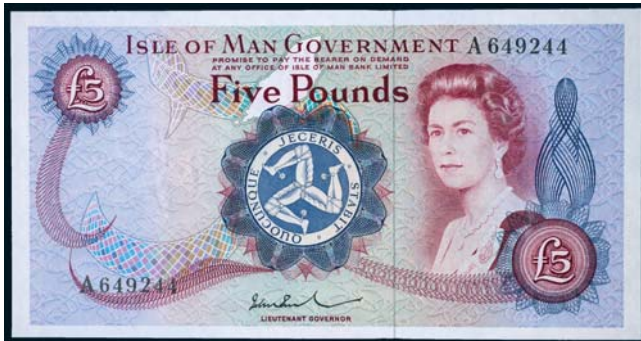
3446* Isle of Man, Isle of Man Government, Elizabeth II, five pounds, undated (1972), A 649244 (P.30b). Uncirculated and scarce.