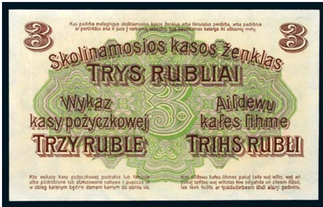
3397* Germany , regional occupation of Lithuania, WWI, State Loan Bank currency notes, Eastern Bank of Commerce and Industry, Posen (Poznan), three rubel, 17 April 1916, S 776492 (P.R123b). Nearly uncirculated.