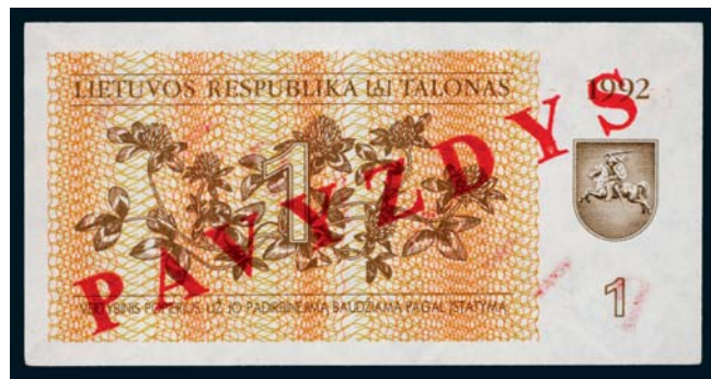
3491* Lithuania, Lietuvos Bankas, specimen one talonas, 1992, PE 008257, PAVYZDYS in red diagonally both sides (P.39s). Uncirculated. $80