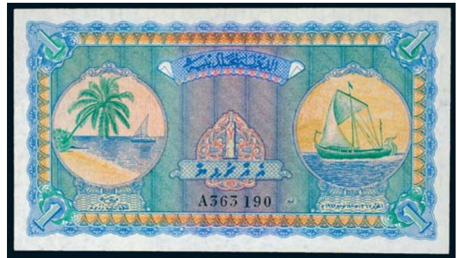
3517* The Maldives, Maldivian State, Government Treasurer, one, five and ten rupees, 14.11.1947/AH1367, A363190, A293878 and A221024 (P.2a, 4a, 5a). Uncirculated. (3)