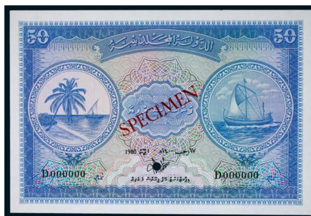
3521* The Maldives, Maldivian State, Government Treasurer, specimen fifty rupees, 1.8.1980/AH.17.7.1400, D000000, SPECIMEN in red diagonally front and back, single punch hole cancellation at signature, numbered 029 in top left margin on back (P.6s). Uncirculated.