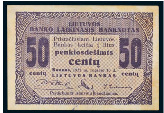
3477* Lithuania, Lietuvos Bankas, fifty centu, 10.9.1922 (P.4a). Nearly uncirculated.