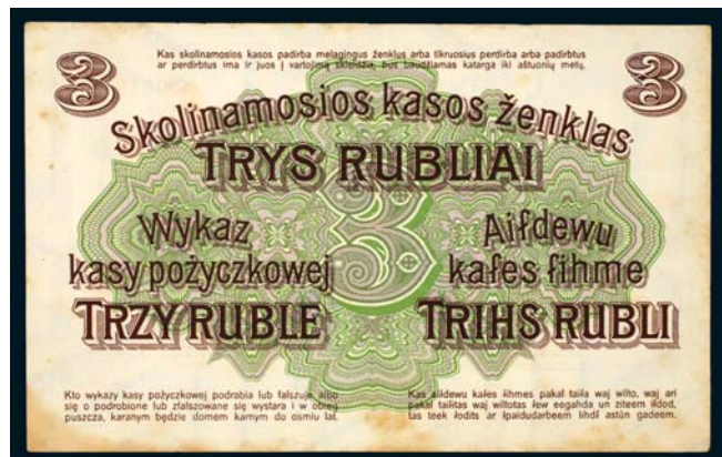
3396* Germany , regional occupation of Lithuania, WWI, State Loan Bank currency notes, Eastern Bank of Commerce and Industry, Posen (Poznan), three rubel, 17 April 1916, C 001970 (P.R123a). Some foxing, nearly uncirculated and scarce.