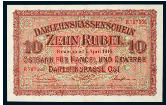
3399* Germany , regional occupation of Lithuania, WWI, State Loan Bank currency notes, Eastern Bank of Commerce and Industry, Posen (Poznan), ten rubel, 17 April 1916, E 787688 (P.R124). Nearly uncirculated and scarce.