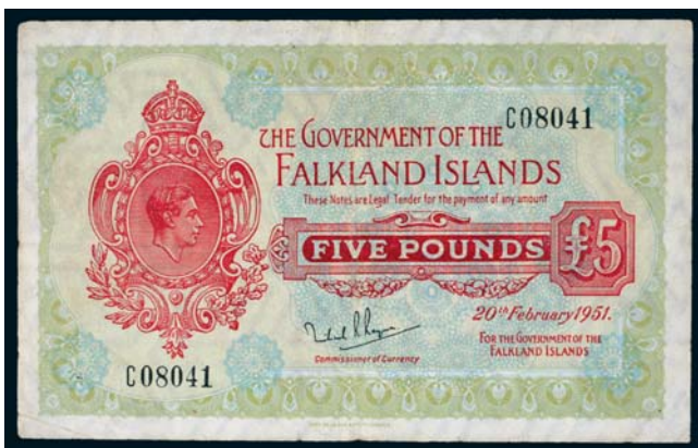
3361* Falkland Islands , The Government of the Falkland Islands, George VI, five pounds, 20th February 1951, C 08041 (P.6). Creases and folds, good fine and rare.