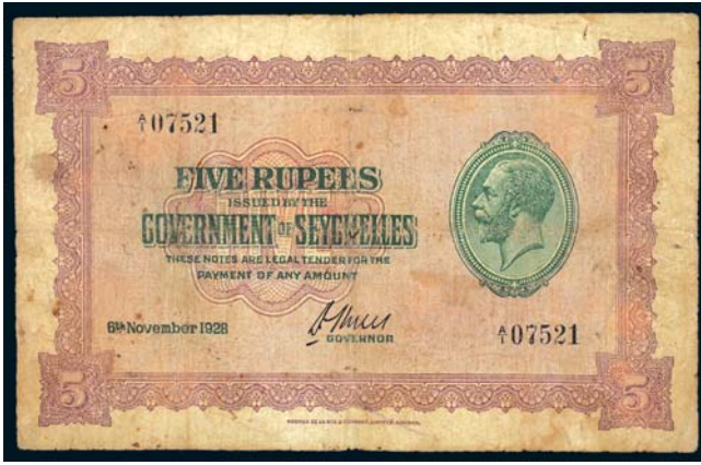
3573* Seychelles, Government of Seychelles, George V, five rupees, 6th November 1928, A/1 07521 (P.3a). Many small holes in body, stains and pen annotations on back, otherwise nearly fine.