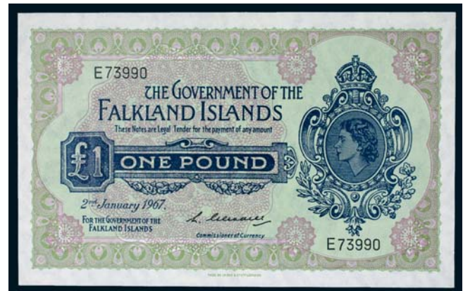
3364* Falkland Islands , The Government of the Falkland Islands, Elizabeth II, one pound, 2nd January 1967, E 73990 (P.8a). Uncirculated.