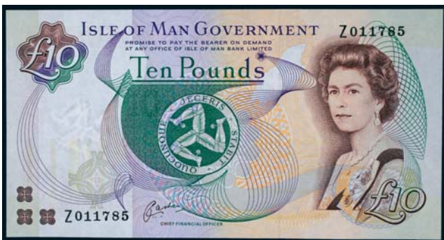
3454* Isle of Man, Isle of Man Government, Elizabeth II, ten pounds, undated (1983), Z 011785 (P.42r) replacement note. Uncirculated. $100