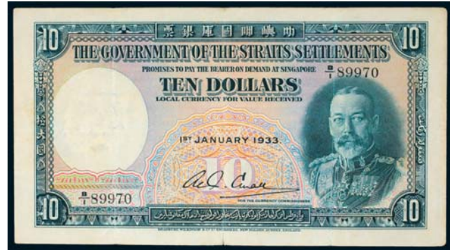
3611* Straits Settlements, The Government of the Straits Settlements, George V, ten dollars, 1st January 1933, B/1 89970 (P.18a). Flattened of folds, centre vertical fold with repaired 5mm split at bottom, otherwise good fine and very rare.