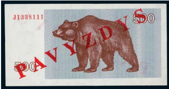
3493* Lithuania, Lietuvos Bankas, specimen five hundred talonas, 1992, JI 338111, PAVYZDYS in red diagonally both sides (P.44s). Uncirculated.