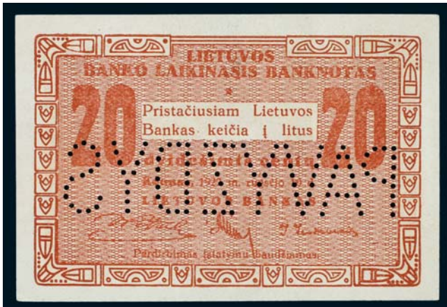
3474* Lithuania, Lietuvos Bankas, specimen twenty centu, 10.9.1922, PAVYZDYS perforated in centre (P.3s1). Uncirculated.