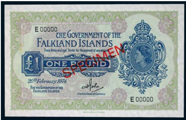
3365* Falkland Islands , The Government of the Falkland Islands, Elizabeth II, specimen one pound, 20th February 1974, E 00000, imprint of Thos de la Rue & Co Ltd, London, SPECIMEN in red diagonally both sides (P.8bs). Uncirculated and rare.