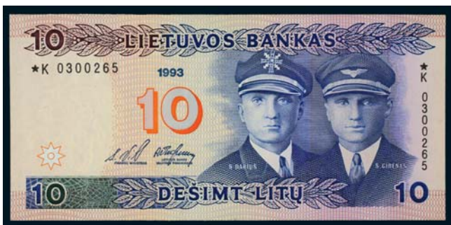
3494* Lithuania, Lietuvos Bankas, ten and fifty litu, 1993, *K 0300265, *Q 0326168 (P.56r, 58r) replacement notes. Good extremely fine and scarce. (2)