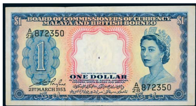
3514* Malaya and British Borneo, Board of Commissioners of Currency, Elizabeth II, one dollar, 21st March 1953, A/28 872350 (P.1a); five dollars, A/1 879982 (P.2a). Nearly uncirculated; very fine. (2)