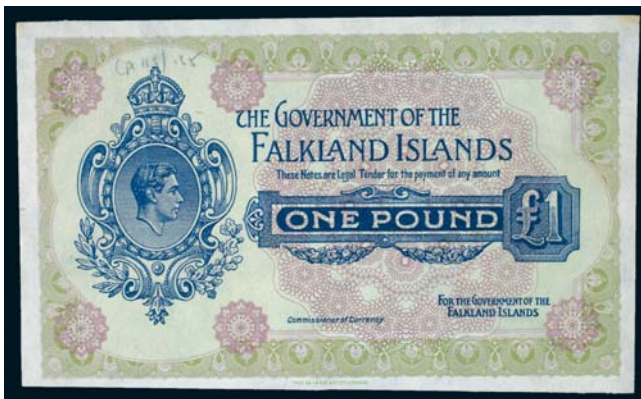
3360* Falkland Islands , The Government of the Falkland Islands, George VI, uniface one pound printer's proof on paper, c1937, printer's notation top left 'CA 115/135' (cP.5). Pen and pencil marks on back, extremely fine.