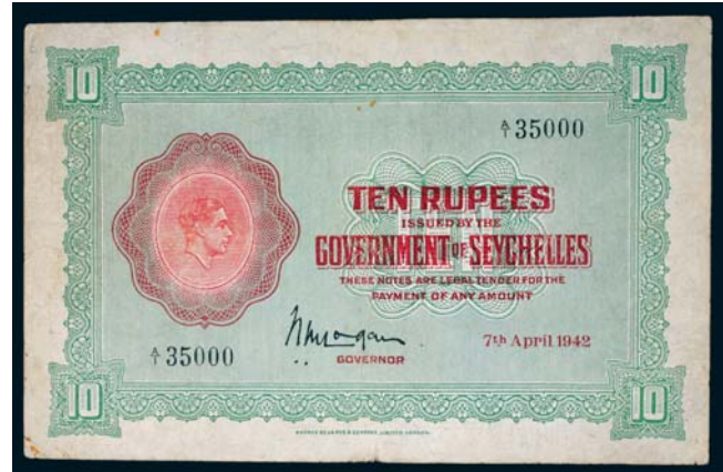
3577* Seychelles, Government of Seychelles, George VI, ten rupees, 7th April 1942, A/1 35000 (P.9). Pencilled numbers on back, small tone spots, nick in bottom margin at centre fold, flattened, fine.