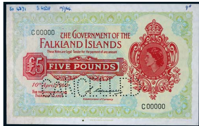
3370* Falkland Islands , The Government of the Falkland Islands, Elizabeth II, specimen five pounds, 10th April 1960, C 00000, imprint of Thos de la Rue & Co Ltd, London, CANCELLED perforated at signature, printer's instructions 'SO 4371-G.6528-19/3/64-9A' penned in top margin (P.9as). Remnants of glue on front left and back right, good extremely fine and rare.