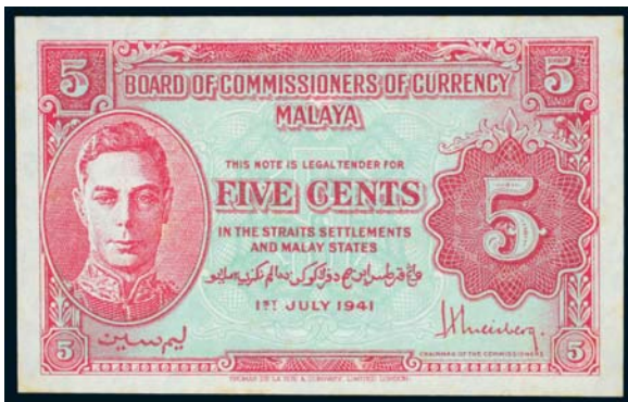
3511* Malaya, Board of Commissioners of Currency, George VI, five, ten and twenty cents, 1st July 1941 (P.7a, 8, 9a, 9b). Uncirculated and rare in this condition. (4)