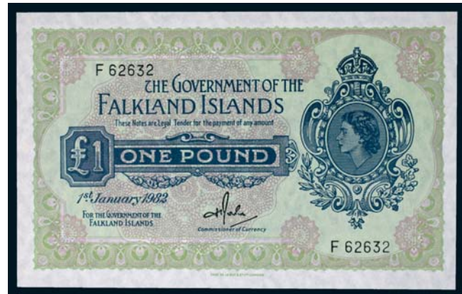
3368* Falkland Islands , The Government of the Falkland Islands, Elizabeth II, one pound, 1st January 1982, F 62632 (P.8d). Uncirculated.