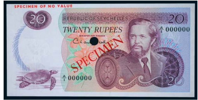
3584* Seychelles, Republic of Seychelles, specimen twenty rupees, undated (1977), A/1 000000, SPECIMEN in red diagonally both sides, SPECIMEN OF NO VALUE in red top left margin on front and back, single punch hole cancellation at signature, numbered 030 in top left margin on back (P.20s). Uncirculated.