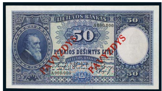
3485* Lithuania, Lietuvos Bankas, specimen fifty litu, 31.3.1928, A 000,000, CANCELLED perforated below, PAVYZDYS in red diagonally in two places on front and horizontally in two places on the back (P.24s2). Uncirculated.