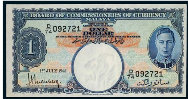
3512* Malaya, Board of Commissioners of Currency, George VI, one dollar, 1st July 1941 (1945), D/74 092721 (P.11). Extremely fine and scarce.