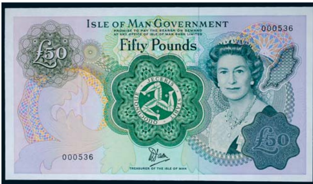
3453* Isle of Man, Isle of Man Government, Elizabeth II, fifty pounds, undated (1983), 000536 (P.39a). Uncirculated. $120