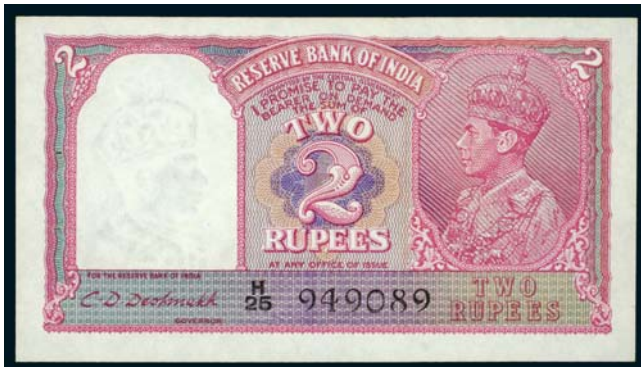
3430* India , Reserve Bank of India, George VI, two rupees, undated (issued 1944), C.D.Deshmukh, H/25 949089, black serial numbers (P.17b). Staple holes at left, nearly uncirculated.