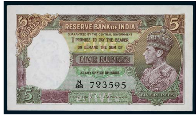
3432* India , Reserve Bank of India, George VI, five rupees, undated (issued 1943), signature C.D.Deshmukh, N/88 723595 (P.18b). Staple holes and spike hole at left, otherwise uncirculated and scarce.