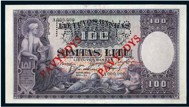
3486* Lithuania, Lietuvos Bankas, specimen one hundred litu, 31.3.1928, A 000,000, PAVYZDYS perforated at top and in red diagonally in two places on front and horizontally in two places on the back (P.25s). Good extremely fine. $200