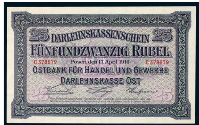
3401* Germany , regional occupation of Lithuania, WWI, State Loan Bank currency notes, Eastern Bank of Commerce and Industry, Posen (Poznan), twenty five rubel, 17 April 1916, C 378679 (P.R125). Good extremely fine and rare.