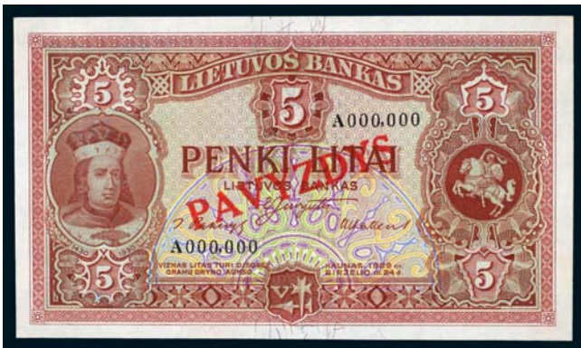
3487* Lithuania, Lietuvos Bankas, specimen five litai, 24.6.1929, A 000,000, PAVYZDYS in red diagonally on front and horizontally in two places on the back (P.26s2). Uncirculated. $150