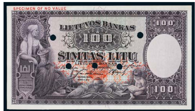
3497* Lithuania, Lietuvos Bankas, specimen one hundred litu, 31.3.1928, five punch hole cancellation, SPECIMEN OF NO VALUE in red top left margin both sides (P.100s). Uncirculated.