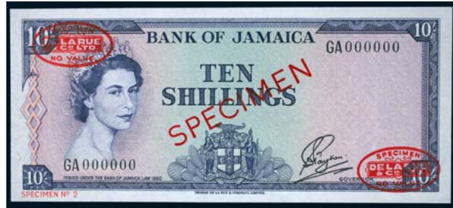
3456* Jamaica, Bank of Jamaica, Elizabeth II, de la Rue specimen ten shillings, undated (1961), GA 000000, SPECIMEN in red diagonally front and back, de la Rue specimen lozenges in red top left and bottom right both sides, SPECIMEN No. 2 in red at bottom left on front (P.50s). Uncirculated. $300