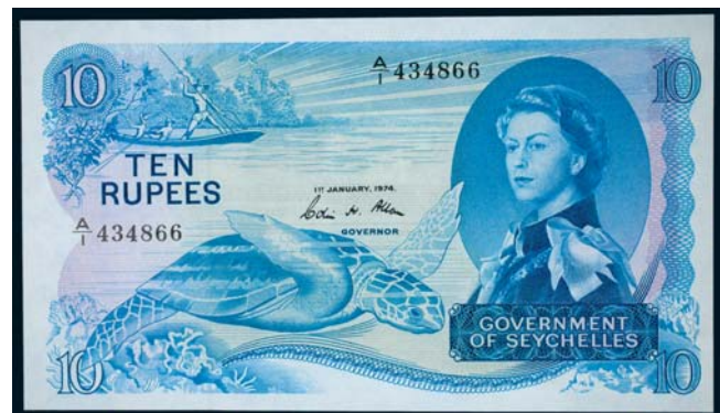
3579* Seychelles, Government of Seychelles, Elizabeth II, ten rupees, 1st January, 1974, A/1 434866 (P.15b). Uncirculated and rare.

In a holder by PMG as 67 Superb Gem Unc.