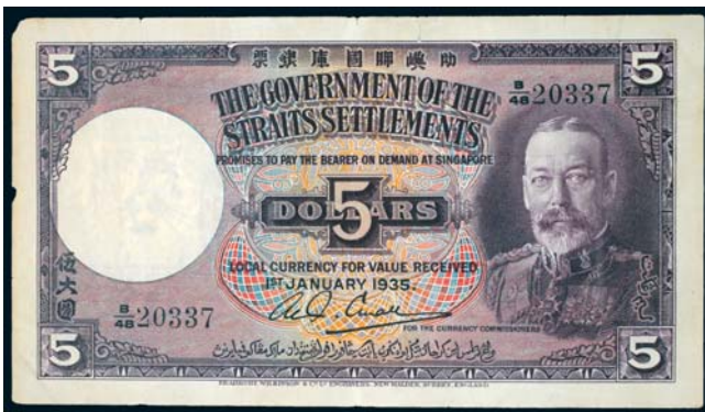
3610* Straits Settlements, The Government of the Straits Settlements, George V, five dollars, 1st January 1935, B/48 20337 (P.17b). Crisp original paper, four small tears and left corner tip off in top margin, chip out of left margin, otherwise very fine and scarce.