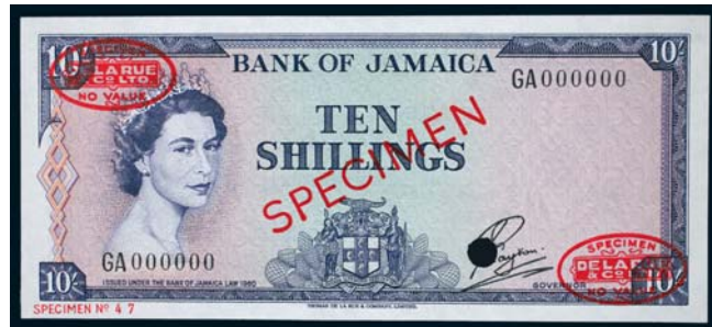
3457* Jamaica, Bank of Jamaica, Elizabeth II, de la Rue specimen ten shillings, undated (1961), GA 000000, SPECIMEN in red diagonally front and back, de la Rue specimen lozenges in red top left and bottom right both sides, SPECIMEN No. 47 in red at bottom left on front (P.50s). Uncirculated. $300