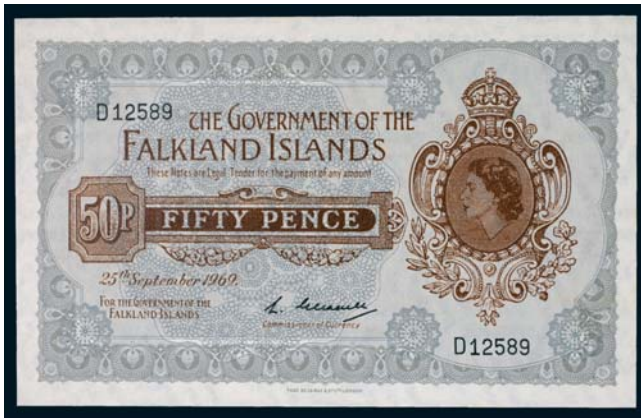
3372* Falkland Islands, The Government of the Falkland Islands, Elizabeth II, fifty pence, 25th September 1969, D 12589 (P.10a). Uncirculated. $70