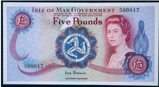
3445* Isle of Man, Isle of Man Government, Elizabeth II, five pounds, undated (1972), 500017 (P.30a). Uncirculated and rare.