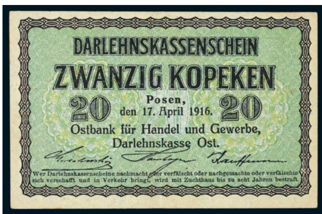
3393* Germany , regional occupation of Lithuania, WWI, State Loan Bank currency notes, Eastern Bank of Commerce and Industry, Posen (Poznan), twenty kopeken, 17 April 1916 (P.R120). Good extremely fine.