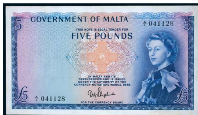
3523* Malta, Government of Malta, Elizabeth II, five pounds, 1949 (1961), A/4 041128 (P.27a). Extremely fine and rare.