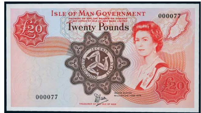
3449* Isle of Man, Isle of Man Government, Elizabeth II, twenty pounds, undated, 1979 commemorative issue, 000077 (P.32). Uncirculated and scarce, a low number.