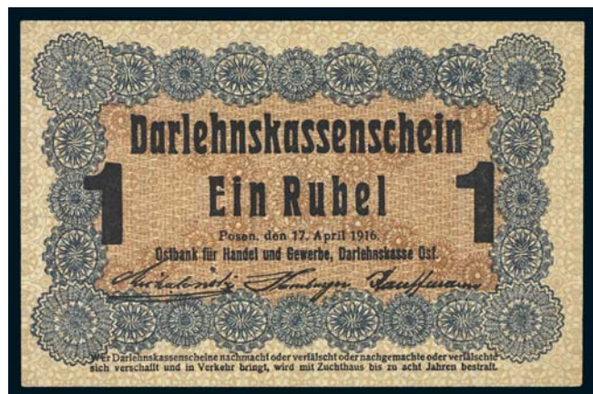
3395* Germany , regional occupation of Lithuania, WWI, State Loan Bank currency notes, Eastern Bank of Commerce and Industry, Posen (Poznan), one rubel, 17 April 1916 (P.R122a). Nearly uncirculated.