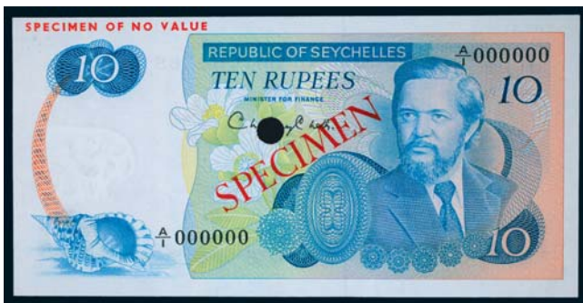
3582* Seychelles, Republic of Seychelles, specimen ten rupees, undated (1976), A/1 000000, SPECIMEN in red diagonally both sides, SPECIMEN OF NO VALUE in red top left margin on front, single punch hole cancellation at signature, numbered 073 in top left margin on back (P.19s). Uncirculated.