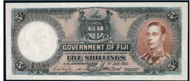
3376* Fiji, Government of Fiji, George VI, five shillings, 1st July, 1950, B/6 37,905 (P.37j). Nearly extremely fine. $100