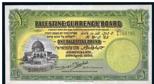
3535* Palestine, Palestine Currency Board, one Palestine pound, Jerusalem, 20th April 1939, S 288780 (P.7c). Crisp and original body, two vertical folds, good very fine and rare. $350