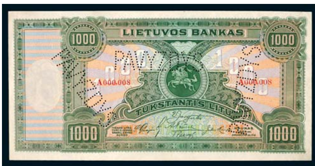
3482* Lithuania, Lietuvos Bankas, specimen one thousand litu, 11.12.1924, A 000,008, PAVYZDYS perforated in three places (P.22s1). Good extremely fine and very rare.