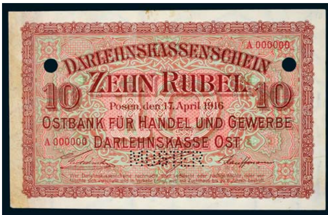
3398* Germany , regional occupation of Lithuania, WWI, State Loan Bank currency notes, Eastern Bank of Commerce and Industry, Posen (Poznan), specimen ten rubel, 17 April 1916, A 000000, MUSTER perforated below, two punch hole cancellation, faint pencilled number '450' top right corner on front (P.R124s). Glue remnants at left on front, otherwise good extremely fine and rare.