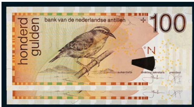
3532* Netherlands Antilles, Bank van de Nederlandse Antillen, one hundred gulden, 1 January 2008, 8125788771 and 8125785783 (P.31e). Uncirculated. (2) $180