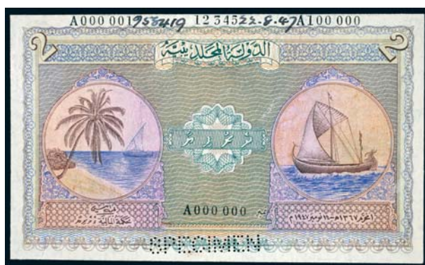
3518* The Maldives, Maldivian State, Government Treasurer, specimen two rupees, 14.11.1947/AH1367, four discordant serial numbers, A000000, A000001, A100000 and 12345, SPECIMEN perforated below, printer's instructions '958419 - 22.8.47' panned in top margin (P.3as). Virtually uncirculated.