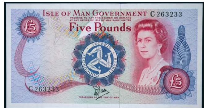
3450* Isle of Man, Isle of Man Government, Elizabeth II, five pounds, undated (1979), C 263233 (P.35a). Uncirculated.