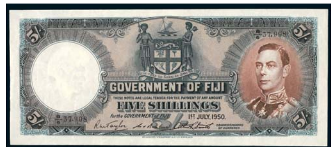
3377* Fiji, Government of Fiji, George VI, five shillings, 1st July, 1950, B/6 37,998 (P.37j). Nearly extremely fine. $100