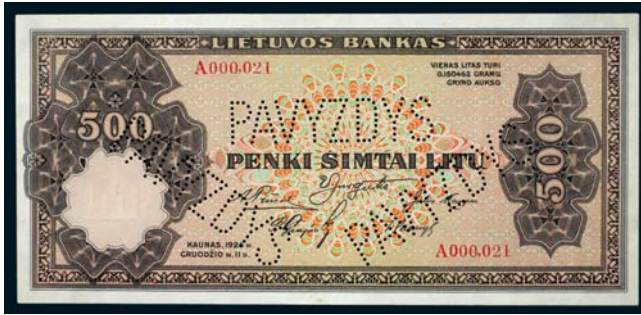
3480* Lithuania, Lietuvos Bankas, specimen five hundred litu, 11.12.1924, A 000,021, PAVYZDYS perforated in three places (P.21s1). Good extremely fine.