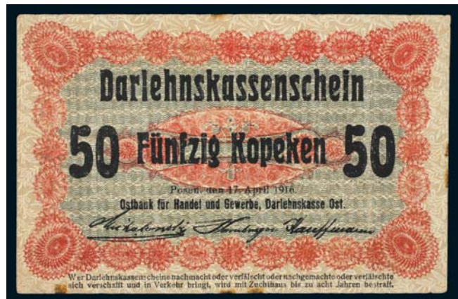
3394* Germany , regional occupation of Lithuania, WWI, State Loan Bank currency notes, Eastern Bank of Commerce and Industry, Posen (Poznan), fifty kopeken, 17 April 1916 (P.R121a). Stained bottom margin, nearly very fine.