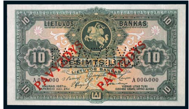
3483* Lithuania, Lietuvos Bankas, specimen ten litu, 24.11.1927, A 000,000, PAVYZDYS perforated in centre, in red diagonally in two places on front and horizontally in two places on the back (P.23s2). Good extremely fine.