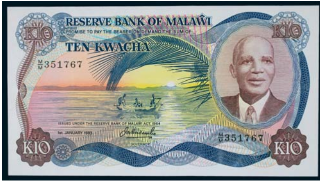
3505* Malawi , Reserve Bank of Malawi, ten kwacha, 1st January 1983, M/M 351767 (P.16e). Uncirculated and scarce thus. $180