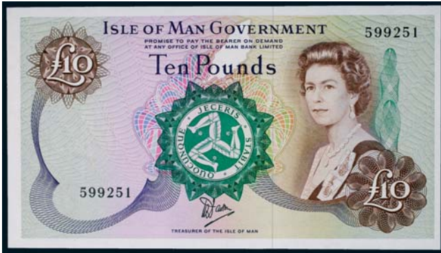
3451* Isle of Man, Isle of Man Government, Elizabeth II, ten pounds, undated (1979), 599251 (P.36a). Uncirculated and rare. $250