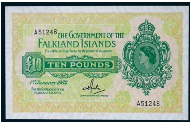
3374* Falkland Islands, The Government of the Falkland Islands, Elizabeth II, ten pounds, 1st January 1982, A 51248 (P.11b). Virtually uncirculated and very rare. $750