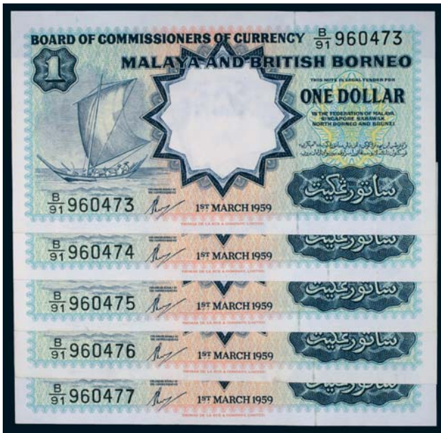
3516* Malaya and British Borneo, Board of Commissioners of Currency, one dollar, 1st March 1959, printed by Thomas De La Rue, B/91 960473/7 five consecutive (P.8A). Centre fold but not creased, small spot of foxing on one note, otherwise virtually uncirculated. (5)