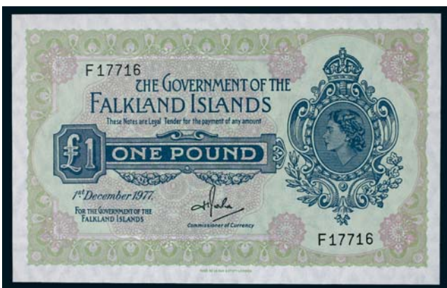
3367* Falkland Islands , The Government of the Falkland Islands, Elizabeth II, one pound, 1st December 1977, F 17716 (P.8c). Uncirculated and rare.