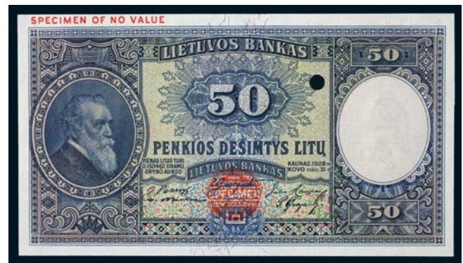
3484* Lithuania, Lietuvos Bankas, specimen fifty litu, 31.3.1928, SPECIMEN in red circle below on front, SPECIMEN OF NO VALUE in red top left margins both sides, single punch hole cancellation (P.24s). Uncirculated.