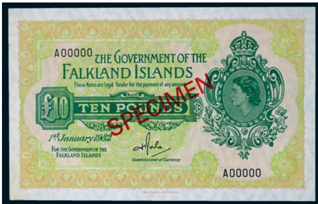
3373* Falkland Islands, The Government of the Falkland Islands, Elizabeth II, specimen ten pounds, 1st January 1982, A 00000, imprint of Thos de la Rue & Co Ltd, London, SPECIMEN in red diagonally both sides (P.11bs). Uncirculated and very rare. $500