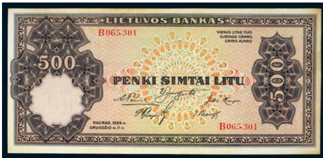
3481* Lithuania, Lietuvos Bankas, five hundred litu, 11.12.1924, B 065,301 (P.21a). Nearly uncirculated and very rare.