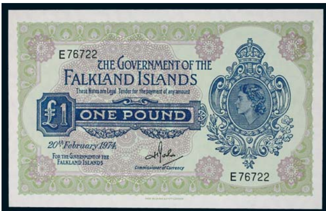
3366* Falkland Islands , The Government of the Falkland Islands, Elizabeth II, one pound, 20th February 1974, E 76722 (P.8b). Uncirculated.