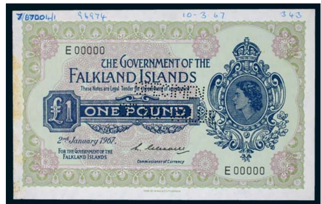
3363* Falkland Islands , The Government of the Falkland Islands, Elizabeth II, specimen one pound, 2nd January 1967, E 00000, imprint of Thos de la Rue & Co Ltd, London, SPECIMEN/OF NO VALUE perforated in centre, printer's instructions '7/07004/1-96974-10.3.67-343' panned in top margin (P.8as). Remnants of glue on front left and back right, good extremely fine.