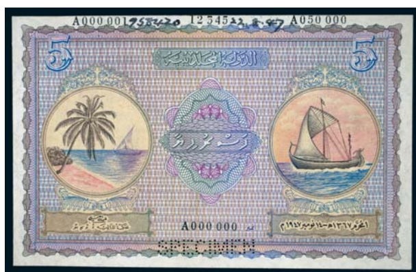
3519* The Maldives, Maldivian State, Government Treasurer, specimen five rupees, 14.11.1947/AH1367, four discordant serial numbers, A000000, A000001, A050000 and 12345, SPECIMEN perforated below, printer's instructions '958420 - 22.8.47' panned in top margin (P.4as). Virtually uncirculated.