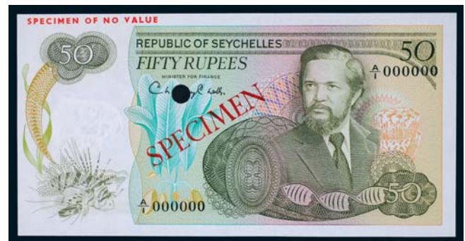
3585* Seychelles, Republic of Seychelles, specimen fifty rupees, undated (1977), A/1 000000, SPECIMEN in red diagonally both sides, SPECIMEN OF NO VALUE in red top left margin on front and back, single punch hole cancellation at signature, numbered 040 in top left margin on back (P.21s). Uncirculated.