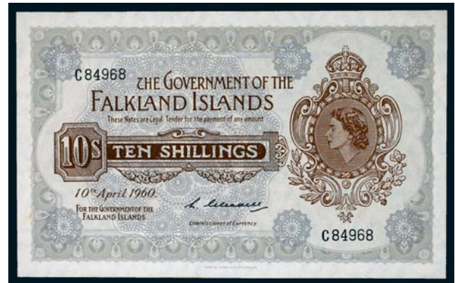
3362* Falkland Islands , The Government of the Falkland Islands, Elizabeth II, ten shillings, 10th April 1960, C 84968 (P.7). Virtually uncirculated and rare.