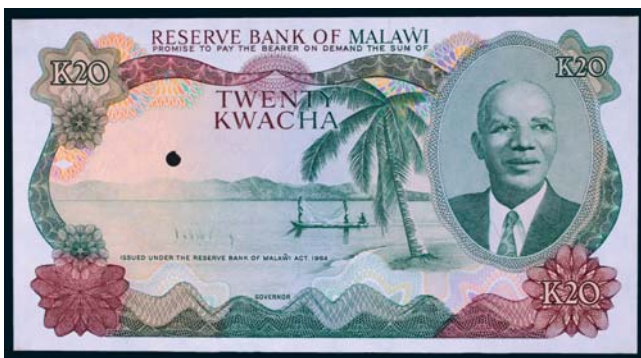
3507* Malawi , Reserve Bank of Malawi, specimen twenty kwacha, undated (1983) colour trial, single punch hole cancellation at watermark (P.17ct). Uncirculated. $250