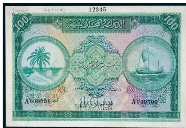
3522* The Maldives, Maldivian State, Government Treasurer, specimen one hundred rupees, 1951/AH1371, three discordant serial numbers, A000001, A049500 and 12345, SPECIMEN perforated below, printer's instructions '0/66947 - 26/1/51' panned in top margin (P.7as). Small fold top left margin, nearly uncirculated.