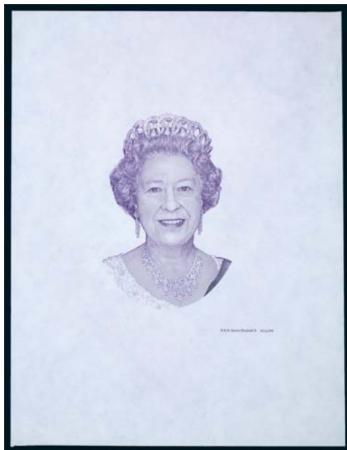
lot 3389 part

3389* Fiji, Reserve Bank of Fiji, Elizabeth II, set of uniface printer's proofs on paper, intaglio print phase, for two, ten, twenty, fifty and one hundred dollars, undated (2007) (P.109as, 111as-114as); also, printer's proof on paper of a portrait of Queen Elizabeth (2004) as used on the 2007 series of notes. Extremely fine. (6)