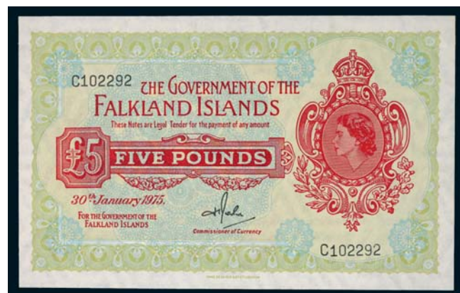
3371* Falkland Islands , The Government of the Falkland Islands, Elizabeth II, five pounds, 30th January 1975, C 102292 (P.9b). Virtually uncirculated and very rare.