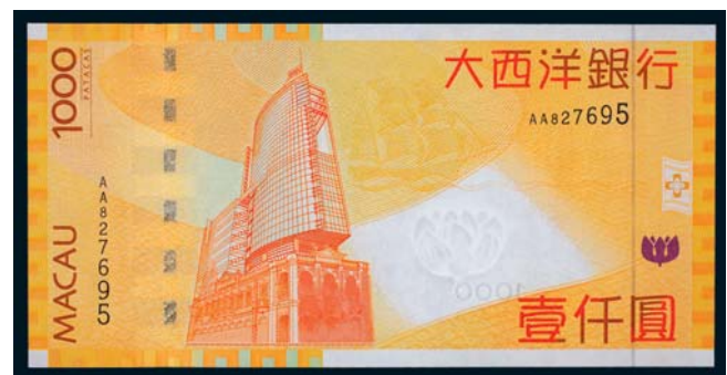
3498* Macau, Banco Nacional Ultramarino, one thousand patacas, 8 August 2005, AA 827695 (P.84a). Uncirculated.