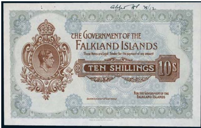
3359* Falkland Islands , The Government of the Falkland Islands, George VI, ten shillings printer's proof on paper, c1937, printer's notation in top margin 'Approved 21/12' (P.4s). Several pin holes top left margin, extremely fine.