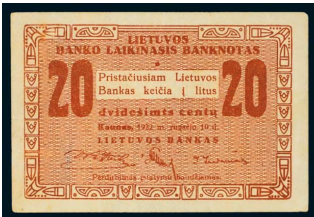
3475* Lithuania, Lietuvos Bankas, twenty centu, 10.9.1922 (P.3a). Good extremely fine.