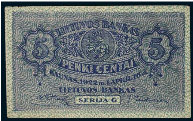
lot 3478 part

3478* Lithuania, Lietuvos Bank, set of one centas, two centu, five centai, ten, twenty and fifty centu, 1922 (P.7a-12a). The last uncirculated, others fine - good very fine, all scarce. (6) $250