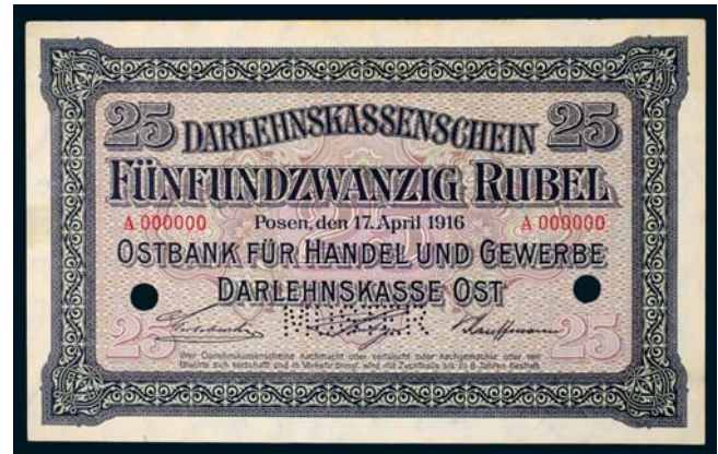
3400* Germany , regional occupation of Lithuania, WWI, State Loan Bank currency notes, Eastern Bank of Commerce and Industry, Posen (Poznan), specimen twenty five rubel, 17 April 1916, A 000000, MUSTER perforated below, two punch hole cancellation (P.R125s). Good extremely fine and rare.