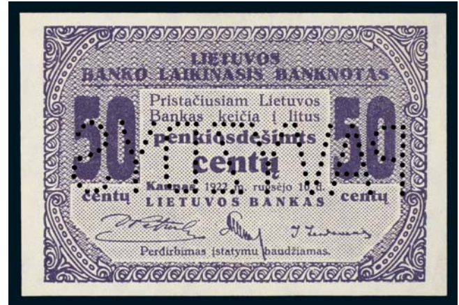
3476* Lithuania, Lietuvos Bankas, specimen fifty centu, 10.9.1922, PAVYZDYS perforated in centre (P.4s1). Uncirculated.