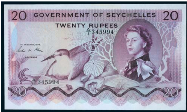
3581* Seychelles, Government of Seychelles, Elizabeth II, twenty rupees, 1st January, 1974, A/1 345994 (P.16c). Uncirculated and rare.