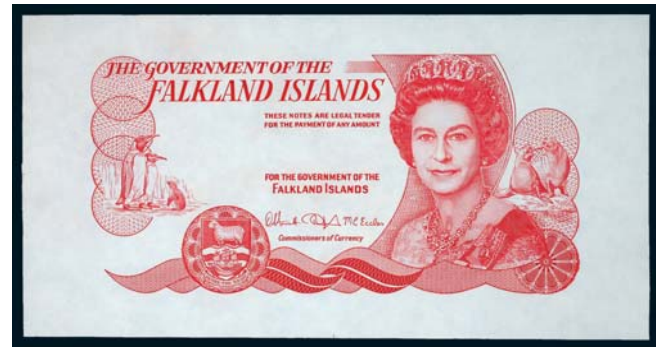
3375* Falkland Islands, The Government of the Falkland Islands, Elizabeth II, (£5) uniface printer's proof on paper, c2005 (cfP.17). Nearly uncirculated. $300