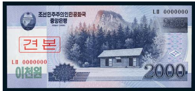
3534* North Korea, Korean Central Bank, Kim Il Sung, specimen five thousand won, 2002, 429026 and 429068 (P.46s1) (2); specimen two thousand won, 2008, 0000000 (P.65s) (2); specimen five thousand won, 2013, Kim Il Sung, 100th Birthday, 0000000 (P.C9s) (2). Uncirculated, one of each illustrated. (6)