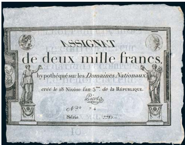
3390* France , assignat, Domaines Nationaux, two thousand francs, 18 Nivose l'an 3 (17.1.1795), No.74, Serie 7719 (P.A81). Good very fine.