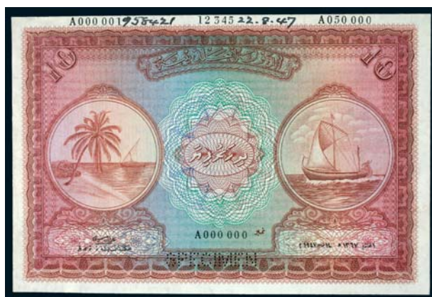
3520* The Maldives, Maldivian State, Government Treasurer, specimen ten rupees, 14.11.1947/AH1367, four discordant serial numbers, A000000, A000001, A050000 and 12345, SPECIMEN perforated below, printer's instructions '958421 - 22.8.47' panned in top margin (P.5as). Virtually uncirculated.