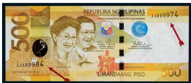
lot 3550 part