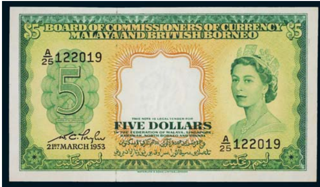
3515* Malaya and British Borneo, Board of Commissioners of Currency, Elizabeth II, five dollars, 21st March 1953, A/25 122019 (P.2a). Nearly uncirculated and rare.