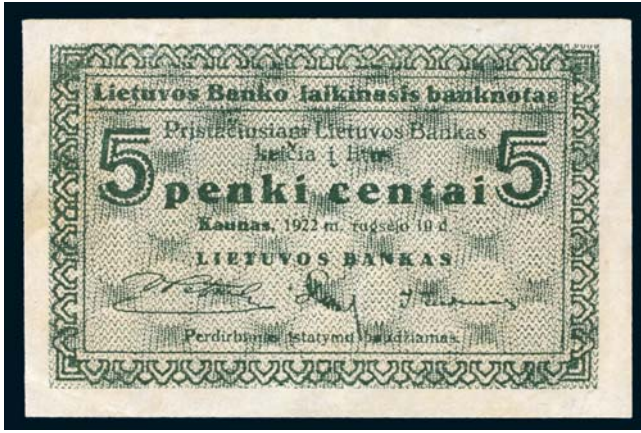
3473* Lithuania, Lietuvos Bankas, five centai, 10.9.1922 (P.2a). Good extremely fine.