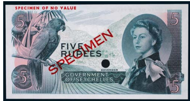
3578* Seychelles, Government of Seychelles, Elizabeth II, specimen five rupees, undated (1968) colour trial, SPECIMEN in red diagonally both sides, SPECIMEN OF NO VALUE in red at top left margin both sides, single punch hole cancellation at signature reserve, numbered 83 on back in top right margin (P.14s/ct). Uncirculated.