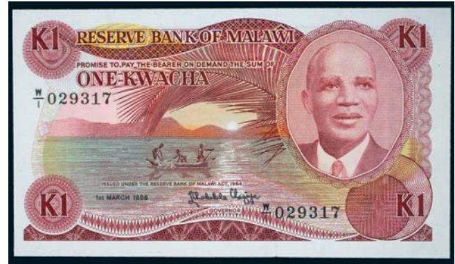
3508* Malawi , Reserve Bank of Malawi, one kwacha, 1st March 1986, W/1 029317 (P.19ar) replacement note. Uncirculated and scarce. $100