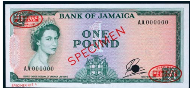
3458* Jamaica, Bank of Jamaica, Elizabeth II, de la Rue specimen one pound, undated (1961), AA 000000, SPECIMEN in red diagonally front and back, de la Rue specimen lozenges in red top left and bottom right both sides, SPECIMEN No. 64 in red at bottom left on front (P.51s). Uncirculated. $300