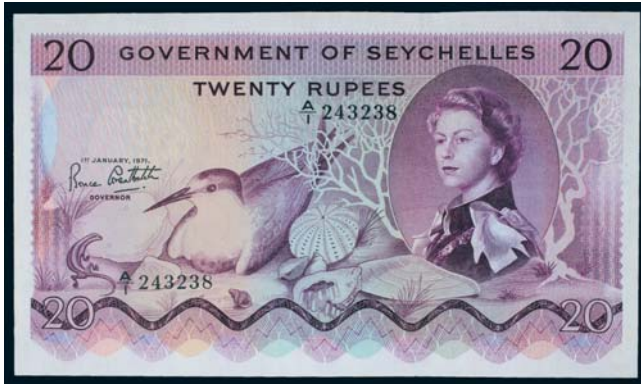
3580* Seychelles, Government of Seychelles, Elizabeth II, twenty rupees, 1st January, 1971, A/1 243238 (P.16b). Uncirculated and rare.