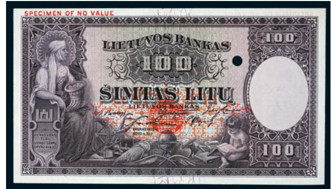
3496* Lithuania, Lietuvos Bankas, specimen one hundred litu, 31.3.1928, single punch hole cancellation, SPECIMEN OF NO VALUE in red top left margin both sides (P.100s). Uncirculated.