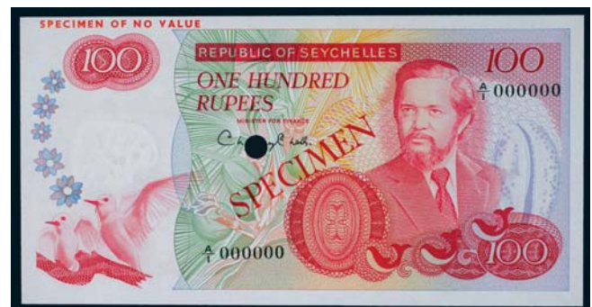
3586* Seychelles, Republic of Seychelles, specimen one hundred rupees, undated (1977), A/1 000000, SPECIMEN in red diagonally both sides, SPECIMEN OF NO VALUE in red top left margin on front and back, single punch hole cancellation at signature, numbered 075 in top left margin on back (P.22s). Uncirculated.