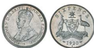
2703* George V, 1920M. Considerable mint bloom, frictional wear on the emu feathers, otherwise nearly uncirculated.