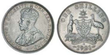
2679* George V, 1921 star. Has been cleaned and lightly polished, otherwise good extremely fine and rare. $1,500