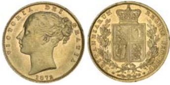
2487* Queen Victoria, 1872 Melbourne. Struck en medaille die axis, extremely fine with mint bloom and very rare, only a few known.