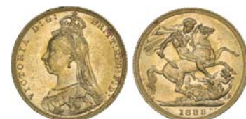
2546* Queen Victoria, 1888 Melbourne (McD.177b). Uncirculated.