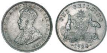
2681* George V, 1924. Dull matt tone, nearly uncirculated and rare thus. $750