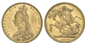
2548* Queen Victoria, 1889 Melbourne (McD.179a). Uncirculated