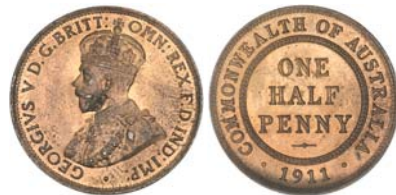
2778* George V, 1911. Full original mint red choice uncirculated.