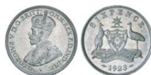
2707* George V, 1923. Lightly toned, subdued original mint bloom and well struck as always for this date, uncirculated and very scarce in this condition.