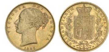
2506* Queen Victoria, 1885 Melbourne. Good extremely fine. $600