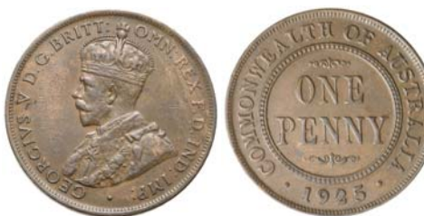
2760* George V, 1925 London die. Horizontal line on neck die state, extremely fine and rare in this condition. $800