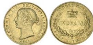
2477* Queen Victoria, second type, 1861. Very fine. $1,500