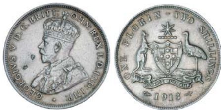
2627* George V, 1913. Lightly rubbed, otherwise good very fine.