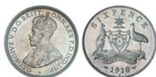
2701* George V, 1918M. Full original cartwheeling mint bloom on the reverse, lightly toned with blue red hues, nearly uncirculated/uncirculated and rare in this condition, the key date.