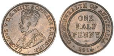
2782* George V, 1914H. Subdued brown and red, nearly uncirculated.