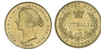
2467* Queen Victoria, second type, 1863. Surface marks, underlying mint bloom, nearly uncirculated and rare thus.