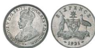
2705* George V, 1921. Nearly extremely fine.