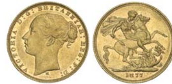
2523* Queen Victoria , 1877 Melbourne. Good extremely fine. $500