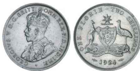
2640* George V, 1924. Serif to 4, cleaned, good extremely fine.