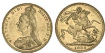
2547* Queen Victoria, 1888 Sydney (McD.176b). Nearly uncirculated.