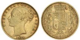
2490* Queen Victoria, 1874 Melbourne. Toned very fine, countermarked with a raised torch inside a sunken circle beside the right side of the crown.