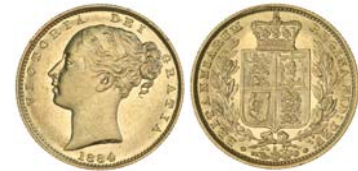
2505* Queen Victoria, 1884 Sydney. Extremely fine. $500