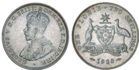
2646* George V, 1928. Light golden brown toning on highlights, nearly uncirculated.