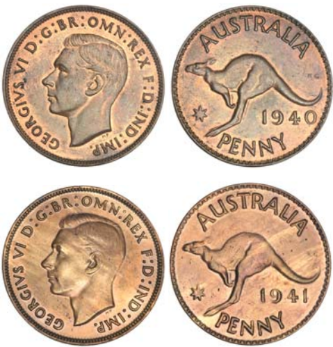
2771* George VI, 1940 K dot G and 1941 K dot G. Red and brown, nearly uncirculated. (2)