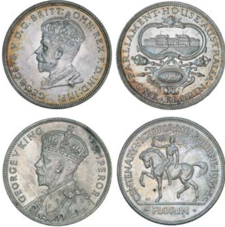
2644* George V, 1927 Canberra and 1934-35 Melbourne Centenary. Choice uncirculated; toned, specimen-like nearly uncirculated. (2)