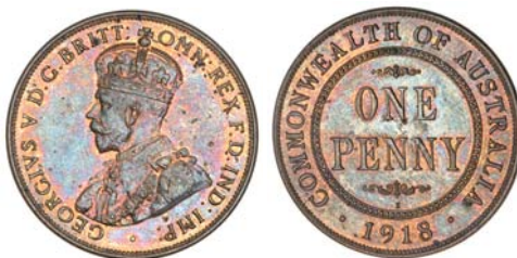
2750* George V, 1918I. Brown and red, proof-like, uncirculated and rare in this condition.