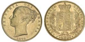
2489* Queen Victoria, 1874 Melbourne. Good extremely fine.