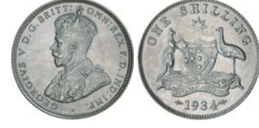
2688* George V, 1934. Weak strike in centre both sides, otherwise relatively unmarked, uncirculated. $350