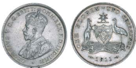
2624* George V, 1911. Lightly toned, extremely fine and rare in this condition.