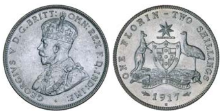
2634* George V, 1917M. Full white silver mint bloom, uncirculated.