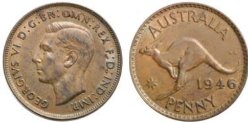
2772* George VI, 1946. Brown with traces of red, extremely fine.