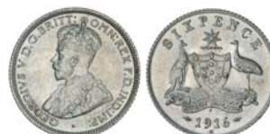
2699* George V, 1916M. Full frosty mint bloom, uncirculated and rare in this condition. $1,000