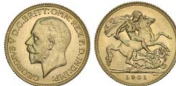
2593* George V, small head, 1931 Melbourne. Nearly uncirculated/uncirculated and very scarce.