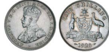
2685* George V, 1928. Has been heavily polished, otherwise extremely fine or better. $150