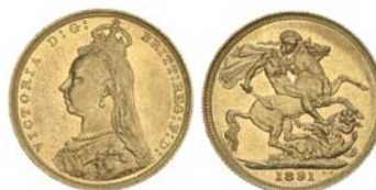
2554* Queen Victoria, 1891 Sydney. Nearly uncirculated.