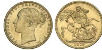
2521* Queen Victoria , 1876 Melbourne. Good extremely fine. $500