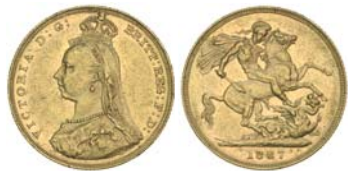
2543* Queen Victoria, Jubilee head, 1887 Melbourne (McD.175a). Good extremely fine.