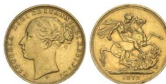
2514* Queen Victoria, 1872 Sydney. Extremely fine.