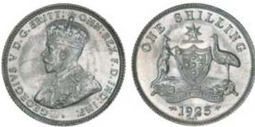
2682* George V, 1925. Cartwheeling original mint bloom, uncirculated. $500