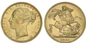
2530* Queen Victoria, 1881 Sydney (McD.160) no BP. Extremely fine.