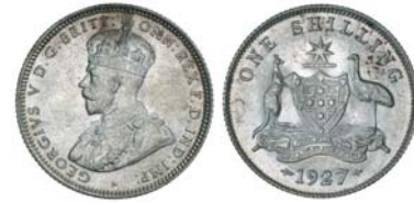
2684* George V, 1927. Full original frosty mint bloom, uncirculated. $600