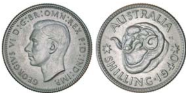
2692* George VI, 1940. Uncirculated. $300