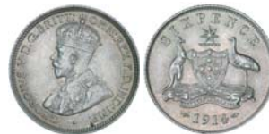
2698* George V, 1914. Lightly toned, relatively unmarked, nearly uncirculated and rare thus. $500