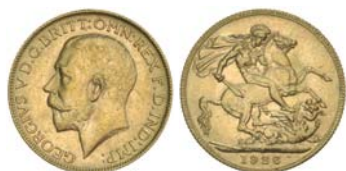
2588* George V, 1926 Perth. Nearly uncirculated and scarce.