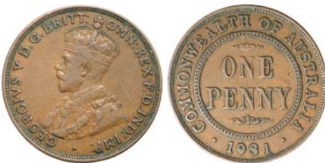
2767* George V, 1931, dropped 1, Indian die. Even dark brown patina, good fine and very rare.