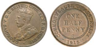
2783* George V, 1915H. Dull grey tone with underlying traces of red, extremely fine to good extremely fine and rare.