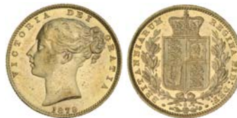
2495* Queen Victoria, 1879 Sydney. Uncirculated.