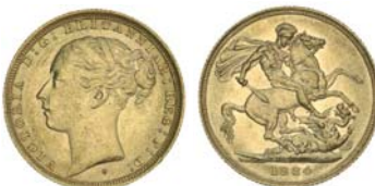
2536* Queen Victoria, 1884 Sydney. Nearly uncirculated.