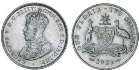
2637* George V, 1921. Cleaned, extremely fine or better.