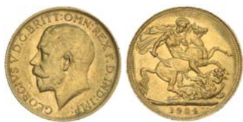
2586* George V, 1924 Sydney. Lightly toned, nearly uncirculated and rare.