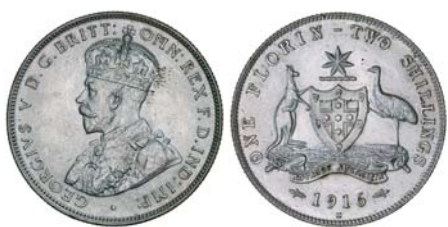
2633* George V, 1916M. Full white silver mint bloom, uncirculated.