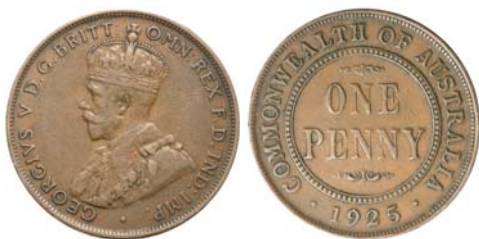
2761* George V, 1925 London die. Broken N die state, very fine and scarce thus.