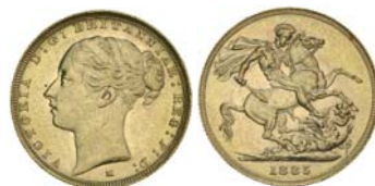
2537* Queen Victoria, 1885 Melbourne (McD.169c) trace of BP. Nearly uncirculated.