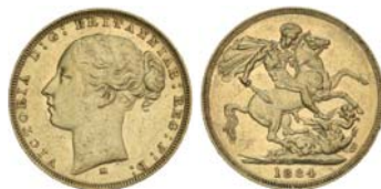
2535* Queen Victoria, 1884 Melbourne (McD.167a). Good extremely fine.