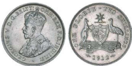
2625* George V, 1912. Some underlying mint bloom, frictional wear on emu feathers, nearly uncirculated and rare in this condition.