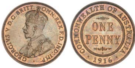
2747* George V, 1916I. Brown and red, usual proof-like strike, uncirculated.