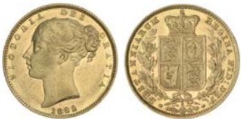
2501* Queen Victoria, 1882 Sydney. Nearly extremely fine. $600