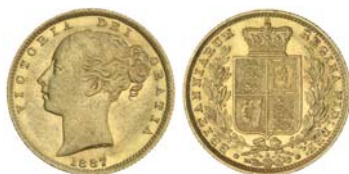
2511* Queen Victoria, 1887 Sydney. Lightly toned, good extremely fine.