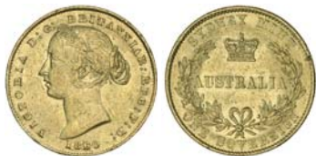
2463* Queen Victoria, second type, 1860. Surface marks and rim nicks on reverse, otherwise nearly extremely fine/extremely fine and rare.