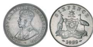
2706* George V, 1922. Some die rust evident, nearly uncirculated and rare.