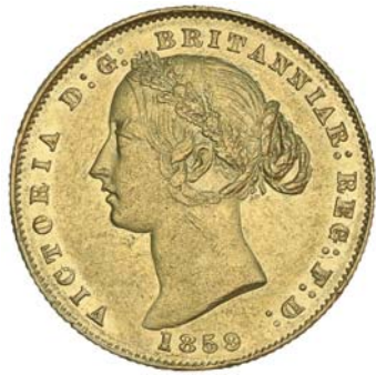
2462* Queen Victoria, second type, 1859. Some mint bloom in lettering and devices, extremely fine or better and rare thus.