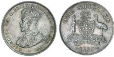
2689* George V, 1935. Grey brown toned, good extremely fine. $100