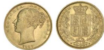
2503* Queen Victoria, 1883 Sydney. Extremely fine/good extremely fine. $600