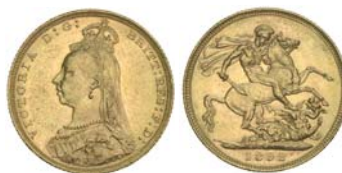
2555* Queen Victoria, 1892 Melbourne. Nearly uncirculated.