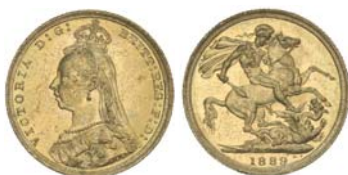
2549* Queen Victoria, 1889 Sydney (McD.178a). Uncirculated.