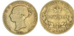
2474* Queen Victoria, first type, 1856. Evenly worn, good. $300