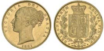
2498* Queen Victoria, 1881 Melbourne. Surface marks, otherwise nearly uncirculated. $600