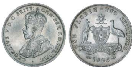
2641* George V, 1925. Buffed in obverse fields, well struck, nearly uncirculated with light grey silver toning.