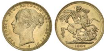
2542* Queen Victoria, young head, 1887 Sydney. Uncirculated.