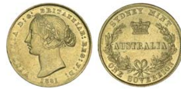
2465* Queen Victoria, second type, 1861. Extremely fine/good extremely fine.