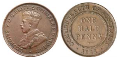
2790* George V, 1923. Faint peripheral die breaks either side, old scratches through head and rim nick at 10 o'clock on obverse, otherwise very fine.