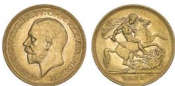
2590* George V, small head, 1929 Melbourne. Extremely fine/good extremely fine and rare.