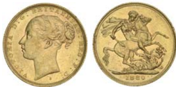
2528* Queen Victoria, 1880 Sydney (McD.158). Nearly uncirculated.