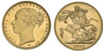
2539* Queen Victoria, 1886 Melbourne. Uncirculated.