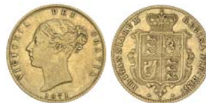
2594* Queen Victoria, 1871 Sydney. Good fine.