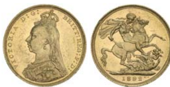
2556* Queen Victoria, 1892 Sydney. Hairlines on obverse, otherwise uncirculated.