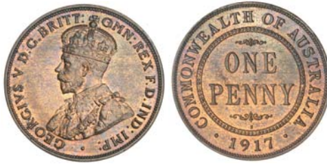
2748* George V, 1917I. Brown and red, uncirculated.