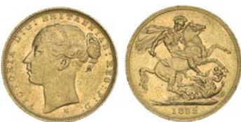
2532* Queen Victoria, 1882 Melbourne (McD.163a) trace of BP. Obverse hairlines, otherwise nearly uncirculated.