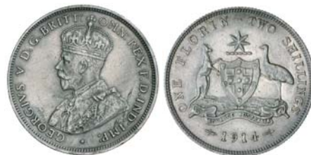
2629* George V, 1914. Obverse dull, extremely fine/good extremely fine.