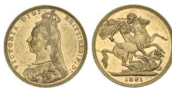
2553* Queen Victoria, 1891 Melbourne (McD.183a). Nearly uncirculated.