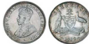
2697* George V, 1912. Peripheral toning, obverse rim flaw at 8, nearly uncirculated and rare thus. $750