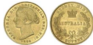
2470* Queen Victoria, second type, 1866. Some mint bloom, good extremely fine/nearly uncirculated.