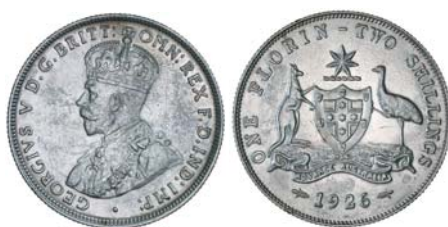
2642* George V, 1926. Nearly uncirculated and scarce thus.