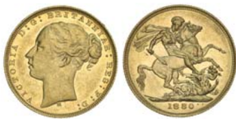
2527* Queen Victoria, 1880 Melbourne (McD.159). Obverse hairlines, otherwise nearly uncirculated.