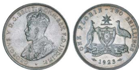
2639* George V, 1923. Uncirculated/choice uncirculated and rare in this condition.