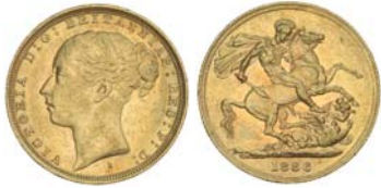
2540* Queen Victoria, 1886 Sydney. Lightly toned, extremely fine/good extremely fine.