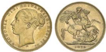
2519* Queen Victoria , 1875 Melbourne. Nearly uncirculated. $600