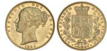
2504* Queen Victoria, 1884 Melbourne. Nearly uncirculated. $600