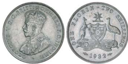
2648* George V, 1932. Light grey tone over subdued mint bloom, nearly uncirculated and very rare in this condition.