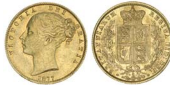
2493* Queen Victoria, 1877 Sydney, S mint mark doubled or over another S. Good extremely fine.