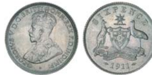
2696* George V, 1911. Even light grey patina, unmarked uncirculated. $500