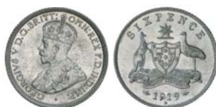
2702* George V, 1919M. Considerable original frosty mint bloom, light hairlines on the obverse, otherwise nearly uncirculated/uncirculated and very scarce in this condition.