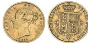
2595* Queen Victoria, 1872 Sydney. Good fine.