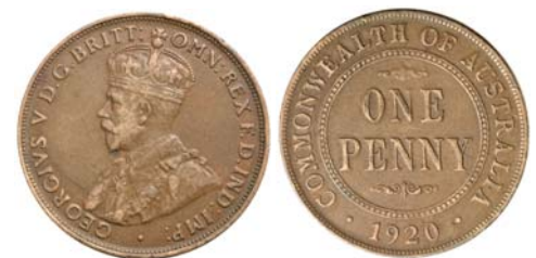
2754* George V, 1920 double dot, Indian die. Nearly very fine and scarce in this condition.