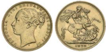
2516* Queen Victoria , 1873 Sydney. Polished, otherwise nearly extremely fine. $500