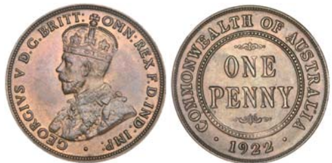
2756* George V, 1922 Indian die. Brown and red, nearly uncirculated and very scarce in this condition. $500