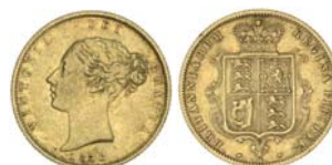
2596* Queen Victoria, 1873 Melbourne. Nearly very fine.