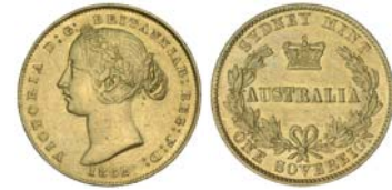
2466* Queen Victoria, second type, 1862. Surface marks, harshly brushed, otherwise nearly extremely fine and rare.