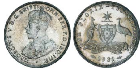
2647* George V, 1931. Dark grey and gold edge and peripheral toning with fully proof-like reverse, probably a specimen or proof, virtually FDC and one of the finest known.