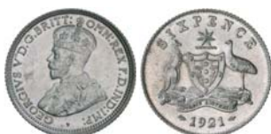
2704* George V, 1921. Full original frosty mint bloom, noticeable depression above the date where the star was removed from the die, uncirculated.