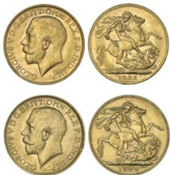
2587* George V, 1925 and 1928 Perth. Nearly uncirculated. (2)