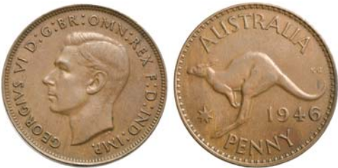
2773* George V, 1946. Good very fine.