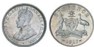
2700* George V, 1917M. Light grey brown toned, uncirculated and rare in this condition.