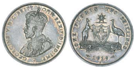
2636* George V, 1919M. Cleaned and lightly polished, good extremely fine.