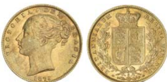
2491* Queen Victoria, 1875 Sydney. Lightly toned, nearly uncirculated.