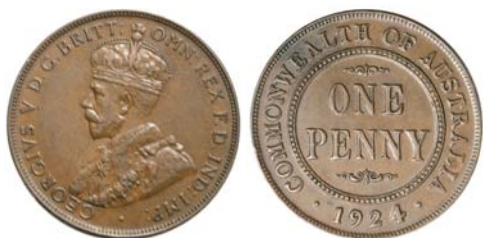
2758* George V, 1924 London die. Glossy brown, good extremely fine. $100