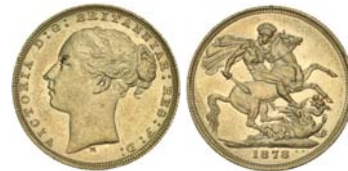
2524* Queen Victoria , 1878 Melbourne. Raised area behind tail to rim, nearly uncirculated and rare as such. $1,200