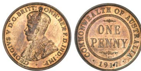
2749* George V, 1917I. Red and brown, nearly uncirculated.