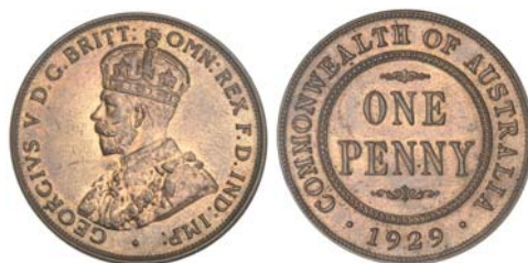
2765* George V, 1929 London die. Red and brown uncirculated and rare thus.