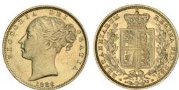
2509* Queen Victoria, 1886 Sydney. Polished, nearly extremely fine/extremely fine.