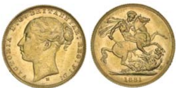
2529* Queen Victoria, 1881 Melbourne (McD.161a) no BP. Uncirculated.