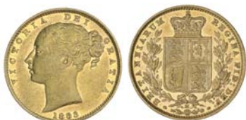
2502* Queen Victoria, 1883 Melbourne. Nearly extremely fine/good extremely fine and very scarce. $700