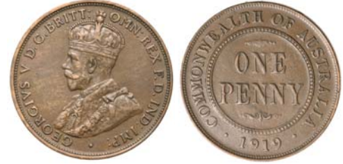
2752* George V, 1919 and 1919 dot below. Dull toned, old red, nearly uncirculated; second good very fine. (2)