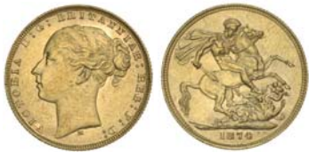
2517* Queen Victoria , 1874 Melbourne. Nearly uncirculated. $750