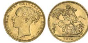
2522* Queen Victoria , 1876 Sydney. Nearly uncirculated. $600