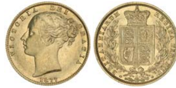
2492* Queen Victoria, 1877 Sydney. Obverse peripheral die breaks, extremely fine/good extremely fine.