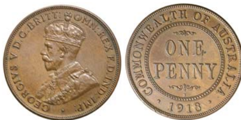
2751* George V, 1918I. A little polished, brown with hints of red, good extremely fine and rare thus.