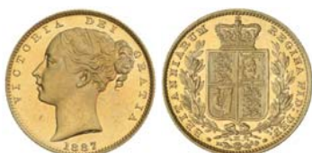
2510* Queen Victoria, 1887 Melbourne. Mirror-like fields, relatively unmarked, cleaned appearance, uncirculated and very rare in this condition, one of the finest known.