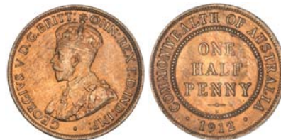
2779* George V, 1912H. Subdued full original mint red, uncirculated.