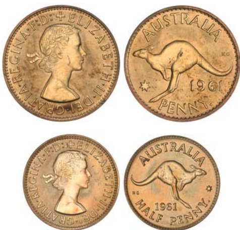
2808* Elizabeth II, Perth Mint proof set, 1961. FDC . (2) $700