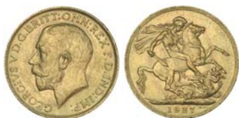
2589* George V, 1927 Perth. Subdued mint bloom, nearly uncirculated and scarce.