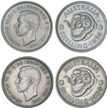
2691* George VI, 1938 and 1939. Choice uncirculated; nearly uncirculated. (2) $150