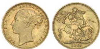
2520* Queen Victoria , 1875 Sydney. Nearly uncirculated. $600