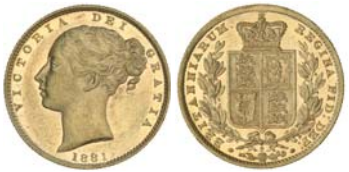
2499* Queen Victoria, 1881 Sydney. Obverse hairlines, underlying brilliance, nearly uncirculated. $700