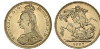
2544* Queen Victoria, Jubilee head, 1887 Sydney (McD.174c) long JEB. Choice uncirculated and rare in this condition, one of the finest known.