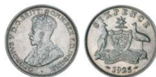
2709* George V, 1925. Slightest peripheral toning, nearly uncirculated.