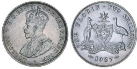
2643* George V, 1927. Frosted matte finish, relatively unmarked, nearly uncirculated.