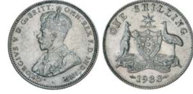
2687* George V, 1933. Has been cleaned and polished, semi mirror-like fields, extremely fine and rare. $1,500