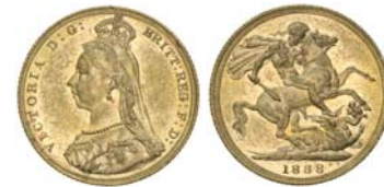
2545* Queen Victoria, 1888 Melbourne (McD.177a). Underlying brilliance, extremely fine and a rare variety.