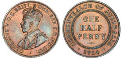
2781* George V, 1914. Has been rubbed, red with brown, good extremely fine.