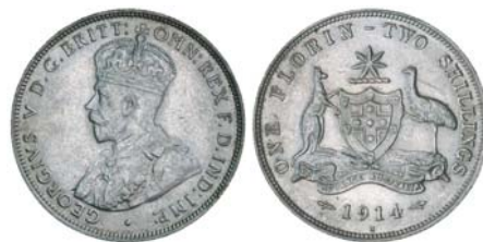
2630* George V, 1914H. Usual soft Birmingham Mint strike, high rims, extremely fine or better and rare in this condition.