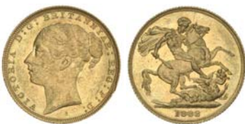
2531* Queen Victoria, 1882 Melbourne, only a trace of B of BP (McD.162a). Uncirculated.