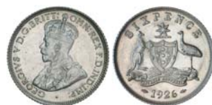
2710* George V, 1926. Full original mint bloom, light golden red toning on the right side of the reverse, uncirculated/choice uncirculated.