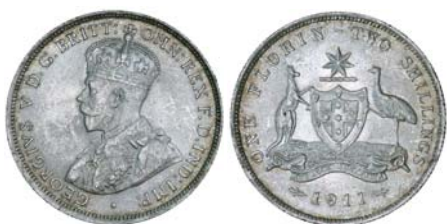
2623* George V, 1911. Golden peripheral highlights over full natural frosted silver mint bloom, uncirculated and rare in this condition, one of the finest known.