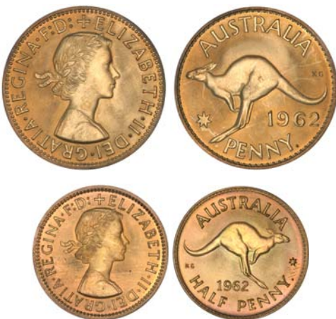
2809* Elizabeth II, Perth Mint proof set, 1962. Dulled red , FDC . (2) $700