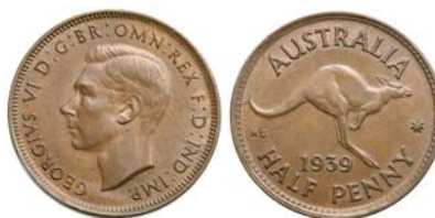
2795* George VI, 1939 kangaroo reverse. Attractive brown patina with hints of red, nearly uncirculated and rare thus.