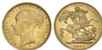
2538* Queen Victoria, 1885 Sydney. Nearly uncirculated/uncirculated.