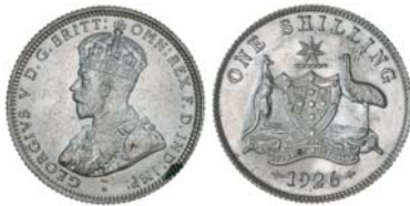
2683* George V, 1926. Full frosted mint bloom, uncirculated, one of the finest known. $750