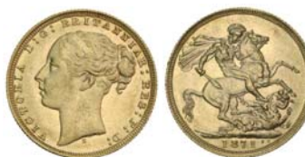
2512* Queen Victoria, 1871 Sydney, large BP (McD.143). Nearly uncirculated and very rare in this condition, one of the finest known.