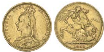
2551* Queen Victoria, 1890 Melbourne. Struck with reverse die cud at 3 to 5 o'clock, very fine and unusual for a sovereign.