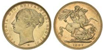
2541* Queen Victoria, young head, 1887 Melbourne. Uncirculated.