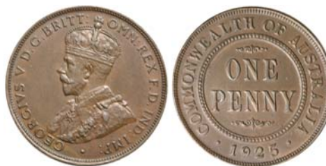
2759* George V, 1925 London die. Q die state, well struck glossy brown with hints of red, nearly uncirculated and very rare as such. $6,000