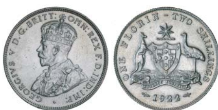
2638* George V, 1922. Cleaned and slightly rubbed, good extremely fine and rare so well struck.