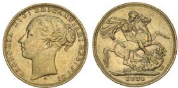
2518* Queen Victoria , 1874 Sydney. Good very fine/very extremely fine. $600