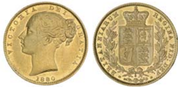
2497* Queen Victoria, 1880 Sydney. Nearly extremely fine. $500