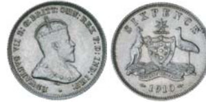
2695* Edward VII, 1910. Full frosty mint bloom, uncirculated. $150