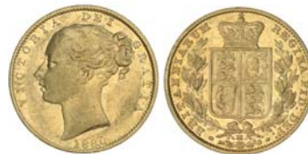
2496* Queen Victoria, 1880 Melbourne. Good very fine and rare.