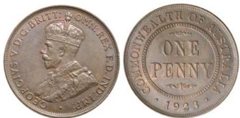
2757* George V, 1923, London die. Hints of red, nearly uncirculated. $200