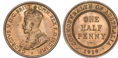
2786* George V, 1919. Lightly toned, full original mint red uncirculated.