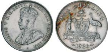
2690* George V, 1936. Unmarked, but slightly rubbed with red brown tone streak, otherwise nearly uncirculated. $200