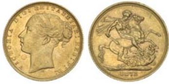
2515* Queen Victoria , 1873 Melbourne. Lightly toned, nearly uncirculated. $600