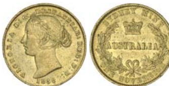
2461* Queen Victoria, second type, 1858. Surface marks, otherwise good very fine.