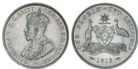
2626* George V, 1913. Scratch across face, cleaned, otherwise good extremely fine and rare in this condition.