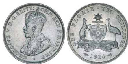
2628* George V, 1914. Cleaned, otherwise good extremely fine.