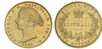
2469* Queen Victoria, second type, 1865. Rim nicks, extremely fine/good extremely fine.