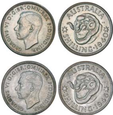
2693* George VI, 1940 and 1946 dot (Perth). Polished, with cut on merino, otherwise uncirculated; original mint bloom with reverse die flash, uncirculated, both scarce in this condition. (2) $400