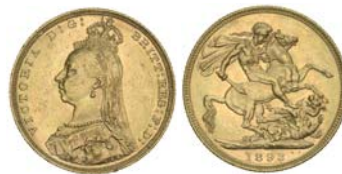
2557* Queen Victoria, Jubilee head, 1893 Melbourne. Uncirculated.