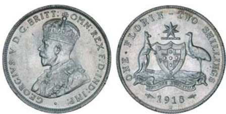
2635* George V, 1918M. Full white silver mint bloom, nearly uncirculated.