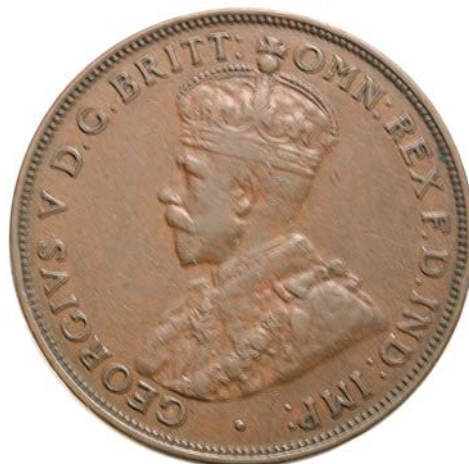
2763 George V, 1925, London die. Broken N die state, nearly very fine; another, horizontal line on neck die state, very fine. (2)