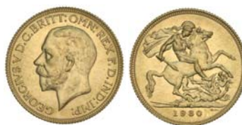
2592* George V, small head, 1930 Melbourne. Uncirculated and scarce.