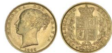
2507* Queen Victoria, 1885 Sydney. Heavy die break on truncation, extremely fine. $500