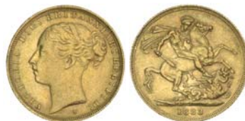
2534* Queen Victoria, 1883 Sydney. Good very fine.