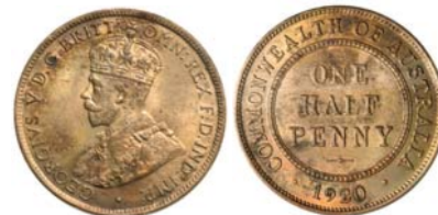
2787* George V, 1920 and 1921. The first with carbon blotchy areas, both red uncirculated. (2)