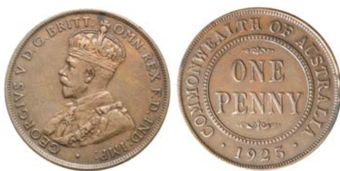
2762* George V, 1925, London die. Broken N die state, glossy brown, minor rim nicks, otherwise good very fine.