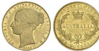
2459* Queen Victoria, first type, 1856. Some mint bloom, nearly extremely fine.