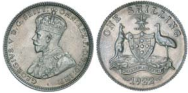
2680* George V, 1922. Obverse die clash, cleaned with semi mirror-like reverse fields, nearly uncirculated. $500