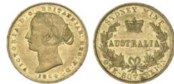
2468* Queen Victoria, second type, 1864. Surface marks, some underlying brilliance, extremely fine or better.