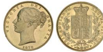
2494* Queen Victoria, 1878 Sydney. Proof-like uncirculated and rare thus.