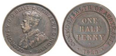
2789* George V, 1923. Diagnostic peripheral die breaks either side, dark brown, nearly very fine and scarce thus.