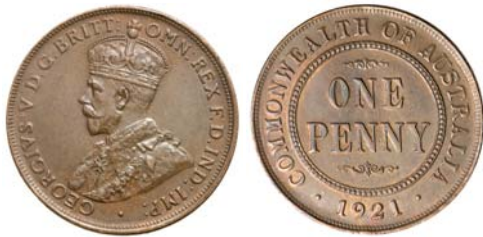
2755* George V, 1921 Indian die. Hints of red, extremely fine. $100