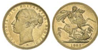
2533* Queen Victoria, 1883 Melbourne (McD.165a) trace of BP. Extremely fine/good extremely fine.