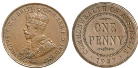
2764* George V, 1926, 1927 and 1928 London dies. Very fine; extremely fine; good extremely fine with hints of red and rare. (3)