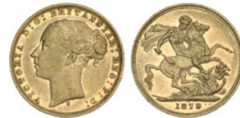
2525* Queen Victoria , 1879 Sydney. Extremely fine/good extremely fine and rare. $900