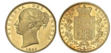
2508* Queen Victoria, 1886 Melbourne. Proof-like mint bloom on the reverse, extremely fine/good extremely fine and very rare, one of the finest known. $10,000