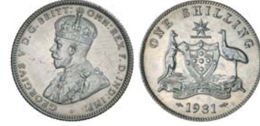
2686* George V, 1931. Mirror-like fields, has been cleaned and rubbed, otherwise uncirculated. $300