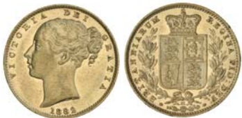
2500* Queen Victoria, 1882 Melbourne. Nearly uncirculated. $600