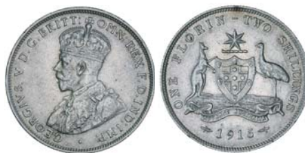
2631* George V, 1915. Cleaned, good very fine and rare.