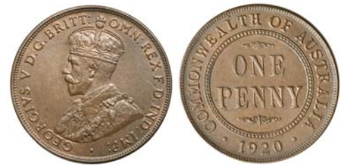
2753* George V, 1920 plain, Indian die; 1920 dot below, Indian die; 1920 dot above, Indian die. Very fine; good extremely fine; fine. (3)