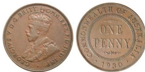
2766* George V, 1930 Indian die. Full band, part centre diamond, six pearls, even brown patina, very fine and rare, especially in this condition.