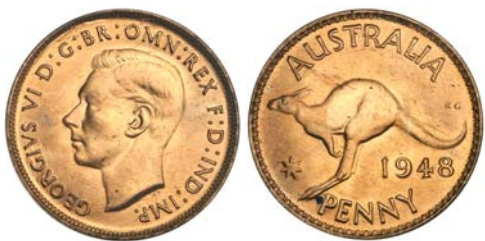
2775* George VI, 1948, 1949, 1950, 1951PL. Uncirculated - full red choice uncirculated. (4)