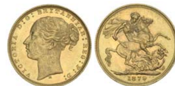
2526* Queen Victoria , 1879 Melbourne (McD.157). Choice uncirculated. $750