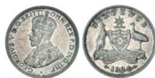
2708* George V, 1924. Some toning over semi mirror-like fields, nearly uncirculated and very scarce as such.