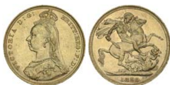
2552* Queen Victoria, 1890 Sydney (McD.180). Nearly uncirculated and rare.