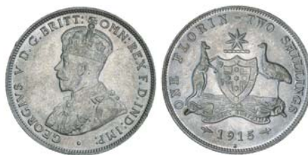
2632* George V, 1915H. Usual Birmingham Mint soft strike, natural frosted silver mint bloom, good extremely fine and rare thus.