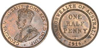
2784* George V, 1916I and 1917I. Brown and red uncirculated; red and brown nearly uncirculated. (2)