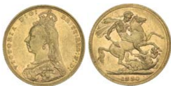
2550* Queen Victoria, 1890 Melbourne. Extremely fine/good extremely fine.