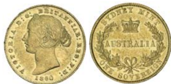
2464* Queen Victoria, second type, 1860. Scuffed on obverse with rim nicks, otherwise very fine/good very fine.