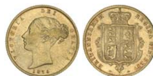
2597* Queen Victoria, 1875 Sydney. Nearly very fine.