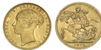
2513* Queen Victoria, 1872 Melbourne. Good extremely fine/nearly uncirculated and rare, especially in this condition.