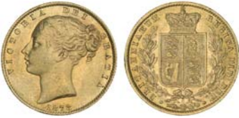
2488* Queen Victoria, 1873 Sydney. Extremely fine.