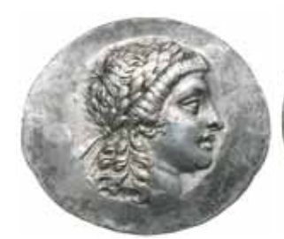
Ex I.S. Wright, Sydney, June 7, 2011, previously from Noble Numismatics Auction Sale 52 (lot 1920).