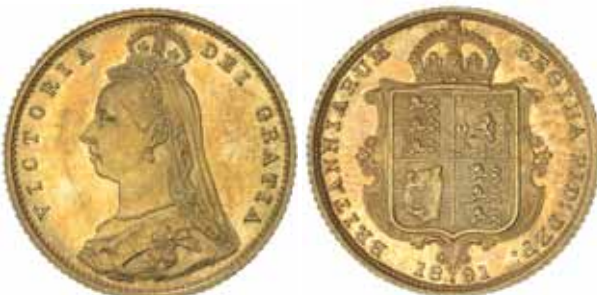
1742* Queen Victoria , 1891 Sydney, with JEB (McD.38). Old orange gold toning on full original mint bloom, hairline in front of portrait, otherwise choice uncirculated and very rare in this condition, one of the finest known. $4,000