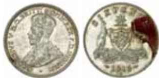
1890* George V, 1916M. Die clashing on obverse, tin rust stained section on reverse, nearly uncirculated.