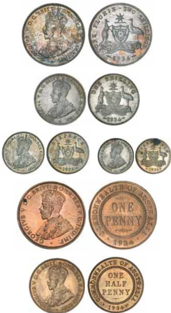
1782* George V , Melbourne Mint proof set, 1934, florin, shilling, sixpence, threepence, penny and halfpenny. The penny with carbon spot at 10 o'clock on the obverse, threepence with carbon spotting on the reverse, otherwise lightly toned subdued mint bloom, nearly FDC and very rare. (6) $32,000