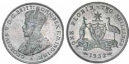
1852* George V, 1932. Toned, specimen-like choice uncirculated and very rare in this condition, one of the finest known.