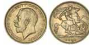
1763* George V , 1912 and 1914 Sydney. Toned, good extremely fine. (2)