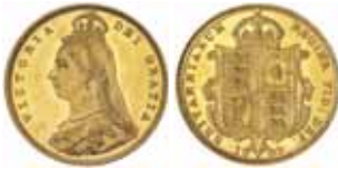
1741* Queen Victoria , 1889 Sydney. Nearly extremely fine/good extremely fine. $750