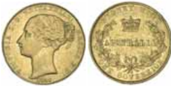
1648* Queen Victoria , first type, 1856. Rim filed, nearly very fine.

Ex Ray Kaleda Collection, Noble Numismatics Sale 111 (lot 1107).