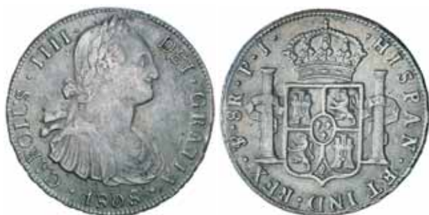
1589* Bolivia , Charles III, eight reales, 1808PJ Potosi Mint (KM.73), doubling of obverse image and legend. A few light scratches, cleaned, fine - nearly very fine. $100