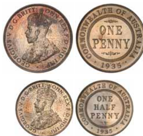
1785* George V , Melbourne Mint proof penny and halfpenny, 1935. Obverses toned, near full brilliant mint red, nearly FDC and rare. (2)