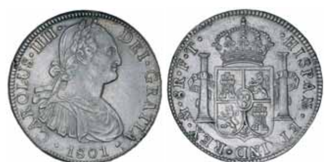
1616* Mexico , Charles III, eight reales, 1801FT, Mexico City Mint (KM.109). Nearly uncirculated.