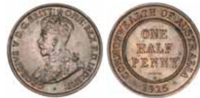
1961* George V, 1915H. Brown with traces of red, nearly uncirculated and rare. $1,500