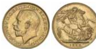
1707* George V , 1922 Melbourne. Nearly uncirculated and very rare, one of the finest known.