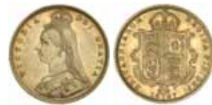
1737* Queen Victoria , Jubilee head, 1887 Melbourne (McD.33a). Good extremely fine/nearly uncirculated.