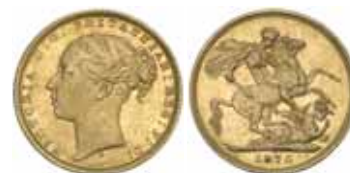
1675* Queen Victoria , 1876 Sydney. Toned, uncirculated/choice uncirculated.

Ex Duoro Cargo with Monetarium certificate 24/2/97.