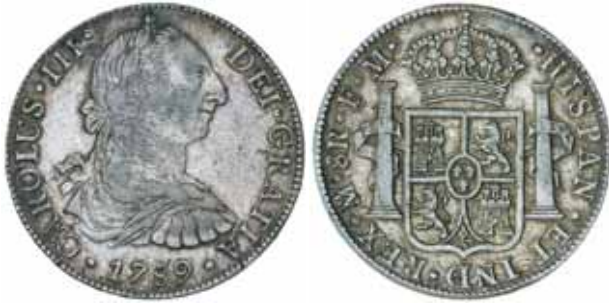
1609* Mexico , Charles III, eight reales, 1789FM, Mexico City Mint (KM.106.2a). Very fine/good very fine.