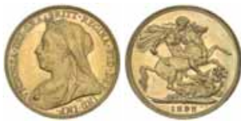
1701* Queen Victoria , 1898 Melbourne. Nearly uncirculated/uncirculated.