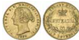
1660* Queen Victoria , second type, 1859. Very fine and rare in this condition.