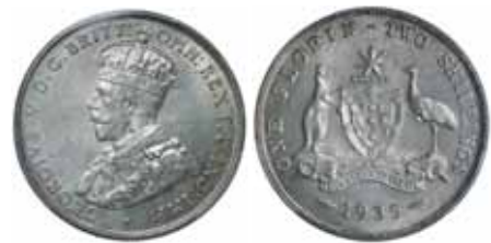
1856* George V, 1935. Lightly toned with subdued original mint bloom, nearly uncirculated.