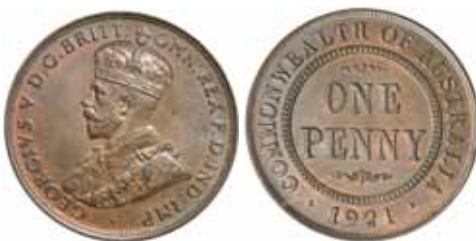
1945* George V , 1921, Indian die. Glossy brown and red, uncirculated and rare in this condition.