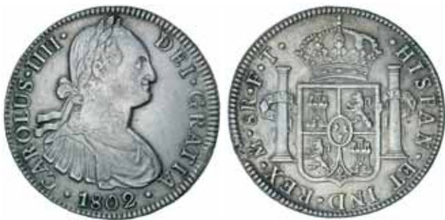
1617* Mexico , Charles III, eight reales, 1802FT, Mexico City Mint (KM.109). Edge flaw near bottom of left column, otherwise good very fine - nearly extremely fine.