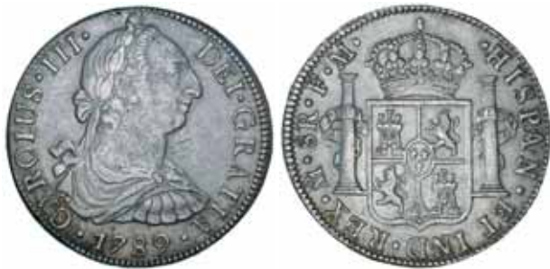
1610* Mexico , Charles III, eight reales, 1789FM, Mexico City Mint (KM.106.2). Very fine.