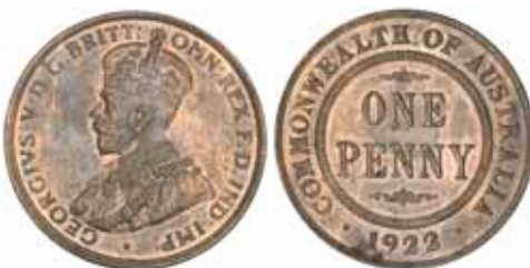
1946* George V , 1922 London die. Streaky red and brown, nearly uncirculated.