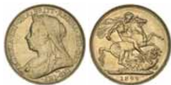
1704* Queen Victoria , 1899 Perth. Nearly extremely fine/extremely fine and scarce.