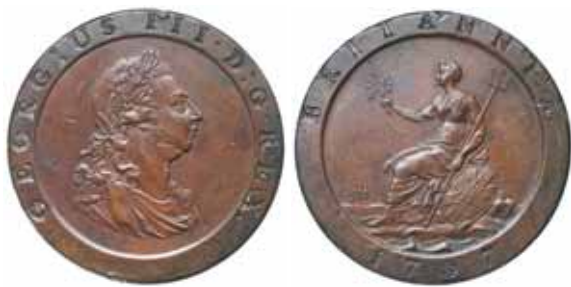
1597* Great Britain , George III, copper cartwheel penny, 1797 (S.3777). Brown, minor marks, extremely fine. $200