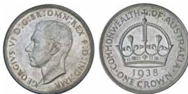
1786* George VI , Melbourne Mint proof crown, 1938. Sealed light golden grey toned patina with underlying mint bloom and slight iridescence, nearly FDC and very rare.