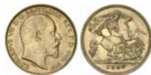
1754* Edward VII , 1907 Melbourne. Vertical obverse die break, good extremely fine.