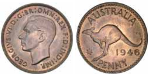
1958* George VI, 1946. Attractive original red and brown toned mint bloom, well struck, choice uncirculated and rare in this condition. $6,000