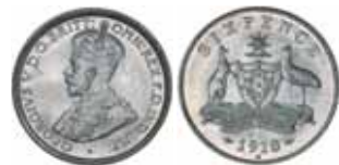
1894* George V, 1918M. Full frosty mint bloom, scuffs in field either side of head, otherwise choice uncirculated and rare in this condition, one of the finest known.