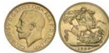
1714* George V, 1926 Melbourne. Extremely fine.