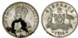
1893* George V, 1916M. Tin-rust adhesion on obverse and edge, nearly full original mint bloom, die break rim through 9 of date, nearly uncirculated/uncirculated.