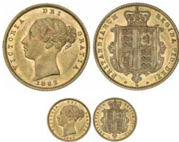
1728* Queen Victoria , 1882 Melbourne (McD.24). Some original mint bloom, toned open areas, nearly uncirculated and rare in this condition.