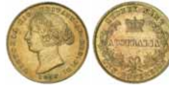
1647* Queen Victoria , first type, 1856. Nearly very fine.