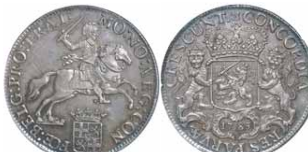
1623* Netherlands , Utrecht, silver rider (or sixty stuivers), 1785 (KM.92.1). Attractive blue grey toning, nearly uncirculated and scarce thus.