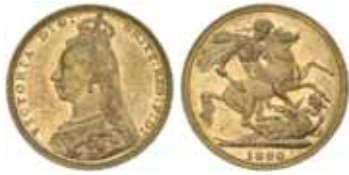
1688* Queen Victoria , 1890 Melbourne. Nearly uncirculated. $400