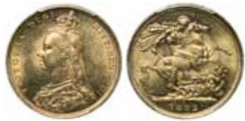
1693* Queen Victoria , 1892 Sydney. Surface marking behind horse, otherwise full original mint bloom, choice uncirculated. $1,000