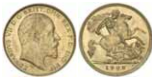
1755* Edward VII , 1908 Melbourne. Subdued original mint bloom, uncirculated.