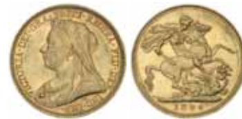
1697* Queen Victoria , 1894 Sydney. Nearly uncirculated. $400