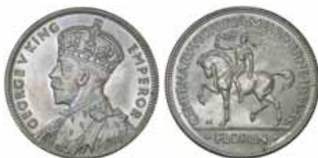
1783* George V , Melbourne Mint specimen 1934-5 Melbourne Centenary florin. Struck with well defined wreath on rider and nipple on breast die state, full subdued sealed frosted mint bloom and unmarked, very rare as a specimen. $5,000

Sold with RCC ticket and probably from a Noble Numismatics Sale.