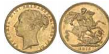
1674* Queen Victoria , 1876 Melbourne. Full underlying mint bloom, choice uncirculated.