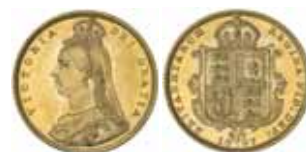
1738* Queen Victoria , Jubilee head, 1887 Melbourne (McD.33c). Attractive orange gold tone on full original mint bloom, choice uncirculated and rare in this condition, one of the finest known.