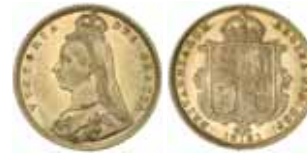
1743* Queen Victoria , 1891 Sydney no JEB (McD.38a). Considerable original mint bloom, nearly uncirculated and rare thus. $1,250