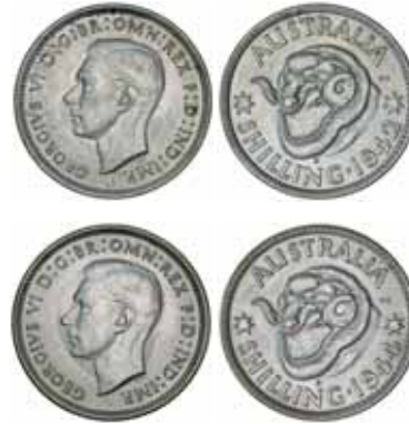
1884* George VI, 1942S, 1943S and 1944S. Choice uncirculated; uncirculated; choice uncirculated. (3)