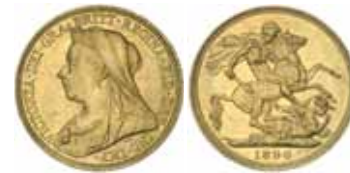
1698 Queen Victoria , 1895 Melbourne. Good extremely fine. $400