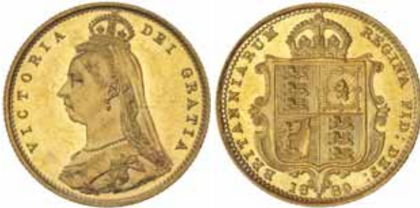
1740* Queen Victoria , 1889 Sydney. Full mint bloom, gem uncirculated, probably the finest known. $12,000

Ex Spink Noble Sale 39 (lot 181), Sale 48 (lot 1648) and Sale 93 (lot 1422).