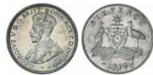
1896* George V, 1918M. Light peripheral toning, good extremely fine and rare in this condition.