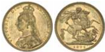
1692* Queen Victoria , 1892 Melbourne. Uncirculated. $450