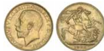
1715* George V, 1926 Perth. Subdued mint bloom, good extremely fine and very scarce.