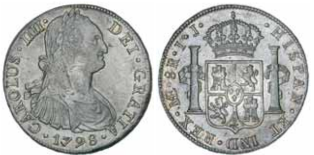
1628* Peru , Charles III, eight reales, 1798IJ, Lima Mint (KM.97). Good extremely fine.