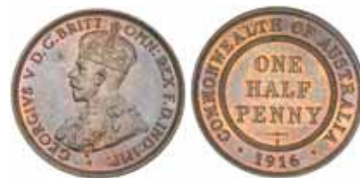
1963* George V, 1916I. Attractive blue brown and red uncirculated. $600

Ex Noble Numismatics Sale 95 (lot 4999).