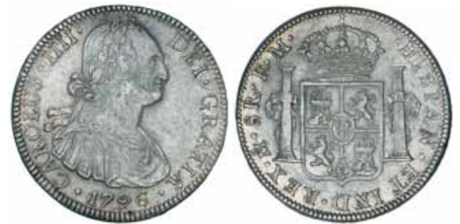
1614* Mexico , Charles III, eight reales, 1796FM, Mexico City Mint (KM.109). Good very fine/nearly extremely fine.