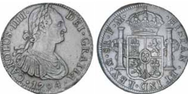
1612* Mexico , Charles III, eight reales, 1794FM, Mexico City Mint (KM.109). Some light contact marks, otherwise extremely fine.