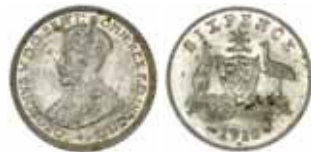
1895* George V, 1918M. Dirt adhesions on the reverse, subdued frosty mint bloom, nearly uncirculated and rare in this condition.