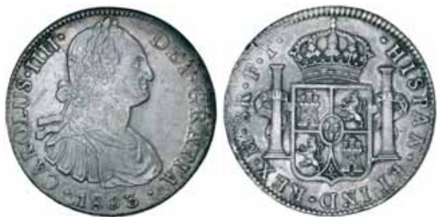
1619* Mexico , Charles III, eight reales, 1803FT, Mexico City Mint (KM.109). Edge flaw at 1-3 o'clock, otherwise good very fine - nearly extremely fine.