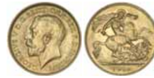
1764* George V , 1915 Melbourne. Toned, subdued mint bloom, nearly uncirculated.