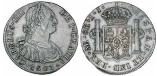
1629* Peru , Charles III, eight reales, 1801IJ, Lima Mint (KM.97). Hairlines, otherwise good extremely fine.