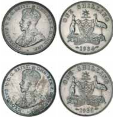
1880* George V, 1934, 1935 and 1936. Rubbed, good extremely fine; toned, nearly uncirculated; good extremely fine. (3)