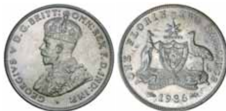
1857* George V, 1936. Obverse with brilliance, reverse lightly toned, choice uncirculated.