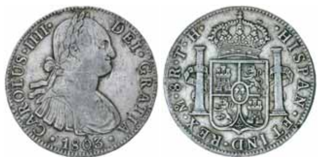
1620* Mexico , Charles III, eight reales, 1803TH, Mexico City Mint (KM.109). Thin scratches on obverse and edge nick, otherwise very fine and scarce year.

Ex IAG Sale 81 (lot 59). In a slab by NGC as AU58.