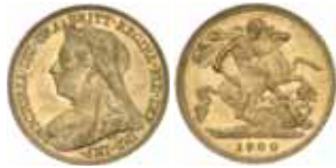
1748* Queen Victoria , 1900 Melbourne. Considerable original mint bloom, uncirculated and rare in this condition, one of the finest known.