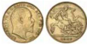
1756* Edward VII , 1908 Perth. Good very fine and very scarce.