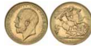
1765* George V , 1915 Perth. Choice uncirculated and scarce in this condition, one of the finest known.