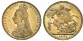
1690* Queen Victoria , 1891 Melbourne (McD.183a). Orange gold toning, choice uncirculated. $500