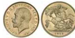
1766* George V , 1915 Sydney. Choice uncirculated.