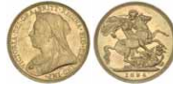
1696* Queen Victoria , 1894 Melbourne. Uncirculated. $400