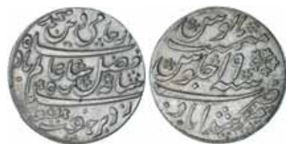
1600* India , Bengal Presidency, rupee, Murshidabad type, Yr.19 (1793) (KM.84.2). Slight adjustment mark lower right of reverse, otherwise good extremely fine. $100