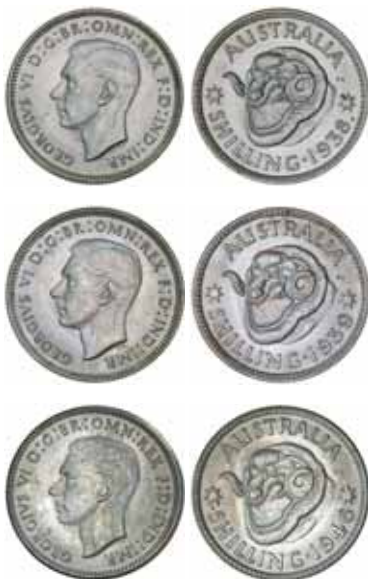
1882* George VI - Elizabeth II, 1938, 1939, 1941-1963, all in a Supreme album, the 1943 ex AFS in 2013, total cost approx $4,000. Uncirculated - choice uncirculated. (25)