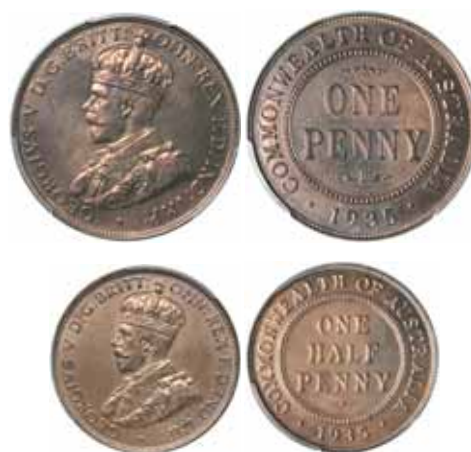
1784* George V , Melbourne Mint proof penny and halfpenny, 1935. Slight toning on the penny, both brilliant, the halfpenny full mint red, FDC and rare as such. (2)

Sold with RCC ticket and probably from a Noble Numismatics Sale.