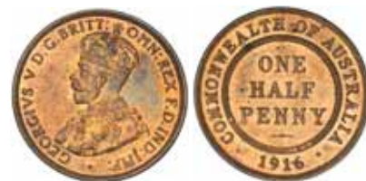
1962* George V, 1916I. Nearly full mint red uncirculated, obverse partly toned. $850

Ex Noble Numismatics Sale 95 (lot 4999).