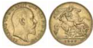
1758* Edward VII , 1909 Perth. Extremely fine and scarce thus.