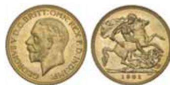
1722* George V , small head, 1931 Melbourne. Nearly uncirculated/uncirculated and very scarce.