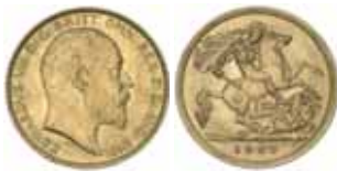
1757* Edward VII , 1908 Sydney. Subdued original mint bloom, uncirculated.