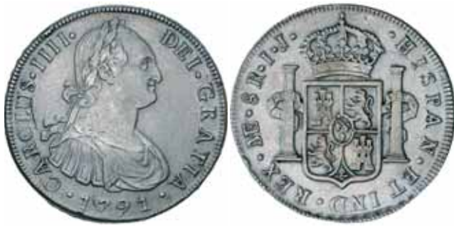
1625* Peru , Charles III, eight reales, 1791IJ, Lima Mint (KM.97). Hairlines and cut under OLU of CAROLUS, otherwise very fine.