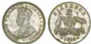
1891* George V, 1916M. Subdued original mint bloom, contact mark right obverse field, otherwise nearly uncirculated.