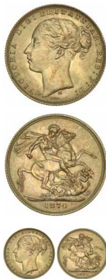
1673* Queen Victoria , 1874 Melbourne. Subdued original mint bloom, cartwheeling in centre of the obverse, choice uncirculated and very rare in this condition, one of the finest known.