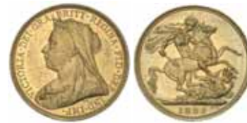
1694* Queen Victoria , old head, 1893 Sydney. Full mint bloom, uncirculated. $450