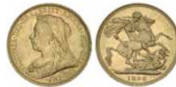
1699* Queen Victoria , 1896 Sydney. Choice uncirculated. $600