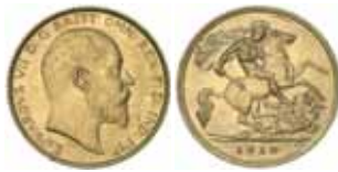
1759* Edward VII , 1910 Sydney. Uncirculated.