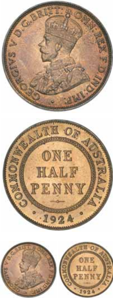
1780* George V , Melbourne Mint proof halfpenny, 1924. Obverse brown toned, reverse nearly full mint red, nearly FDC and very rare.