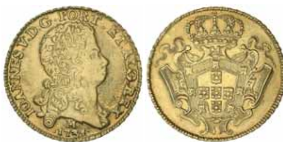
1590* Brazil , John V, 12,800 reis or Johanna, 1731M (Minas Gerais)(KM.139). Moderate die rust on obverse, good very fine. $5,000 Private purchase from The Rare Coin Co.