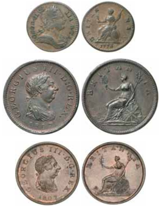
part 1598* Great Britain , George III, copper coinage, first issue, halfpenny and farthing, 1773; second issue, twopence, 1797; third issue, halfpenny and farthing, 1799; fourth issue, penny, halfpenny and farthing, 1806, another set, 1807. Fine - nearly uncirculated. (11) $320