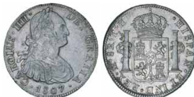
1622* Mexico , Charles III, eight reales, 1807TH, Mexico City Mint (KM.109). Good extremely fine.