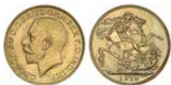
1706* George V , 1919 Melbourne. Good extremely fine/nearly uncirculated and scarce.