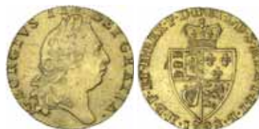
1593* Great Britain , George III, guinea, fifth bust or spade type, 1798 (S.3729). Nearly extremely fine. $900