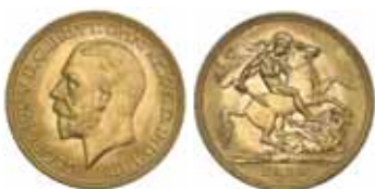
1720* George V , small head, 1929 Melbourne. Semi-frosted, choice uncirculated and rare, especially in in this condition.