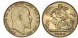
1752* Edward VII , 1904 Perth. Nearly extremely fine and rare.