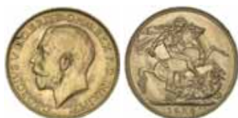
1710* George V, 1924 Melbourne. Nearly uncirculated.