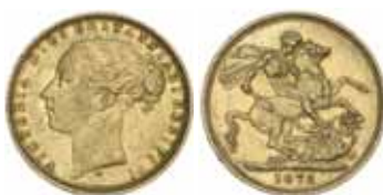
1672* Queen Victoria , 1872 Melbourne. Very fine and scarce. $400