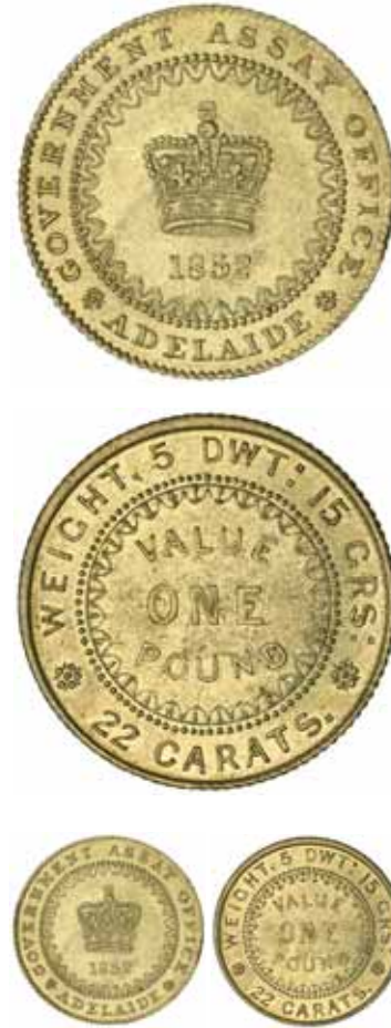
1643* Adelaide pound , 1852, second type, with crenellated inner circle on the reverse. Early die state and well struck with nearly full mint bloom, obverse rim flaw at 3:30 o'clock barely noticeable, nearly uncirculated and rare, especially in this condition.