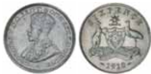
1887* George V, 1912. Lightly toned, choice uncirculated and very rare in this condition, one of the finest known.