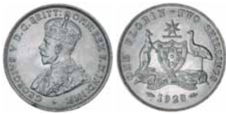
1851* George V, 1928. Well struck up, semi-matte surface, uncirculated.