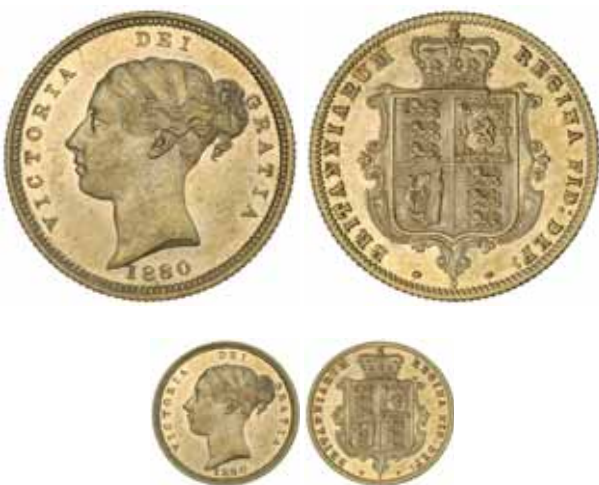
1726* Queen Victoria , 1880 Sydney. Proof-like obverse, obverse die break at 11 o'clock, minor obverse contact mark, otherwise nearly uncirculated and rare in this condition.

Probably ex Ballarat Hoard and from Spink Australia in 1978.