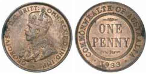
1956* George V, 1933. Brown and red, nearly uncirculated. $150