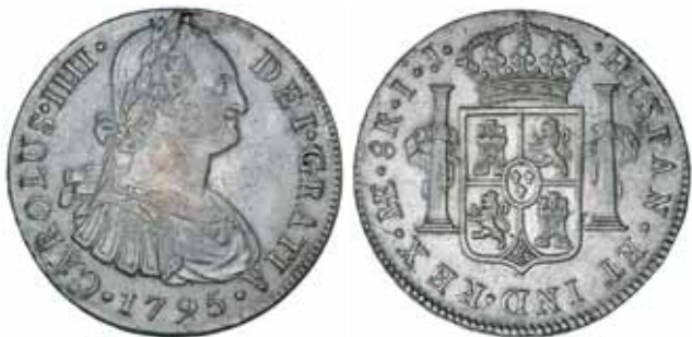
1627* Peru , Charles III, eight reales, 1795IJ, Lima Mint (KM.97). Good very fine.