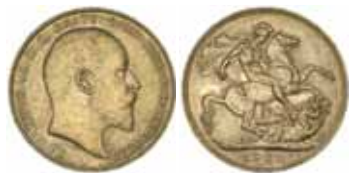
1705* Edward VII , 1909 Perth. Subdued matte mint bloom, nearly uncirculated.