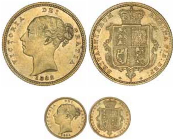
1731* Queen Victoria , 1882 Sydney. Nearly extremely fine and very rare in this condition.