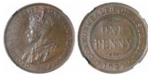
1948* George V , 1927 London die. Reflective blue brown patina with hints of red, nearly uncirculated.