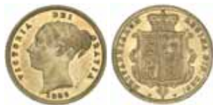
1733* Queen Victoria , 1883 Sydney (McD.25a). Good extremely fine and rare in this condition.