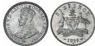
1897* George V, 1919M. Full original mint bloom and well struck, choice uncirculated.