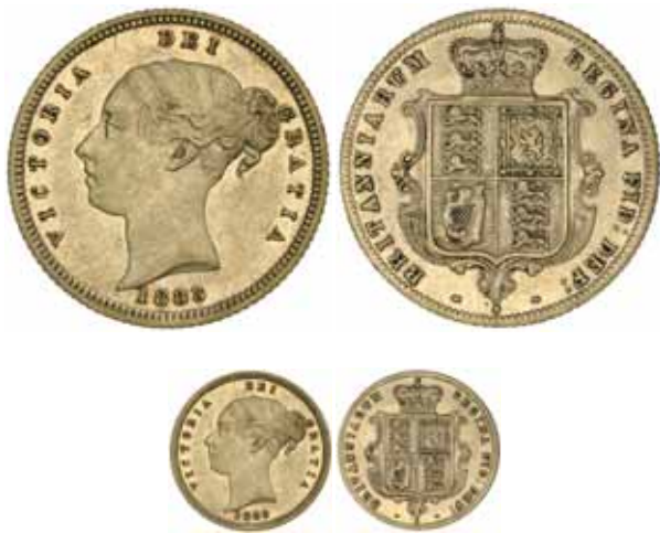
1732* Queen Victoria , 1883 Sydney (McD.25). Extremely fine and very rare, missing from most collections.