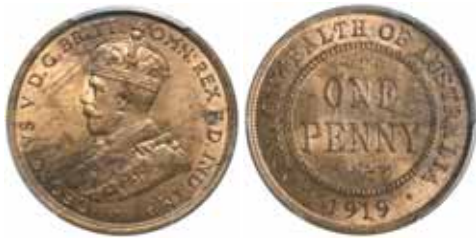
1943* George V , 1919. Subdued nearly full original mint red with slight carbon tone streaking and spots on the obverse, uncirculated and rare in this condition.