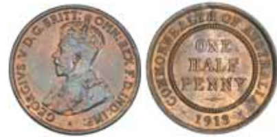
1960* George V, 1913. Partial mint red, nearly uncirculated. $150