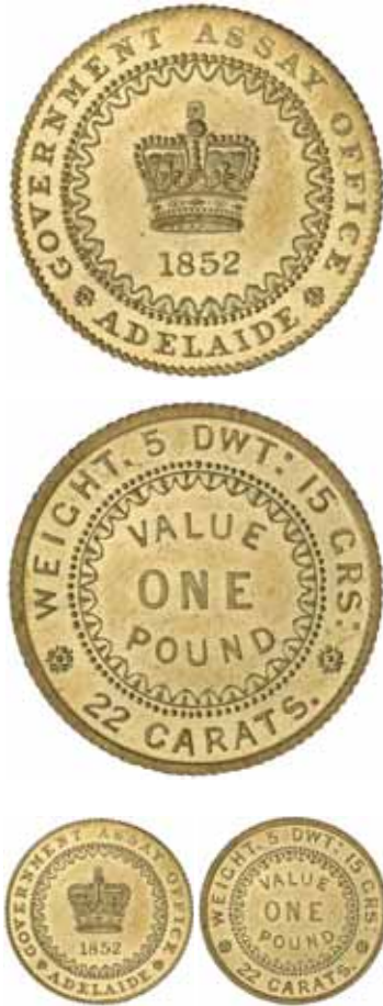
1642* Adelaide pound , 1852, second type, with crenellated inner circle on the reverse. Struck from the early die state, brilliant, proof-like uncirculated and very rare as such, one of the finest known.