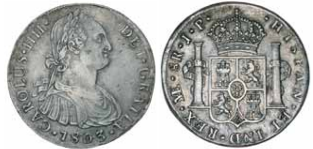
1630* Peru , Charles III, eight reales, 1803/2JP, Lima Mint (KM.97). Hairlines, otherwise extremely fine.