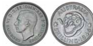
1885* George VI, 1943, 1946, 1948, 1950 and 1952. The first scuffed on jaw, the others choice uncirculated. (5)