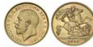
1762* George V , 1911 Sydney. Nearly uncirculated.