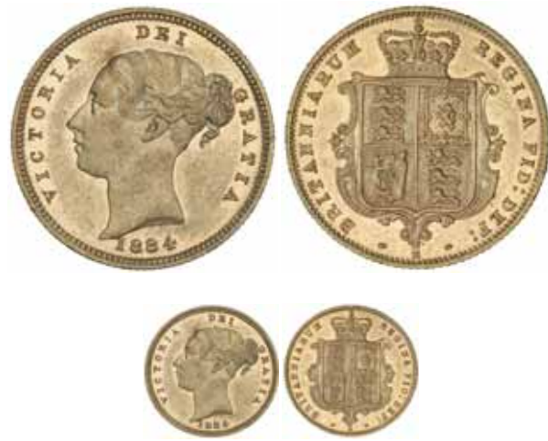
1734* Queen Victoria , 1884 Melbourne. Reverse rim nicks at 3 o'clock, considerable mint bloom, nearly uncirculated and rare in this condition.