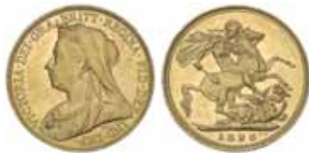
1702* Queen Victoria , 1898 Sydney. Nearly uncirculated.