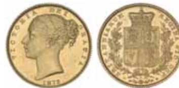
1770* Queen Victoria , Melbourne Mint presentation proof-like specimen sovereign, 1872. Minute obverse rim bruise at 11.30 o'clock, otherwise nearly FDC and excessively rare if not unique, of considerable historical interest. $30,000

A contemporary letter states in full 'For Flora, One of the first thirty sovereigns struck off at the Victorian Mint by the Governor of the Colony in 1872. From Her Father P.Normanby'.