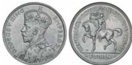
1855* George V, 1934-35 Melbourne Centenary. Flat wreath, otherwise nearly uncirculated.