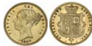
1735* Queen Victoria , young head, 1887 Sydney. Obverse tiny hairline scratch, extremely fine/good extremely fine.