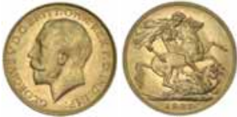
1718* George V , 1927 Perth. Uncirculated.