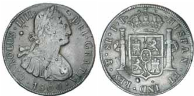
1587* Bolivia , Charles III, eight reales, 1800PP, Potosi Mint, (KM.73). Nearly very fine with several chopmarks. $100