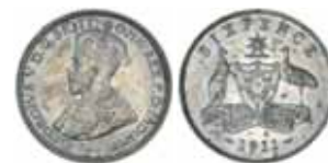
1886* George V, 1911. Considerable original mint bloom, nearly uncirculated and very scarce in this condition.