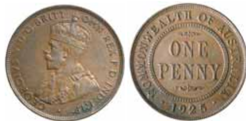
1947* George V , 1925 London die. Even brown, good very fine.