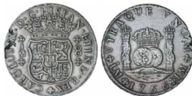
1624* Peru , Charles III, eight reales, 1766JM pillar dollar type, Lima Mint with one dot above L (KM.A64.2). Planchet flaw on obverse near edge, and evidence of overstrike on another coin on obverse near top, extremely fine.