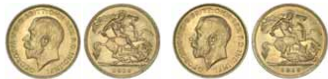
1767* George V , 1915 and 1916 Sydney. Choice uncirculated. (2)