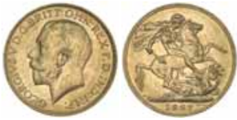
1717* George V , 1927 Perth. Considerable original mint bloom, nearly uncirculated and scarce.