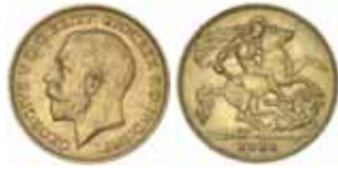
1761* George V , 1911 Perth. Toned, good extremely fine.