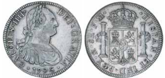
1613* Mexico , Charles III, eight reales, 1796FM, Mexico City Mint (KM.109). Good very fine/extremely fine.