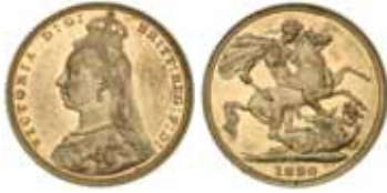
1689* Queen Victoria , 1890 Sydney (McD.180a). Brilliant mint bloom, nearly uncirculated/uncirculated. $400