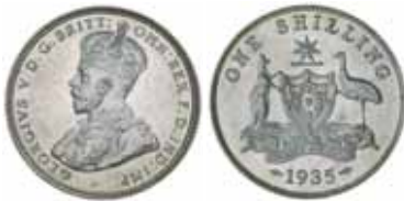
1881* George V, 1935. Proof-like, choice uncirculated.