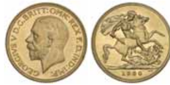
1721* George V , small head, 1930 Melbourne. Choice uncirculated and scarce.