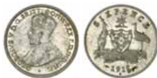
1892* George V, 1916M. Nearly uncirculated.