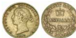
1662* Queen Victoria , second type, 1860. Slightly bent, good fine and rare.