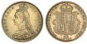
1739* Queen Victoria , Jubilee head, 1887 Sydney (McD.32a). Lightly toned reverse, good extremely fine. $600