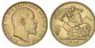
1760* Edward VII , 1910 Sydney. Nearly uncirculated.