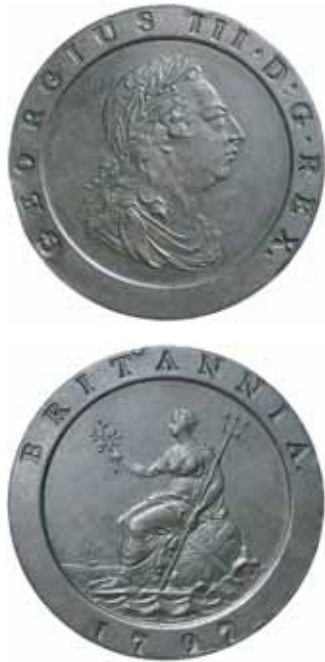
1595* Great Britain , George III, copper cartwheel twopence, 1797 (S.3776). Even dark brown patina, nearly extremely fine. $200