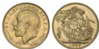
1709* George V, 1923 Melbourne. Uncirculated.