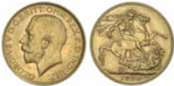
1719* George V , 1928 Perth. Nearly uncirculated.