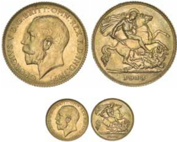
1768* George V , 1918 Perth. Uncirculated and very rare. $3,500