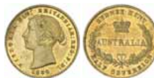
1658* Queen Victoria , second type, 1870. Considerable mint bloom and well struck braids, uncirculated and rare thus.