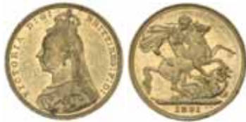
1691* Queen Victoria , 1891 Sydney. Nearly uncirculated. $400