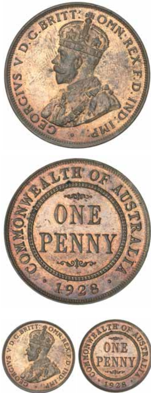
1781* George V , Melbourne Mint proof penny, 1928. Nearly full original brilliant mint red FDC and very rare, one of the finest known.