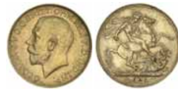
1711* George V, 1924 Perth. Dull toned, good extremely fine.