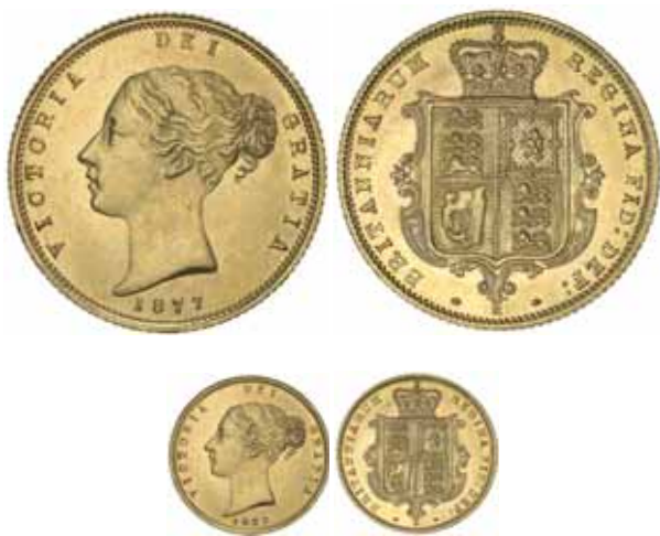
1725* Queen Victoria , 1877 Melbourne. Uncirculated/choice uncirculated and rare in this condition, one of the finest known.