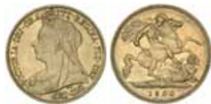
1749* Queen Victoria , 1900 Perth. Nearly extremely fine and rare in this condition.