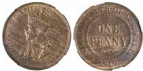
1944* George V , 1919 dot below. Streaky brown and red tone, nearly uncirculated.

Ex Noble Numismatics Sale 78A (lot 1484).