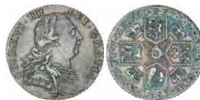
1594* Great Britain , George III, shilling, 1787 (S.3743) another, without stop over head (S.3744), sixpence, 1787 without semee of hearts (S.3749), third issue, halfpenny, 1799 (S.3778). Good fine - good very fine. (4) $150