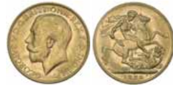
1712* George V, 1925 Perth. Soft strike, nearly uncirculated.