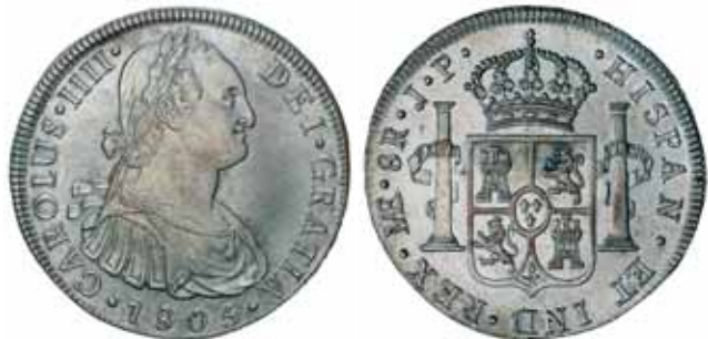
1631* Peru , Charles III, eight reales, 1805JP, Lima Mint (KM.97). Hairlines, extremely fine.