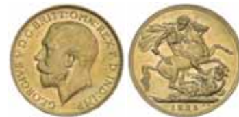
1713* George V, 1925 Perth. Nearly uncirculated.