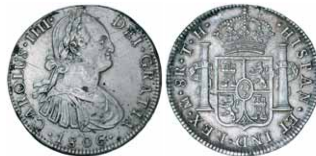
1621* Mexico , Charles III, eight reales, 1806TH, Mexico City Mint (KM.109). A few thin scratches and short planchet above crown, otherwise good very fine.