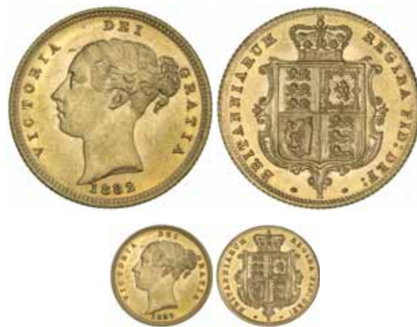
1729* Queen Victoria , 1882 Melbourne (McD.24a). Full original mint bloom, choice uncirculated and rare in this condition, one of the finest known.