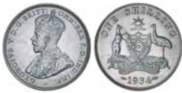
1879* George V, 1934. Proof-like choice uncirculated.