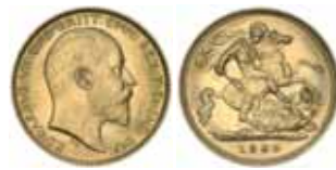
1751* Edward VII , 1902 Sydney. Uncirculated and rare in this condition, one of the finest known.