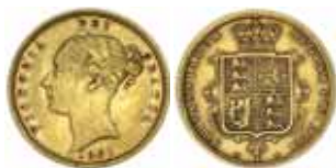
1727* Queen Victoria , 1881 Sydney (McD.21a). Very fine or better.

From the Ballarat Hoard and Spink Australia privately in 1978.