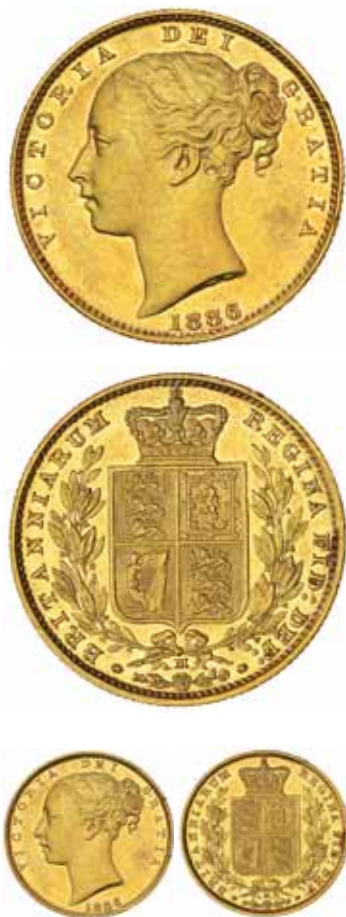
1671* Queen Victoria , 1886 Melbourne. Good extremely fine and very rare in this condition, one of the finest known. $15,000

Ex Noble Numismatics Sale 93 (lot 1342).