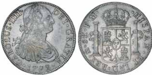
1611* Mexico , Charles III, eight reales, 1792FM, Mexico City Mint (KM.109). Extremely fine.