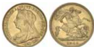
1750* Queen Victoria , 1900 Sydney. Subdued mint bloom, uncirculated.