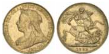
1703* Queen Victoria , 1899 Perth. Obverse surface marks, otherwise extremely fine/good extremely fine and scarce.