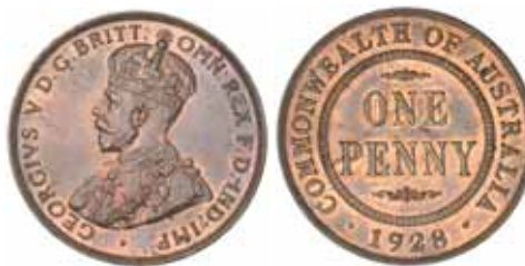
1949* George V , 1928 London die, almost broken 8. Crimson obverse, reverse full brilliant red, choice uncirculated and very rare thus.