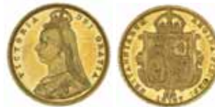
1736* Queen Victoria , Jubilee head, 1887 Melbourne (McD.33). Nearly uncirculated.