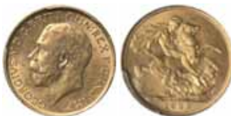
1708* George V, 1922 Sydney. Nearly uncirculated/uncirculated and very rare, especially in this condition.