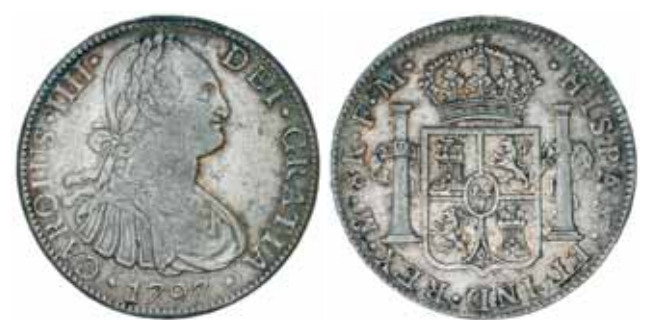
1615* Mexico , Charles III, eight reales 1797FM, Mexico City Mint (KM.109). Attractive patination, good very fine.