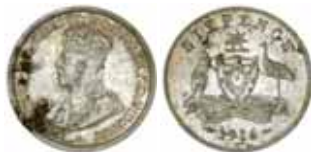
1889* George V, 1916M. Tin rust or dirt adhesions, full original mint bloom on the reverse, nearly uncirculated/uncirculated.