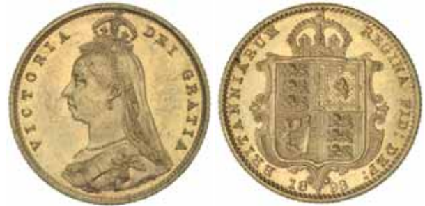
1744* Queen Victoria , Jubilee head, 1893 Melbourne. Subdued original mint bloom, lightly toned, uncirculated and rare thus. $2,500

Ex Spink Noble Sale 39 (lot 181), Sale 48 (lot 1648) and Sale 93 (lot 1422).