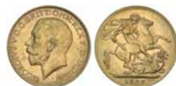
1716* George V, 1926 Perth. Nearly uncirculated and very scarce.