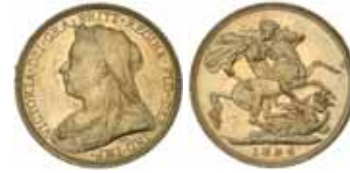
1695* Queen Victoria , 1894 Melbourne. Full original mint bloom, choice uncirculated. $500