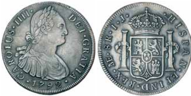
1626* Peru , Charles III, eight reales, 1792IJ, Lima Mint (KM.97). Cleaned now re-toning, ghosting of King's bust on reverse, otherwise very fine.