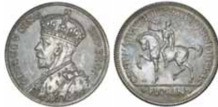
1854* George V, 1934-35 Melbourne Centenary. Toned, uncirculated.