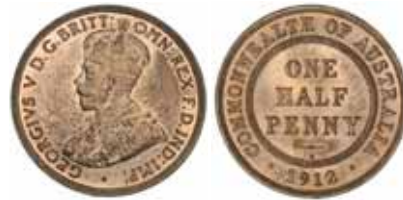
1959* George V, 1912H. Full original mint red, selected from the Baldwin group, gem uncirculated. $1,500