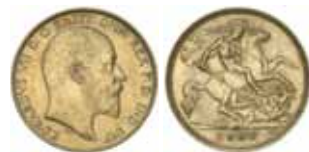
1753* Edward VII , 1906 Melbourne. Good extremely fine and rare in this condition, one of the finest known.