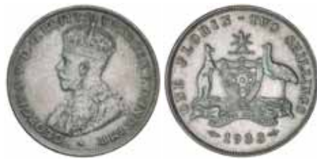
1853* George V, 1933. Light grey tone, extremely fine and rare in this condition.