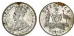
1888* George V, 1916M. Rust adhesions, some brilliance on the reverse, nearly uncirculated/uncirculated.