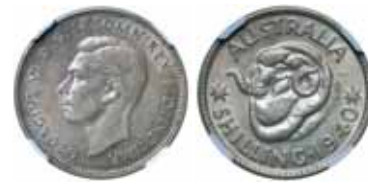
1883* George VI, 1940. Toned, nearly uncirculated with obverse well struck up.