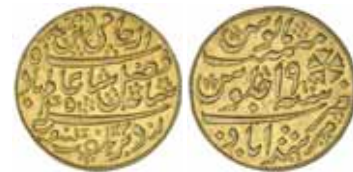
1599* India , Bengal Presidency, EIC, Murshidabad type half mohur (1793) (KM.101). Good very fine. $350

The 1807 halfpenny (nearly uncirculated) from P.Brooks, Colonial Coins, several others ex I.S.Wright auctions.