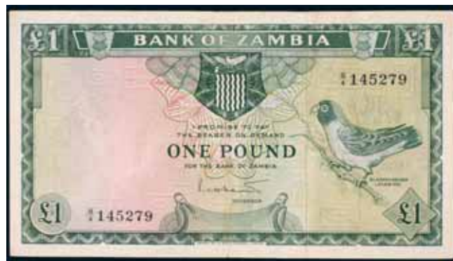
3593* Zambia , Bank of Zambia, one pound, undated (1964), B/4 145279 (P.2a). Very fine and scarce.