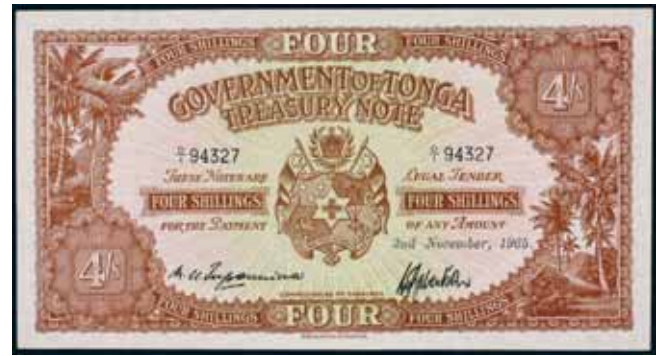
3495* Tonga , Government of Tonga, Treasury Note, four shillings, 2nd November, 1965, D/1 94327 (P.9d). Centre fold, extremely fine.