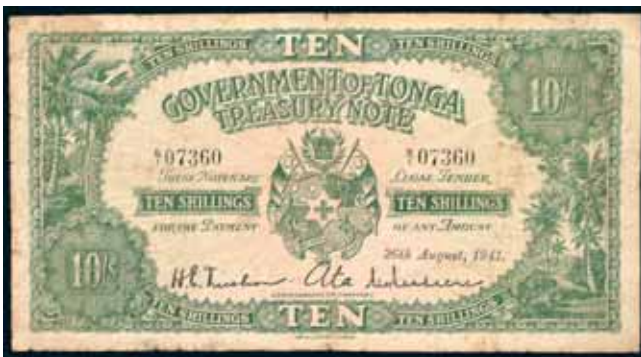
3501* Tonga , Government of Tonga, Treasury Note, ten shillings, 26th August, 1941, B/1 07360 (P.10a). Folds and creases, small central hole, a few small tears in margins, two small stains, very good. $150