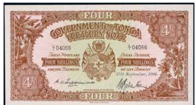
3498* Tonga , Government of Tonga, Treasury Note, four shillings, 27th September, 1966, E/1 04066 (P.9d). Uncirculated.