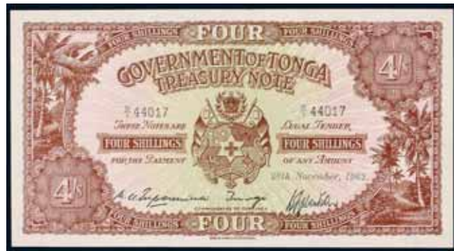
3487* Tonga , Government of Tonga, Treasury Note, four shillings, 28th November, 1962, D/1 44017 (P.9d). Uncirculated.