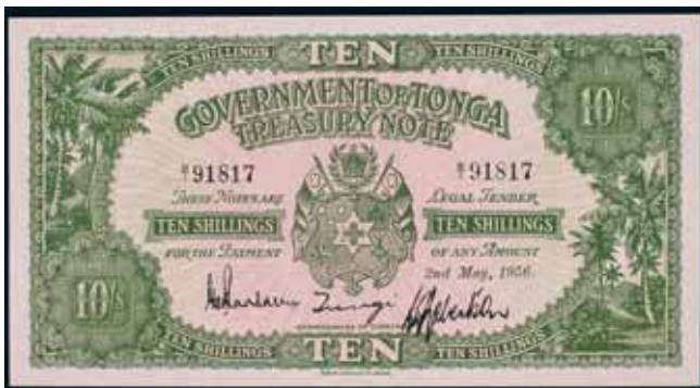
3510* Tonga , Government of Tonga, Treasury Note, ten shillings, 2nd May, 1956, B/1 91817 (P.10c). Uncirculated. $300