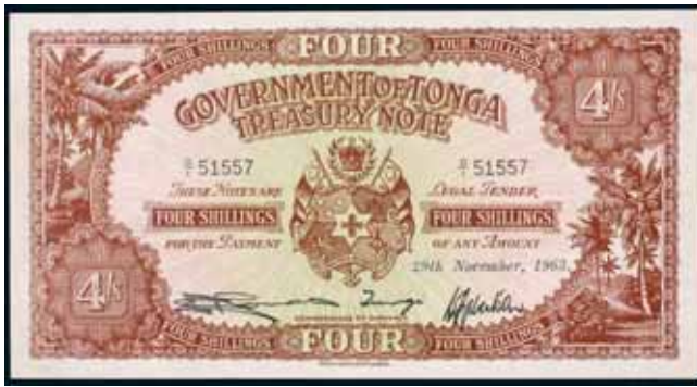
3489* Tonga , Government of Tonga, Treasury Note, four shillings, 29th November, 1963, D/1 51557 (P.9d). Flattened of centre fold, good extremely fine.