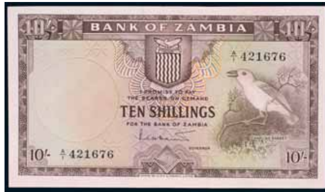
3592* Zambia , Bank of Zambia, ten shillings, undated (1964), A/1 421676 (P.1a). Extremely fine and scarce.