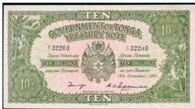
3517* Tonga , Government of Tonga, Treasury Note, ten shillings, 12th December, 1961, C/1 32203 (P.10d). Nearly extremely fine. $80