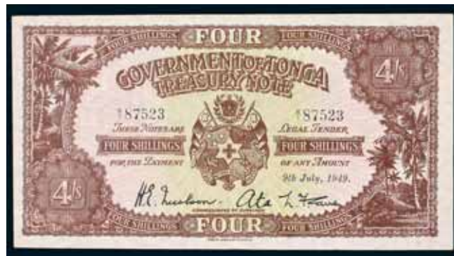
3460* Tonga , Government of Tonga, Treasury Note, four shillings, 9th July, 1949, B/1 87523 (P.9b). Good very fine.