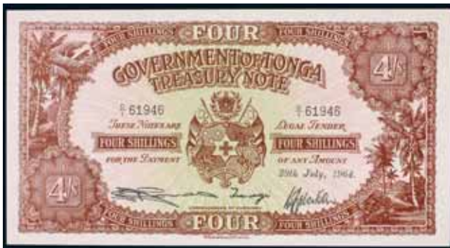
3490* Tonga , Government of Tonga, Treasury Note, four shillings, 29th July, 1964, D/1 61946 (P.9d). Uncirculated.