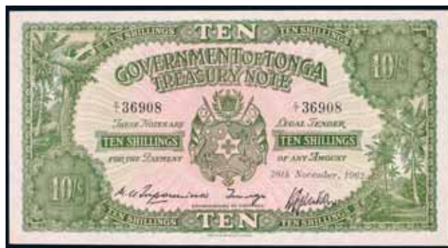
3518* Tonga , Government of Tonga, Treasury Note, ten shillings, 28th November, 1962, C/1 36908 (P.10d). Uncirculated. $120