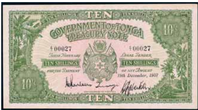
3512* Tonga , Government of Tonga, Treasury Note, ten shillings, 19th December, 1957, C/1 00027 (P.10c). Nearly extremely fine. $150