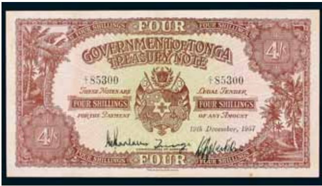
3479* Tonga , Government of Tonga, Treasury Note, four shillings, 19th December, 1957, C/1 85300 (P.9c). Small tone spot bottom margin, otherwise extremely fine.