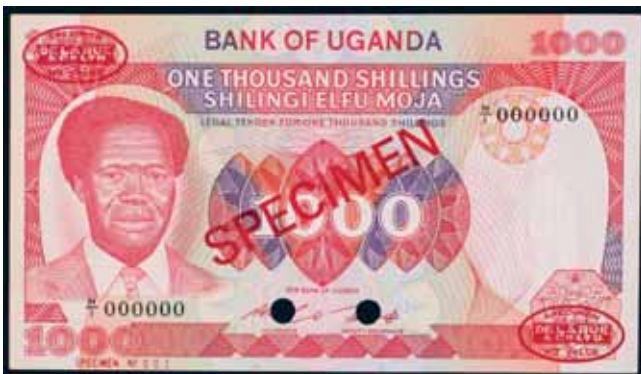
lot 3579 part