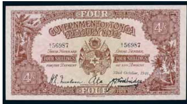
3456* Tonga , Government of Tonga, Treasury Note, four shillings, 22nd October, 1946, B/1 56987 (P.9a). Extremely fine or better and rare as such.