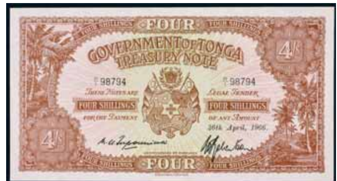
3497* Tonga , Government of Tonga, Treasury Note, four shillings, 26th April, 1966, D/1 98794 (P.9d). Uncirculated.