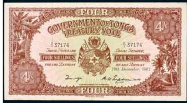
3486* Tonga , Government of Tonga, Treasury Note, four shillings, 12th December, 1961, D/1 37174 (P.9d). Three vertical folds, good very fine.