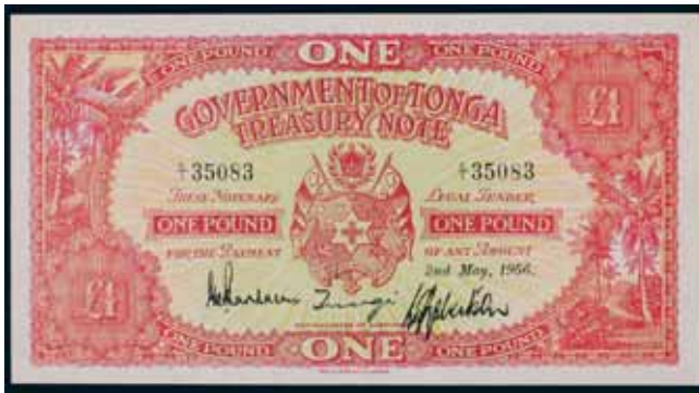
3534* Tonga , Government of Tonga, Treasury Note, one pound, 2nd May, 1956, C/1 35083 (P.11c). Light centre fold, nearly uncirculated.