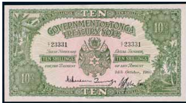
3515* Tonga , Government of Tonga, Treasury Note, ten shillings, 24th October, 1960, C/1 23331 (P.10d). Uncirculated. $100