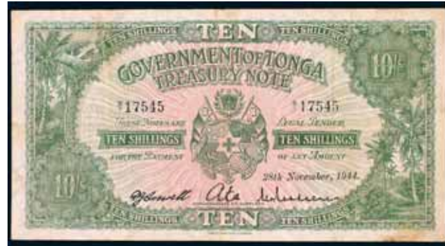
3503* Tonga , Government of Tonga, Treasury Note, ten shillings, 28th November, 1944, B/1 17545 (P.10a). Flattened, minor staining, nearly very fine. $120