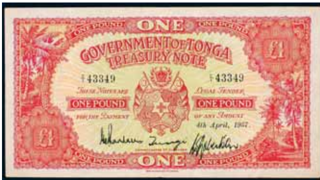
3535* Tonga , Government of Tonga, Treasury Note, one pound, 4th April, 1957, C/1 43349 (P.11c). Very fine.