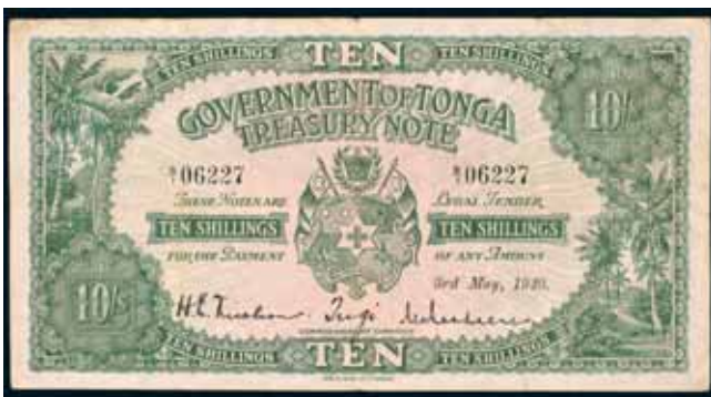
3500* Tonga , Government of Tonga, Treasury Note, ten shillings, 3rd May, 1940, B/1 06227 (P.10a). Folds and creases especially on back, good fine/fine. $250