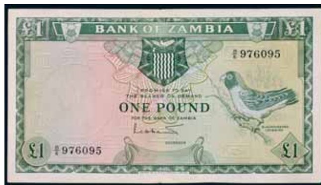
3594* Zambia , Bank of Zambia, one pound, undated (1964), B/6 976095 (P.2a). Very fine and scarce.