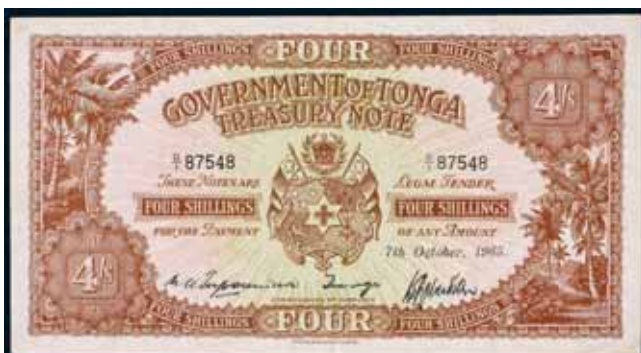
3494* Tonga , Government of Tonga, Treasury Note, four shillings, 7th October, 1965, D/1 87548 (P.9d). Extremely fine.