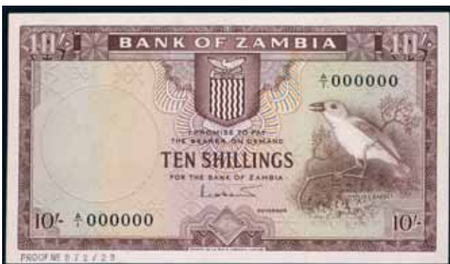
3591* Zambia , Bank of Zambia, specimen ten shillings, undated (1964), A/1 000000, Proof No. 872/29 printed at left in lower margin. (P.1s). Uncirculated and scarce.