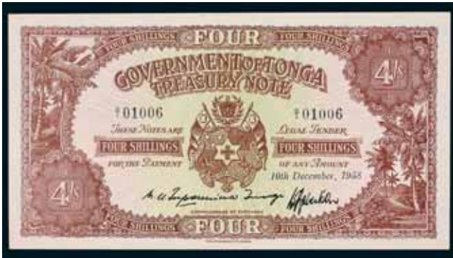
3481* Tonga , Government of Tonga, Treasury Note, four shillings, 10th December, 1958, D/1 01006 (P.9c). Uncirculated.