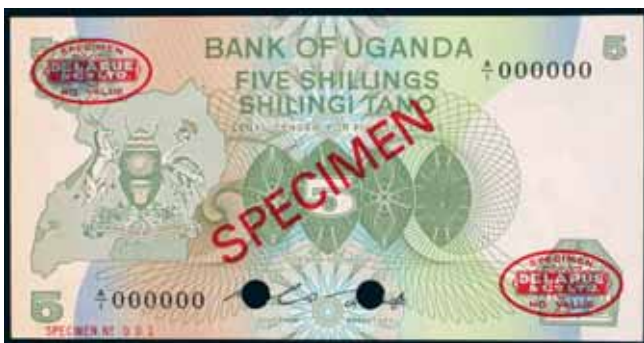
lot 3578 part