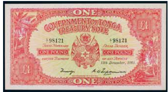
3542* Tonga , Government of Tonga, Treasury Note, one pound, 12th December, 1961, C/1 98121 (P.11c). Slight bend on bottom left corner, otherwise uncirculated.