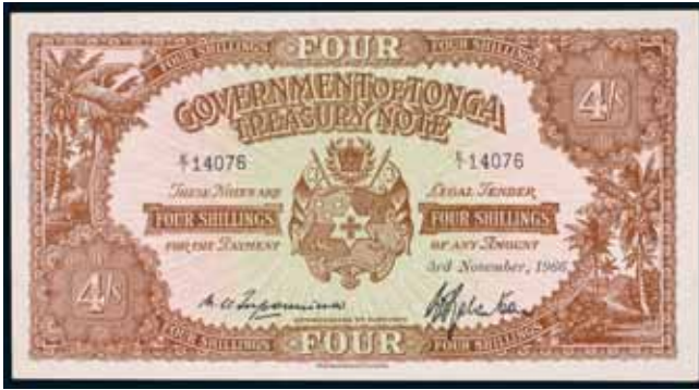
3499* Tonga , Government of Tonga, Treasury Note, four shillings, 3rd November, 1966, E/1 14076 (P.9e). Uncirculated. $80