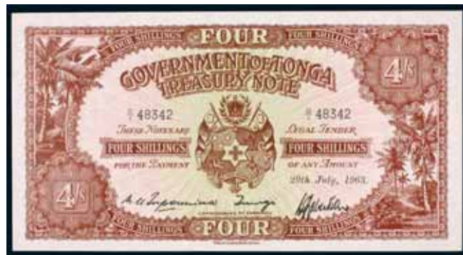
3488* Tonga , Government of Tonga, Treasury Note, four shillings, 29th July, 1963, D/1 48342 (P.9d). Uncirculated.