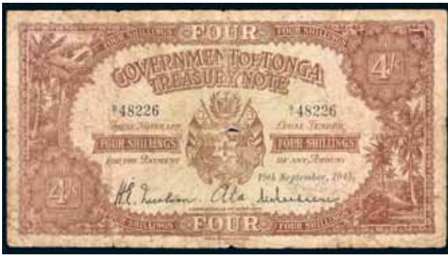
3452* Tonga , Government of Tonga, Treasury Note, four shillings, 19th September, 1945, B/1 48226 (P.9a). Several holes and tears, still a full note, good and scarce.