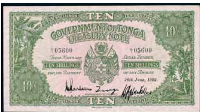
3513* Tonga , Government of Tonga, Treasury Note, ten shillings, 26th June, 1958, C/1 05600 (P.10c). Extremely fine. $150