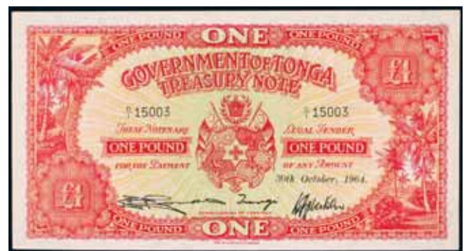
3545* Tonga , Government of Tonga, Treasury Note, one pound, 30th October, 1964, D/1 15003 (P.11d). Uncirculated.