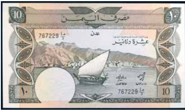
3588* Yemen , Bank of Yemen, ten dinars, undated (1984), 767229 (P.9b). Uncirculated.