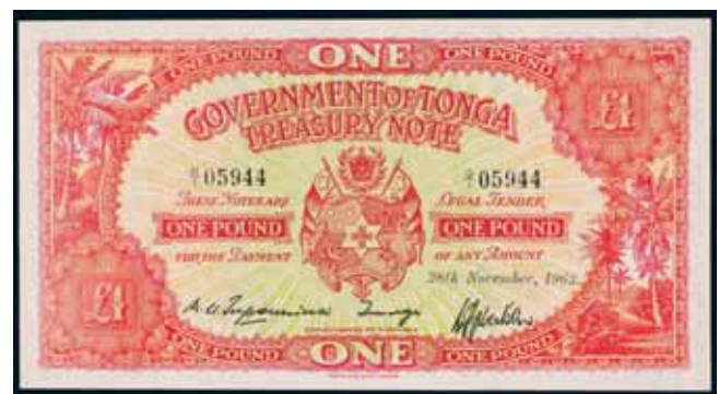
3543* Tonga , Government of Tonga, Treasury Note, one pound, 28th November, 1962, D/1 05944 (P.11d). Uncirculated.