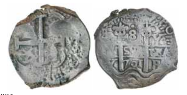
2082* Bolivia, Charles II, cob eight reales, 1701, Potosi Mint (26.86g)(KM.26). Very fine. $300