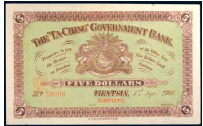
1968* China , Empire, The Ta Ching Government Bank, 1906 issue, Kaifong, five dollars, No 59090, unissued remainder (P.A70r). Small stain and wrinkle, otherwise uncirculated and rare. $2,000

In a PMG holder as choice uncirculated 63NET.