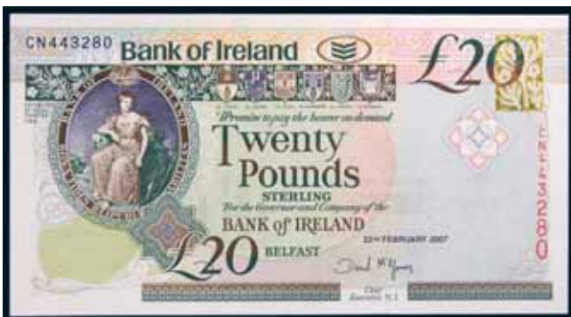
2016* Ireland , Northern Ireland, Bank of Ireland, twenty pounds, 22nd February 2007, CN443280 (P.80c). Uncirculated.