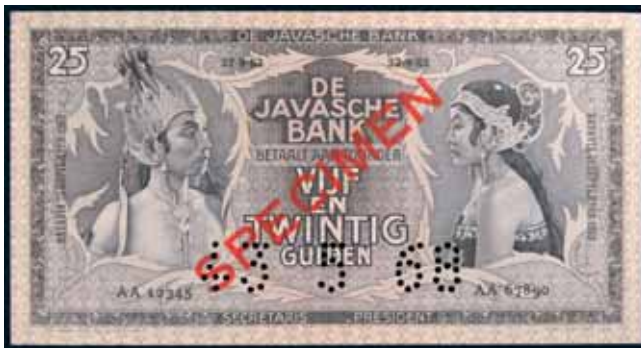
2024* Netherlands Indies , de Javasche Bank, specimen twenty five gulden, undated (1934-39) (32 September 1963), discordant serial numbers AA 12345 and AA 67890, cancel perforations '13 3 68' at bottom, SPECIMEN stamped diagonally in red on front and back (P.80s). Nearly uncirculated. $100