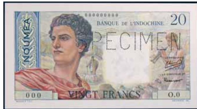
2034* New Caledonia , Banque de L'Indochine, specimen twenty francs, undated (1951) O.0 000, SPECIMEN perforated in centre (P.50as). Uncirculated. $200