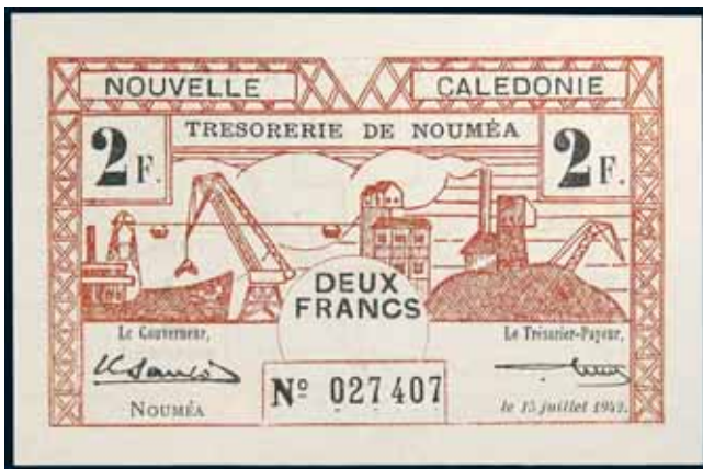
2037* New Caledonia , Trésorerie de Noumea, Bon de Caisse, emergency issue, Noumea, two francs, 15 July 1942, No. 027407 (P.53). Uncirculated.