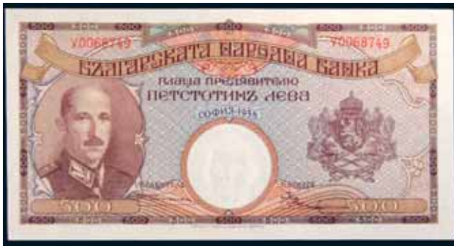
1963* Bulgaria , Banque Nationale de Bulgarie, five hundred leva, 1938, V0068749 (P.55a). Uncirculated. $100