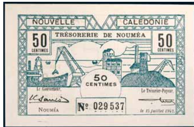
2035* New Caledonia , Trésorerie de Noumea, Bon de Caisse, emergency issue, Noumea, fifty centimes, 15 July 1942, No. 029 537 (P.51). Uncirculated. $60