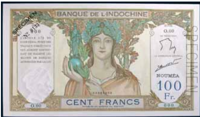
2030* New Caledonia , Banque de L'Indochine, specimen one hundred francs, undated (1963) O.00 000, SPECIMEN perforated at right, SPECIMEN No. 0133 stamped in black at top left (P.42es). Uncirculated. $400