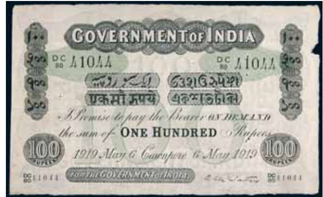
2003* India , Government of India, uniface one hundred rupees, Cawnpore, 6 May 1919, A.C.McWatters DC/80 41044 (P.A17f). Pin holes and small piece off upper right edge, otherwise good very fine and rare.