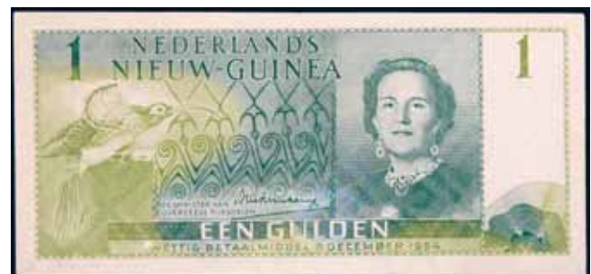
2028* Netherlands New Guinea , Dutch Administration, one gulden, 8 December 1954, AA 012491 and AK 012007 [illustrated] (P.11a). Nearly very fine; very fine. (2) $80