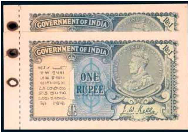
2006* India , George V, Government of India, one rupee, J.W.Kelly (1935) E/3 501068/9 (P.146) consecutive pair. Rusted holes in booklet margin, otherwise virtually uncirculated. (2) $750