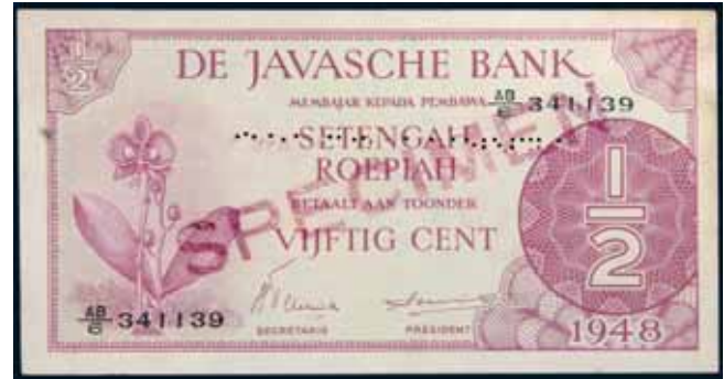
2025* Netherlands Indies , de Javasche Bank, specimen half gulden, 1948, AB/6 341139, cancel perforations near centre, SPECIMEN stamped diagonally in purple on front and back (P.97s). Marks on back and slight thin from being in an album, otherwise nearly uncirculated. $100