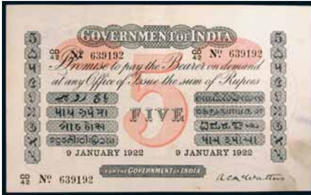
2000* India , Government of India, uniface five rupees, 9 January 1922, CD/42 No 639192 A.C.McWatters (P.P6h). Smudge areas lower right, otherwise nearly extremely fine.