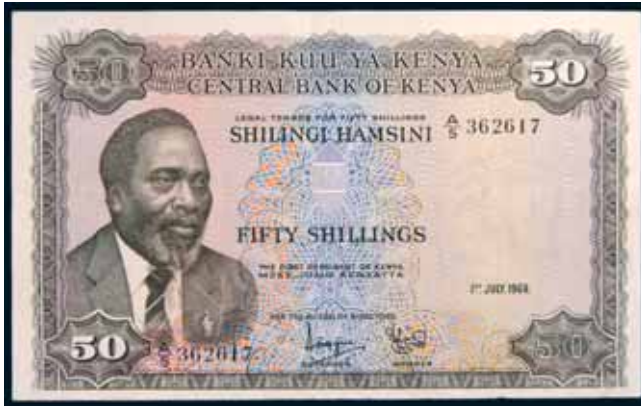
2020* Kenya , Central Bank of Kenya, fifty shillings, 1st July 1969, A/5 362617 (P.9a). Flattened of folds, good very fine. $200