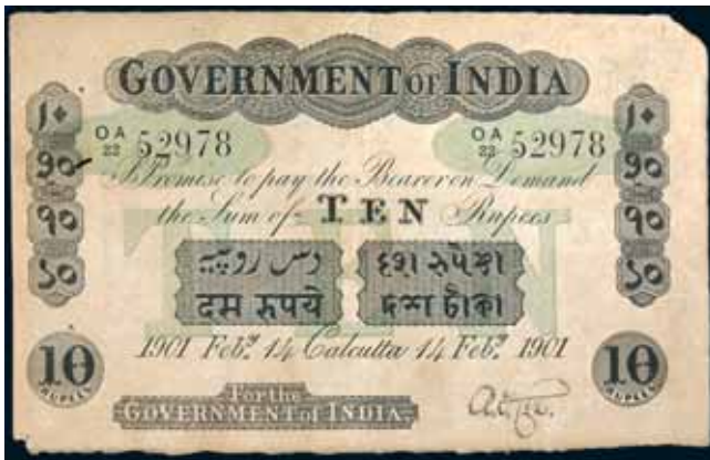
2001* India , Government of India, uniface ten rupees, Calcutta, 14 Feby. 1901 A.F.Cox, OA/22 52978 (P.A7h). Hole on left, top right corner tip off, otherwise very fine and rare.