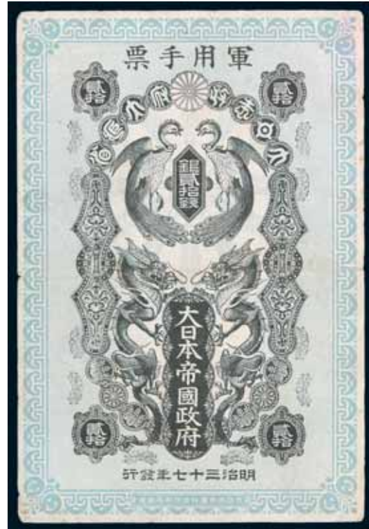
2017* Japan , Russo - Japanese War, twenty sen (1904) (P.M2a) blue, with serial number. Heavy horizontal fold with a 3mm split in right margin, otherwise good fine.