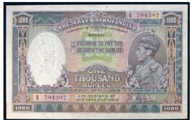
2011* India , Reserve Bank of India, George VI, one thousand rupees, Bombay (1938), A/3 794397 (P.21a; Jhun.4.8.1A). Closed spike-hole in watermark medallion, otherwise good very fine and rare. $7,500