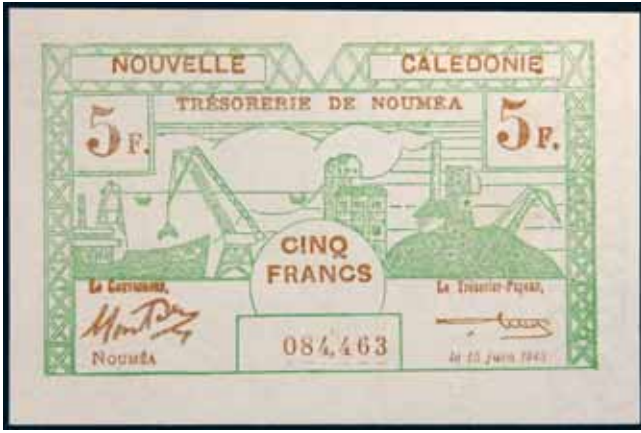
2041* New Caledonia , Tresorerie de Noumea, Bon de Caisse, emergency issue, Noumea, five francs, 15 Jun 1943, 084,463 (P.58). Uncirculated.