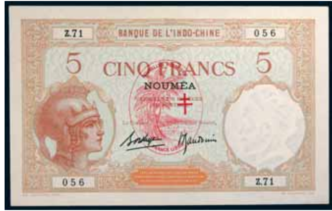
2045* New Hebrides , Banque de L'Indo-Chine, five francs, undated (1941) Z.71 056 (P.4b). Nearly uncirculated and rare thus.