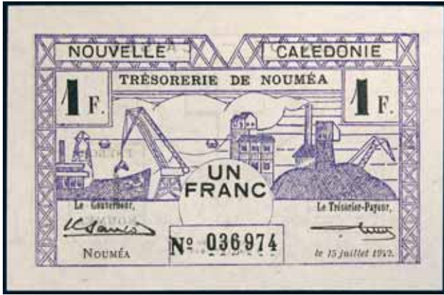
2036* New Caledonia , Trésorerie de Noumea, Bon de Caisse, emergency issue, Noumea, one franc, 15 July 1942, No. 036974 (P.52). Uncirculated.