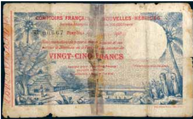
2044* New Hebrides , Comtoirs Francais des Nouvelles-Hebrides, twenty five francs, 22 August 1921, No. 00,667 (P.A1). Torn in half and repaired with tape, numerous pin holes and edge tears, fair but rare.