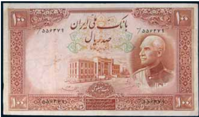
2015* Iran , Shah Reza, one hundred rials, AH1317, overprinted on back with purple date stamp AH1320 (1941) (P.36Ad). Small tear in area of watermark, otherwise good fine.