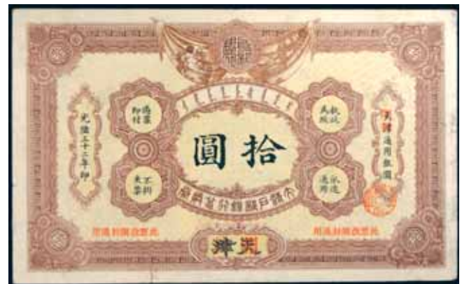
1969* China , Empire, The Ta Ching Government Bank, 1906 issue, Kaifong, ten dollars No 52816, unissued remainder (P.A71r). Tape repair, otherwise good very fine and rare. $2,000

In a PMG holder as choice uncirculated 63NET.