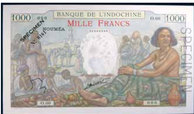
2032* New Caledonia , Banque de L'Indochine, specimen one thousand francs, undated (1963) O.00 000, SPECIMEN perforated at right, SPECIMEN No. 0161 stamped in black at top left (P.43ds). Virtually uncirculated. $500