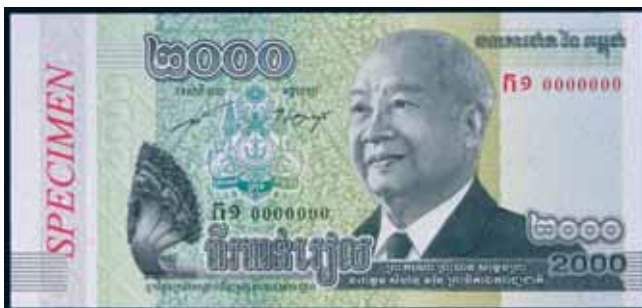
1965* Cambodia , specimen one and two thousand riels (2013-14), commemorating Sihanouk's funeral. Uncirculated. (2) $150