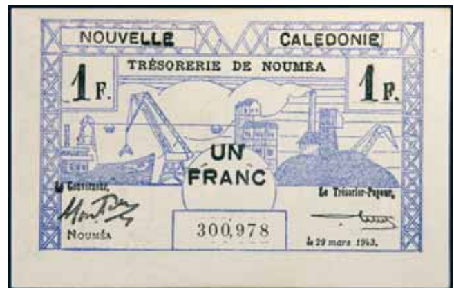
2039* New Caledonia , Trésorerie de Noumea, Bon de Caisse, emergency issue, Noumea, one franc, 29 March 1943, 110,479 and 300,978 (P.55a, b). Uncirculated. (2)