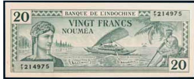
2033* New Caledonia , Banque de L'Indochine, twenty francs, undated (1944), F/T 214975 (P.49). Uncirculated. $100