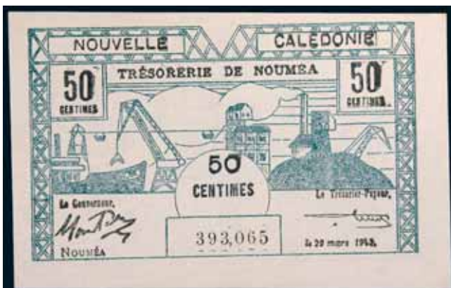
2038* New Caledonia , Trésorerie de Noumea, Bon de Caisse, emergency issue, Noumea, fifty centimes, 29 March 1943, 393,065 (P.54). Uncirculated.