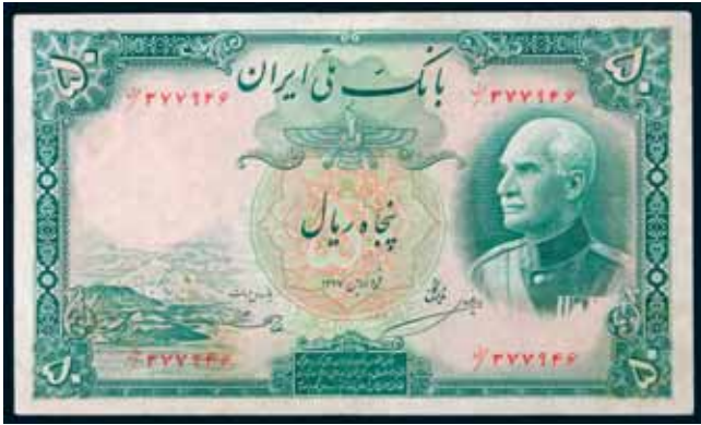
2014* Iran , Bank Melli Iran, Shah Reza, fifty rials, AH1317 (1938) red date stamp on back (date not visible) (P.35A). Minor staining, good very fine.