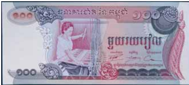
1964* Cambodia , one hundred riels, printer's proof, undated and no serial number (cf.P.15). Uncirculated. $200