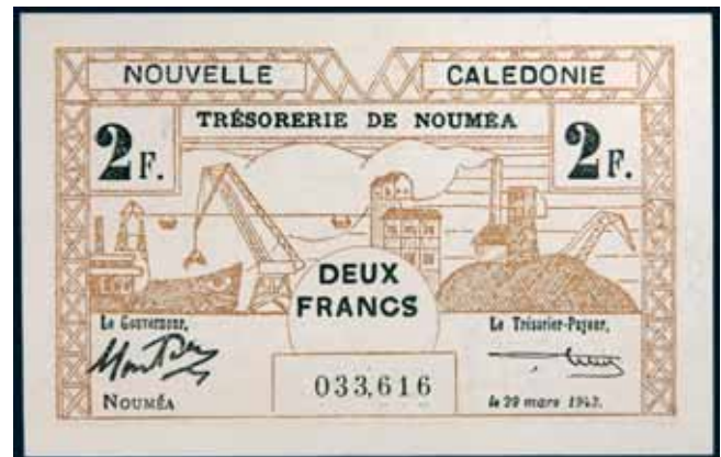
2040* New Caledonia , Trésorerie de Noumea, Bon de Caisse, emergency issue, Noumea, two francs, 29 March 1943, 033,616 (P.56). Virtually uncirculated.