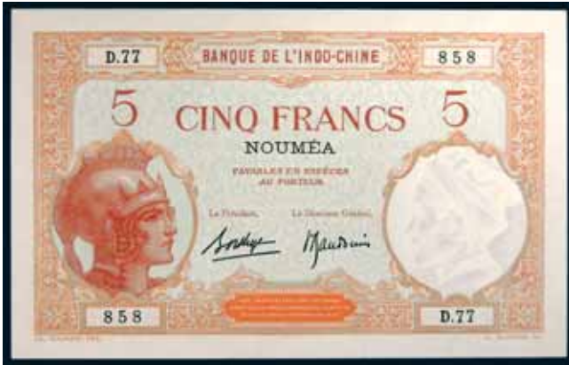
2029* New Caledonia , Banque de L'Indo-Chine, five francs, undated (c1926) D.77 858 (P.36b). Virtually uncirculated. $60