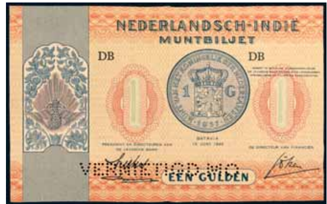
2026* Netherlands Indies , Government, specimen one gulden, 15 June 1940, prefix DB, no serial number, VERNIETIGD MO perforated at bottom (P.108bs). Centre fold, extremely fine. $100