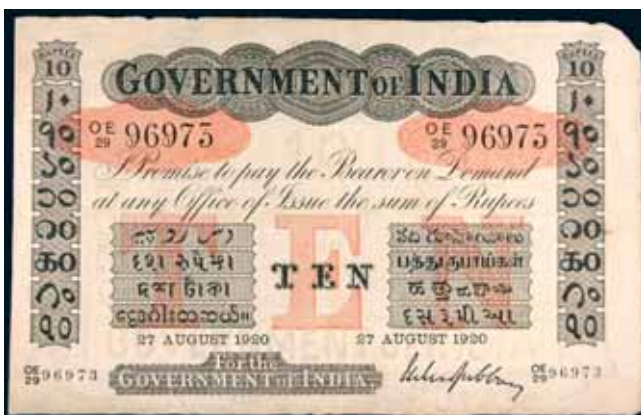
2002* India , Government of India, uniface ten rupees, 27 August 1920, Gubbay, OE/29 96973 (P.A10k). Good very fine.