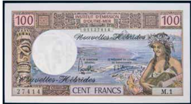
2046* New Hebrides , Institut d'Emission d'Outre-Mer, Nouvelles Hebrides, one hundred francs, undated (1975) M.1/27414 (P.18c). Uncirculated.