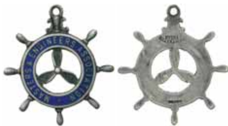
lot 865 part