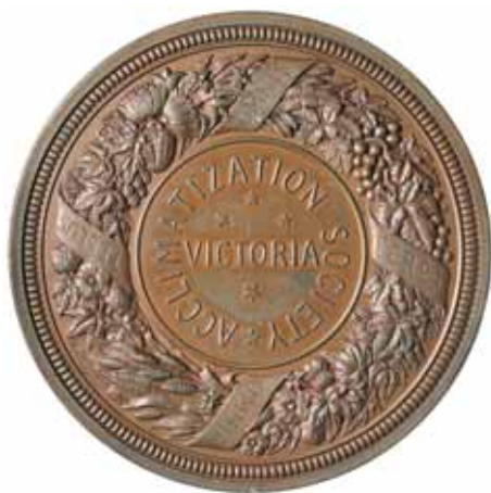
lot 822 reverse