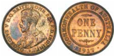
1016* George V , 1917I. Obverse wiped, reverse with original mint red, nearly extremely fine/good extremely fine. $200