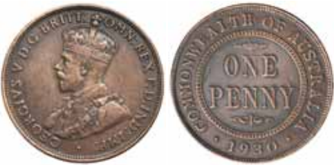
1023* George V , 1930 Indian die. Six pearls, reverse rim uneven at 10 o'clock, otherwise nearly very fine/very fine and rare. $15,000