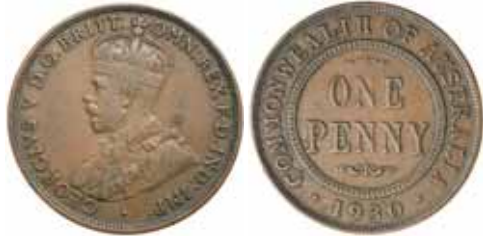
1024* George V , 1930 Indian die. Six pearls, brown patina, good fine and rare. $15,000