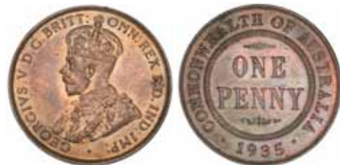
1025* George V , 1935. Underlying brilliance, light red brown, nearly uncirculated. $100

Ex K. Carlton (Pharmacist) Collection, private purchase from customer for $200 in 1963 and Noble Numismatics Sale 107 (lot 1570).