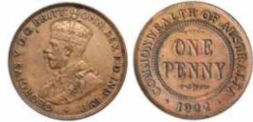
1017* George V , 1917I, 1918I, 1919 dot below, 1920 plain, Indian obverse die, 1921 Indian die, 1922 Indian die, 1923 London die. Very fine - good extremely fine. (7) $300