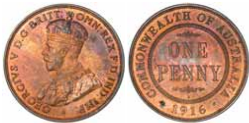
1015* George V , 1916I. Toned, underlying mint red, carbon spot to left of date, otherwise nearly specimen-like uncirculated. $500