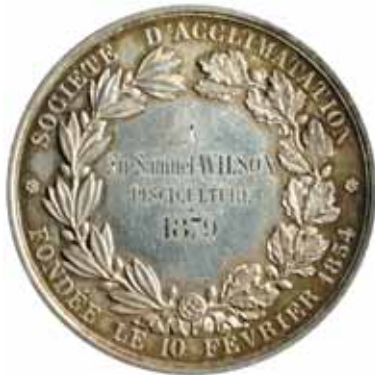
lot 829 reverse