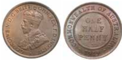
1037* George V, 1919. Attractive glossy blue brown with traces of red, nearly uncirculated.