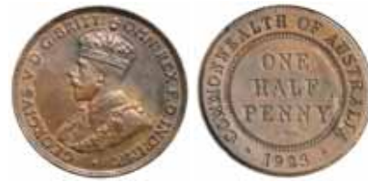
1039* George V, 1923. Peripheral die breaks both sides, metal flaw beside Y, eight pearls, toned, otherwise extremely fine and rare in this condition.