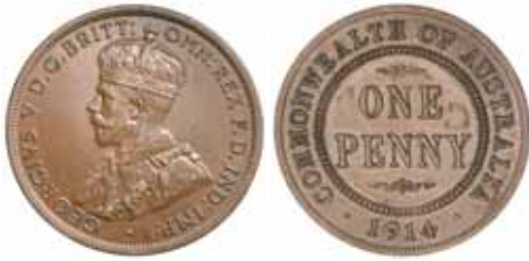
1013* George V , 1914. Glossy brown, good extremely fine. $150