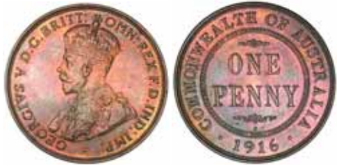
1014* George V , 1916I. Brown and red, uncirculated. $750