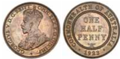
1038* George V, 1923. Diagnostic die breaks both sides, four Xs scratched into the quarter points of the inner circle, otherwise brown and red, uncirculated and but for the Xs, would have been the finest we have handled.