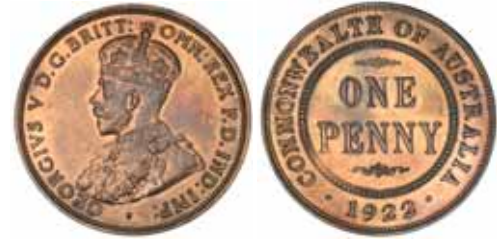
1018* George V , 1922 London die. Good extremely fine, the first toned. (2) $100