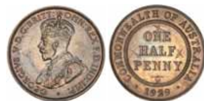
1042* George V, 1929. Four Xs scratched into the quarter points of the inner circle, otherwise brown and red, nearly uncirculated.