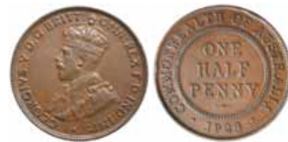
1040* George V, 1923. Faint traces of peripheral die break on reverse, chocolate brown patina, nearly very fine and rare thus.

The graffiti was done in all probability as acknowledgement of the Castlemaine Brewery Company adopting the (four) XXXX brand in 1924.