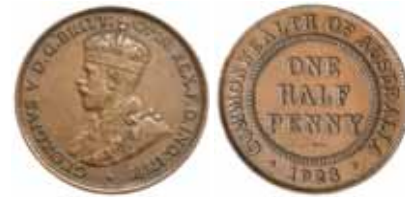
1041* George V, 1923. Eight pearls, trace of peripheral die break at top of LIA, brown patina, good very fine and rare in this condition.