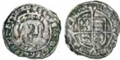
1887* Henry VIII , (1509-1547), silver groat, facing bust issue, third coinage, no mm, issued 1544-1547, Canterbury Mint, with portrait of Henry VIII three quarter right, second bust, plain in forks, rev. CIVITAS CAN TOR, (S.2373, N.1847). Light grey tone with uneven dark spots, weak in places, otherwise good fine and scarce.