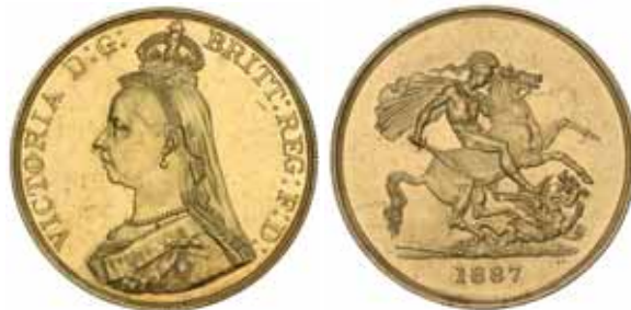
1811* Queen Victoria , Jubilee coinage, five pounds, 1887 (S.3864). Nearly uncirculated. $4,000