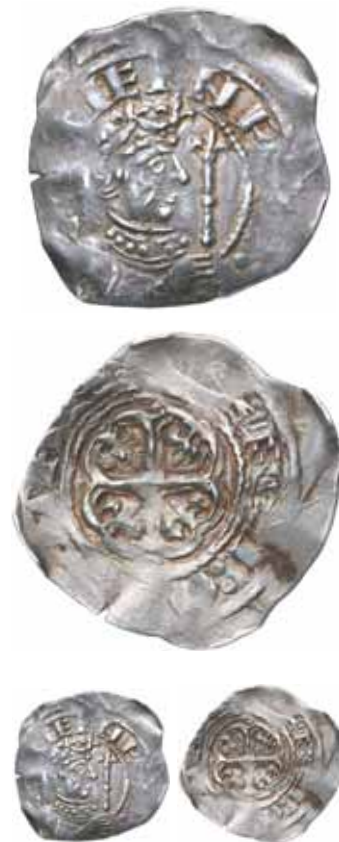
1846* Stephen , (1135-1154) penny, cross moline or 'Watford' type (BMC.1), Stamford, (ST) IEFNE RE : (L) EFSIO : O (N : S) TANE (S.1278). Old cabinet tone, excellent portrait for this, good very fine with usual weak area, rare mint.