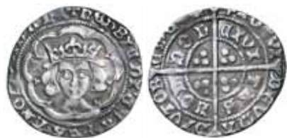
1878* Henry VI , (restored, Oct.1470-Apr.1471) groat, London, mm cross (S.2082). Toned, very fine.