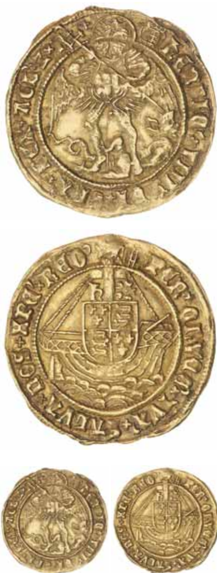
1802* Henry VIII , (1509-1547) first coinage, 1509-26, angel, mm crowned portcullis (S.2265). Full flan, good very fine. $2,000