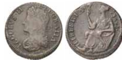
2013* Ireland , James II, Limerick besieged, 1690-1, farthing 1691, struck over small Gunmoney shilling (S.6595). Dark brown patina, nearly very fine and scarce.