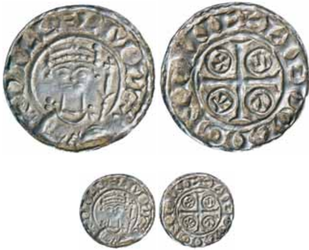
1843* William I , (1066-1087) penny, PAXS type (BMC.8), Winchester, LIFPOLD ON PINC (S.1257). Light grey brown tone, very fine.