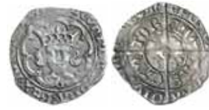
1879* Edward IV , (second reign, 1471-1483) halfgroat, Canterbury, mm rose, C on breast and in centre of reverse (S.2107). Toned, good very fine.