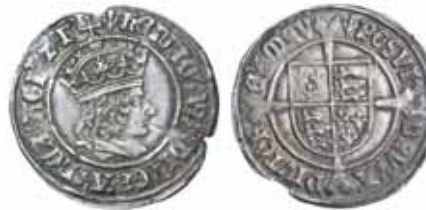
1883* Henry VII , (1485-1509) profile issue, groat, tentative issue, mm cross crosslet 1504-5 (S.2254). Good very fine and rare.