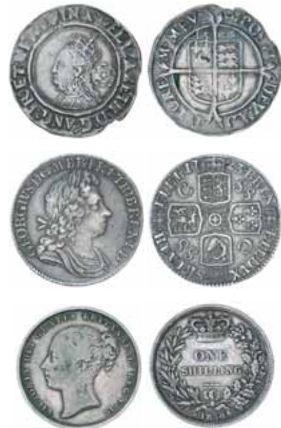
1893* Elizabeth I , (1558-1603), third and fourth issue, sixpence, 1569, mm coronet (S.2562); George I, shilling, 1723SSC (S.3647); Queen Victoria, young head, shilling, 1856 (S.3904). Fine - very fine. (3)