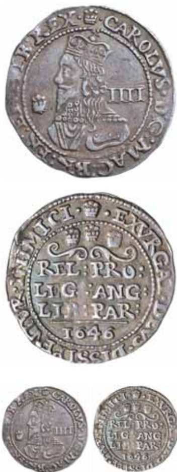
1901* Charles I , (1625-1649) Bridgnorth-on-Severn, groat, 1646, mm plumlet (S.3042). Attractively toned, good very fine and rare.