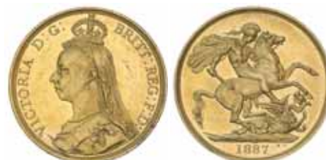
1813* Queen Victoria , Jubilee coinage, two pounds, 1887 (S.3865). Surface marks on obverse, otherwise nearly uncirculated. $1,000