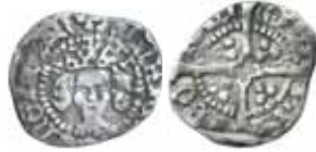
1875* Henry V , (1413-1422), penny, York, class F, mullet and trefoil by crown, local dies (S.1788). Toned, good fine.