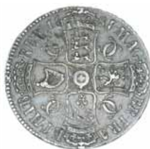
1910* Charles II , crown, fourth bust, 1681 (S.3359). Toned, very fine.