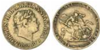
1806* George III , new coinage, sovereign, 1820 (S.3785C). Nearly fine/fine. $500