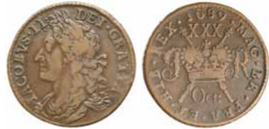
2012* Ireland , James II, Gunmoney, halfcrown, Oct:1689 (S.6579E). Even wear and patina, nearly very fine.