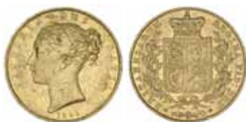
1808* Queen Victoria , young head sovereign, shield reverse, 1844 (S.3852). Nearly very fine. $350