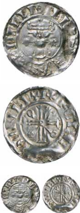
1844* William II , (1087-1100) penny, voided cross type, Lincoln, FOLCIER ON LI (S.1260). Heavy spade mark on right, otherwise toned very fine and rare.