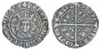
1876* Henry VI , (first reign, 1422-1461) annulet issue, (1422-30) halfgroat, Calais (S.1840). Toned, very fine.