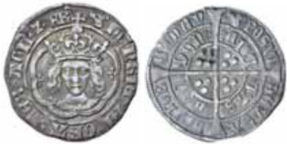
1882* Henry VII , (1485-1509) facing bust, groat, London, 111c, mm greyhound 1502-4 (S.2199). Toned, inked No 25 on reverse, otherwise good very fine.