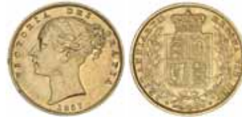
1810* Queen Victoria , young head sovereign, shield reverse, 1857 (S.3852D). Good very fine. $380