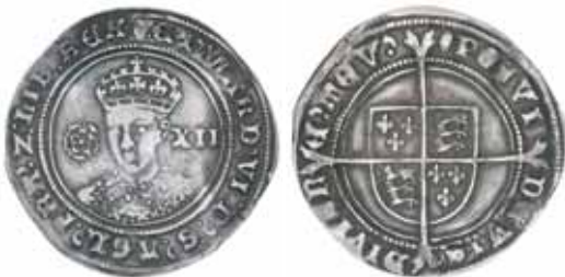
1888* Edward VI , (1547-1553) fine silver issue, 1551-3, shilling, mm tun (S.2482). Good portrait, toned, nearly very fine.