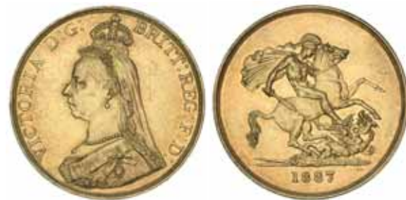
1812* Queen Victoria , Jubilee coinage, five pounds, 1887 (S.3864). Hairline scratches behind head, other minor marks, otherwise extremely fine. $3,200