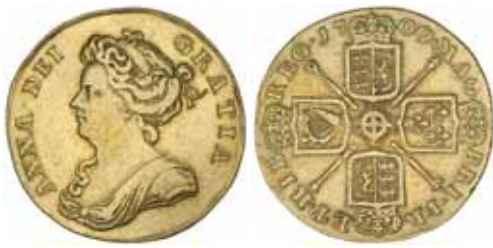
1804* Anne , after the Union, two guineas, 1709 (S.3569). Very fine. $4,500