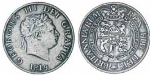
1940* George III , new coinage, halfcrown, small head, 1819/8, overdate Spink notes as extremely rare, (S.3789, ESC -). Cleaned, surface scratches, otherwise fine and extremely rare.