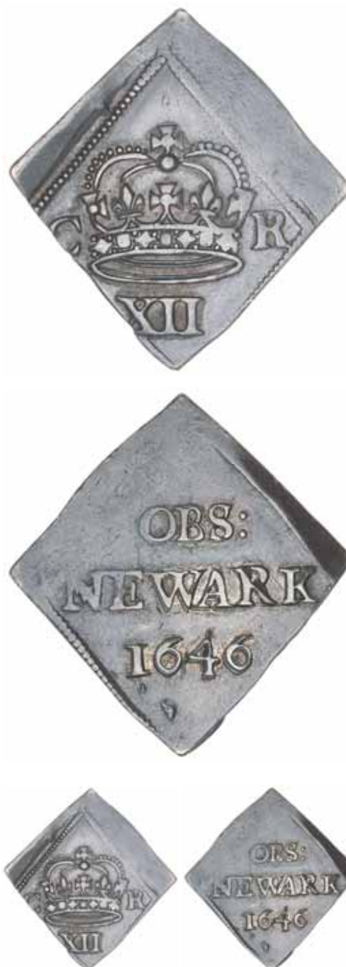
1902* Charles I , (1625-1649) Newark, besieged, 1645-6; shilling, 1646 (S.3143). Uneven strike on one side, otherwise dark grey toned, good very fine.