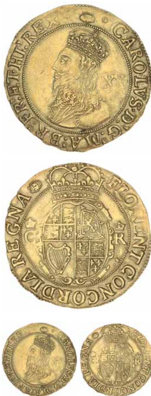
1803* Charles I , (1625-49) Tower Mint under the King, unite, group D, fourth bust, bust 5, mm tun, unjewelled crown (S.2692). Good very fine with a good portrait. $3,000

Ex C.S.Shute Collection, private purchase from Lloyd Bennett in May 1986 with ticket, ex Format 19/3/64 £32.10.0.