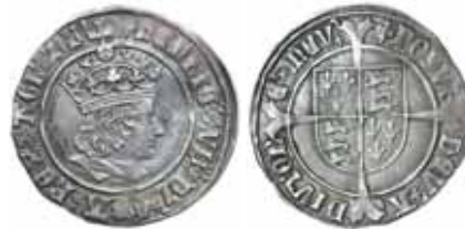
1884* Henry VII , (1485-1509) profile issue, groat, London, mm cross crosslet 1504-5 (S.2258). Toned, good very fine.