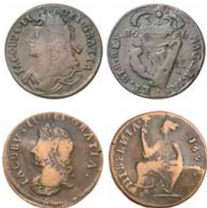
2011* Ireland , James II, regular coinage, halfpenny, 1686 (S.6576); Limerick besieged, 1690-1, halfpenny 1691, struck over large Gunmoney shilling (S.6594). Dark brown patina, nearly very fine; light brown brass patina, good fine. (2)