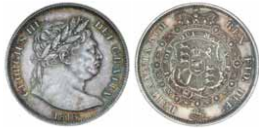
1939* George III , new coinage, large or 'bull' head halfcrown, 1816 (S.3788). Deeply toned within lettering and devices, nearly uncirculated and rare in this condition.