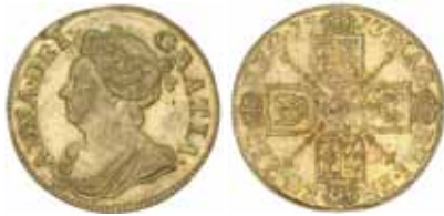
1805* Anne , after the Union, third bust, guinea, 1713 (S.3574). Subdued mint bloom, good very fine. $1,500