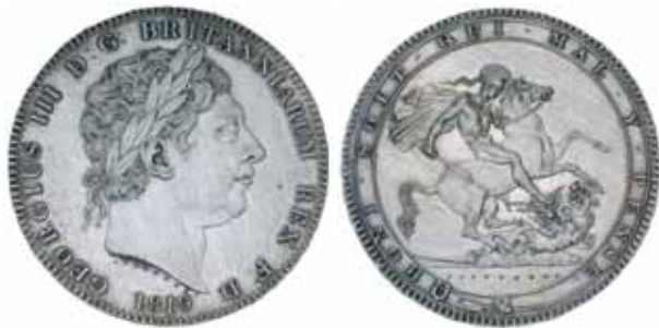
1937* George III , new coinage, crown, 1819 LIX (S.3787). Brushed to clean off toning otherwise extremely fine.