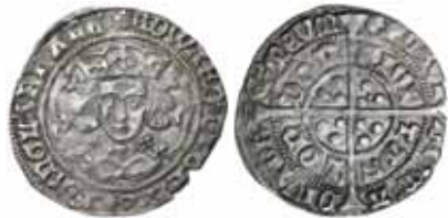
1877* Edward IV , (first reign, 1461-1470) light coinage, 1464-70, groat, London, quarterfoils by neck, mm rose (S.2000). Dark brown tone, slightly chipped edge, otherwise good very fine.