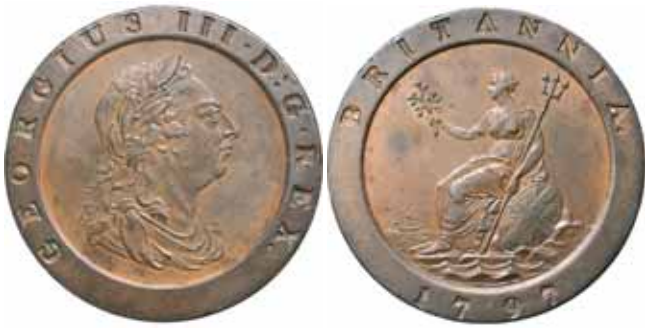
1935* George III , cartwheel twopence, 1797 (S.3776). Good very fine.