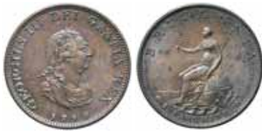
1936* George III , farthing, 1799, three berries in wreath (S.3779). Dark brown patina, minor spotting on reverse, extremely fine.