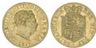
1807* George III , new coinage, half sovereign, 1817 (S.3786). Good fine/nearly very fine. $350