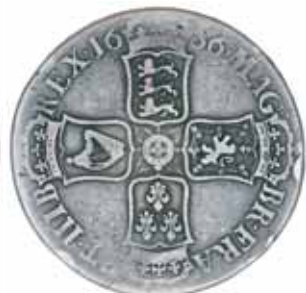
1909* Charles II , second bust, crown, 1667, AN:REG: on edge (S.3317). Very good.