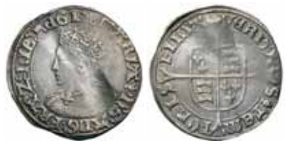
1889* Mary , (1553-1554) groat, mm pomegranate (S.2492). Creased, otherwise good fine.