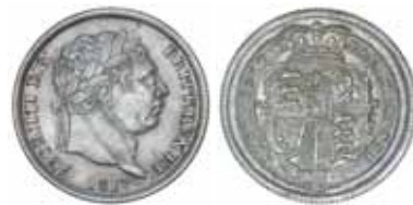
1941* George III , new coinage, shilling, laureate head, 1817 (S.3790). Good extremely fine.