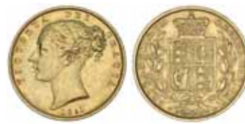
1809* Queen Victoria , young head sovereign, shield reverse, 1851 (S.3852C). Very fine. $350