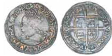
1890* Philip and Mary , (1554-1558), silver groat, not dated c1554, mm lis, (S.2508, N.1973). Dark grey with blue and gold highlights, slight evidence of bending, very fine, rare as such.