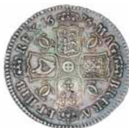
1911* Charles II , fourth bust, halfcrown, 1676 (S.3367). Toned, good fine.