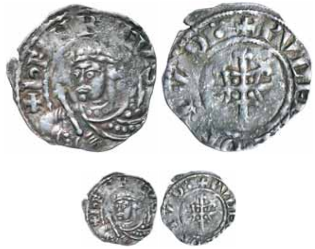
1845* Henry I , (1100-1135) penny, quadrilateral on cross fleury type (BMC.15), London, PVLV (RIC) ON LVND (S.1276). Toned, nearly very fine with good portrait, rare thus.