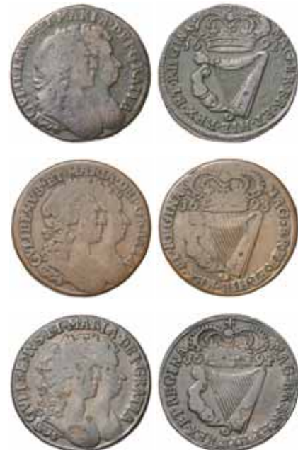
2014* Ireland , William and Mary, halfpennies, 1692, 1693 and 1694 (S.6597). The second with smooth light brown patina, others with dark brown patinas, very good - good fine. (3)