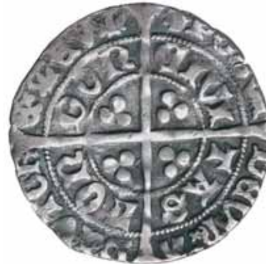
1880* Richard III , (1483-1485) groat, London, mm sun and rose 3 (S.2157). Good portrait, nearly very fine and rare.