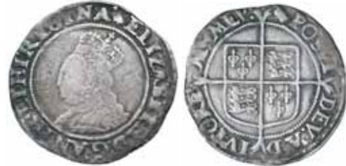
1891* Elizabeth I , (1558-1603) second issue, 1560-1, shilling, bust 3B, mm martlet (S.2555). Good fine.