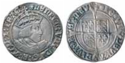
1886* Henry VIII , (1509-1547) second coinage, 1526-44, groat, mm rose (S.2337A). Nearly very fine.