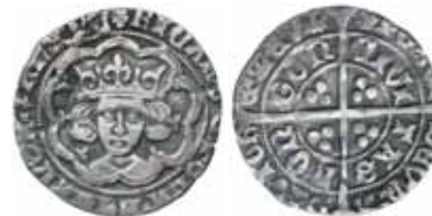
1881* Henry VII , (1485-1507) facing bust issue, groat, London, mm pansy, 1495-8, both arches jewelled, class 111b (S.2198A). Good very fine.