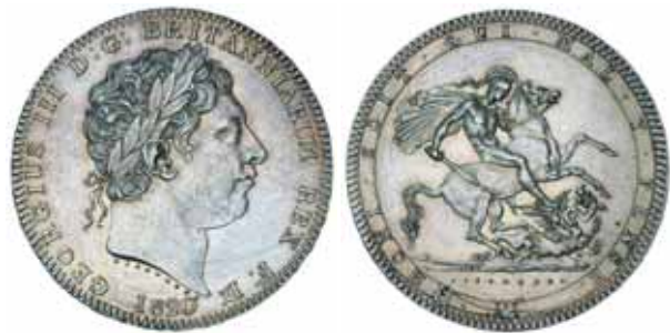
1938* George III , new coinage, crown, 1820 LX (S.3787). Obverse hairline, otherwise extremely fine.