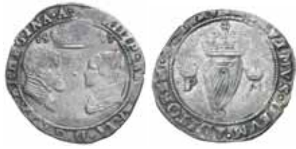
2009* Ireland , Philip and Mary, groat, 1557 (S.6501B). Very fine for this.