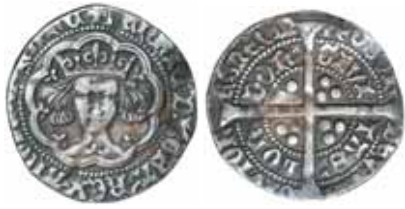
1874* Henry V , (1413-1422) groat, type G, mm pierced cross (S.1767). Toned, nearly very fine.