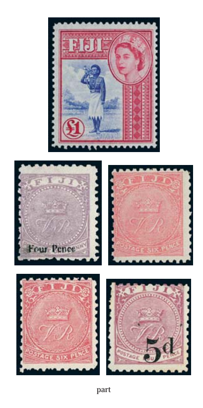
Fiji , a small collection housed on two Hagner sheets with C R and V R types, including 5d on 4d surcharge (illustrated) and native canoe (25) mostly mint and different, Edward VII 1/-, others (4); KGV various issue to 1/-; KGVI and QEII to one pound (illustrated). (MUH, mint, used [2]). (54)