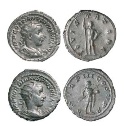
lot 3378 part