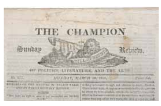
lot 3738 part

Since Byron only started signing his name as Noel Byron sometime in 1822 then this style of signature was only used for a relatively short period of about two years and hence must be considered extremely scarce.