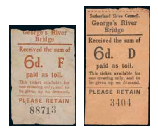
George's River Bridge, NSW, toll tickets, sixpence 'D' black print (3404); another sixpence, 'F' red print (88713). Fine and rare. (2) $100