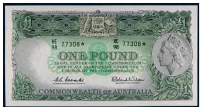
4454* One pound , Coombs/Wilson (1961) HE/98 77308* (R.34bs). Flattened, medium body to paper, nearly uncirculated and rare in this condition.