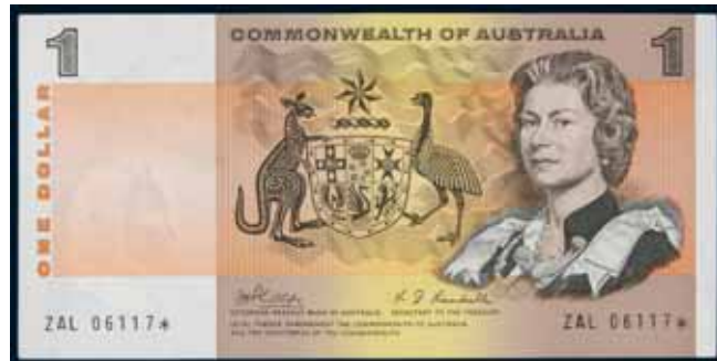
4460* One dollar , Phillips/Randall (1969) ZAL 06117* (R.73s). Lightest centre fold, otherwise crisp, nearly uncirculated. $800