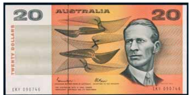
4472* Twenty dollars , Johnston/Fraser (1985) EKY 090746 (R.409b) gothic serials with gold security strip. Uncirculated and very rare. $1,000