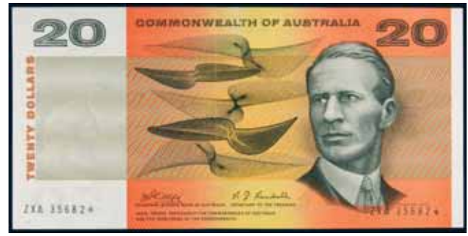
4469* Twenty dollars , Phillips/Randall (1968) ZXA 35682* (R.403s). Flattened of centre fold, good extremely fine. $3,000