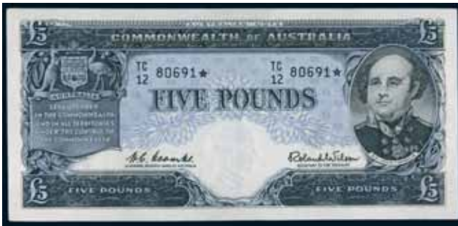
4456* Five pounds , Coombs/Wilson (1960) TC/12 80691* (R.50s). Flattened of centre fold, medium body to paper; otherwise good extremely fine and very rare in this condition. $25,000