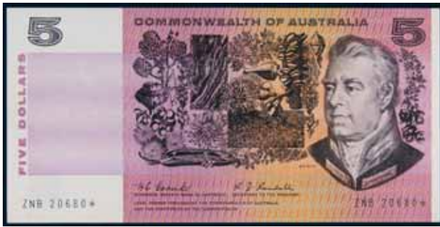
4464* Five dollars , Coombs/Randall (1967) ZNB 20680* (R.202s). Flattened of centre fold, good extremely fine. $2,000