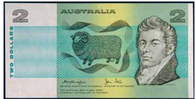
4470* Two dollars , Knight/Stone (1979) (R.87) missing prefix and serial numbers. Good fine. $300