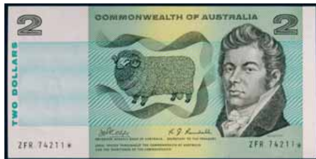
4461* Two dollars , Phillips/Randall (1968) ZFR 74211* (R.83s). Flattened, extremely fine. $850