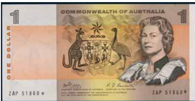
4459* One dollar , Phillips/Randall (1969) ZAP 51860* (R.73s). Uncirculated. $2,000