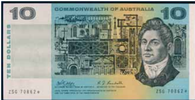
4467* Ten dollars , Phillips/Randall (1968) ZSG 70862* (R.303s). Flattened, extremely fine. $750