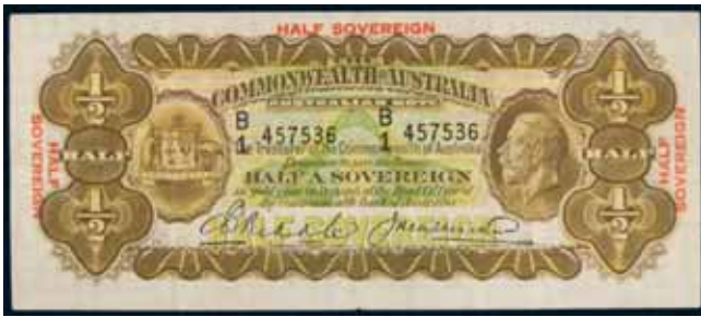
4281* Ten shillings , Riddle/Heathershaw (1928) B/1 457536 (R.7). Flattened of folds, otherwise good colour, central pin hole, nearly very fine.