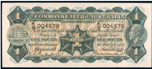
4334* One pound , Riddle/Heathershaw (1927) K/9 004578 (R.26). Crisp original body, extremely fine or better. $1,000