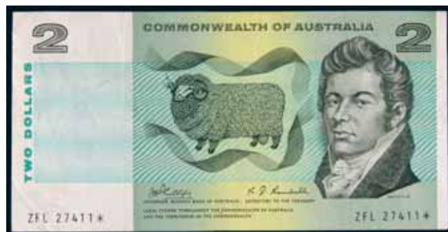
4462* Two dollars , Phillips/Randall (1968) ZFL 27411* (R.83s). Very fine. $500