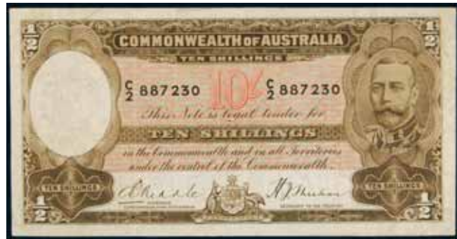
4285* Ten shillings , Riddle/Sheehan (1933) C/2 887230 (R.9). Flattened, good fine.