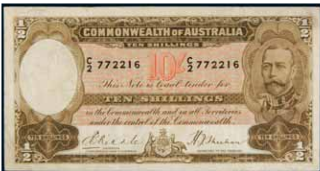
4284* Ten shillings , Riddle/Sheehan (1933) C/2 772216 (R.9). Original body, good fine.