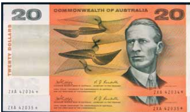
4468* Twenty dollars , Phillips/Randall (1968) ZXA 42034*/5* (R.403s) consecutive pair. Flattened of lightest fold and creases, nearly uncirculated and very rare as such. (2) $25,000