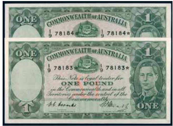
4452* One pound , Coombs/Watt (1949) I/9 78183*/4* (R.31s) consecutive pair. Flattened of left hand side crease, extremely fine or better and very rare as such, one of the finest pairs known. (2)