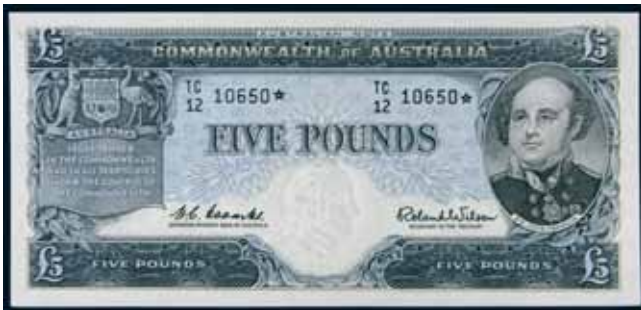
4457* Five pounds , Coombs/Wilson (1960) TC/12 10650* (R.50s). Flattened, otherwise nearly extremely fine and rare in this condition. $6,000