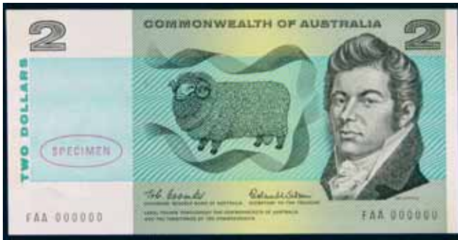
4449* Two dollars , Coombs/Wilson (1966) type one specimen note FAA 000000 (R.SP02; McD.DS2). Uncirculated and very rare.