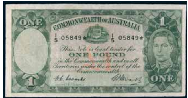
4453* One pound , Coombs/Watt (1949) I/5 05849* (R.21s). Trimmed, flattened of folds and creases, very good.