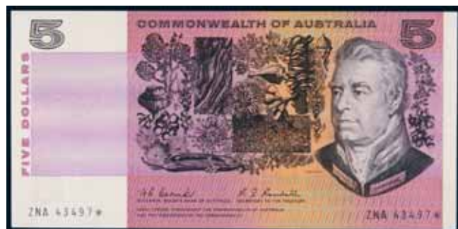
4463* Five dollars , Coombs/Randall (1967) ZNA 43497* (R.202s) first serial prefix star replacement note. Nearly uncirculated and rare. $7,000