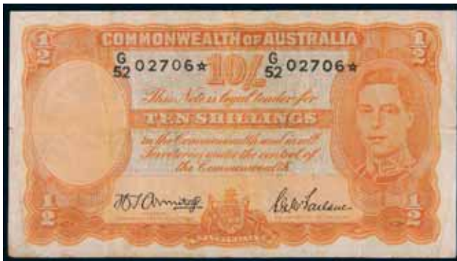
4450* Ten shillings , Armitage/McFarlane (1942) G/52 02706* (R.13). Quarter folds, very good and rare.