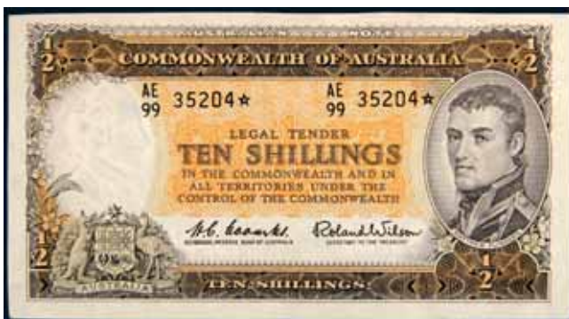
4451* Ten shillings , Coombs/Wilson (1961) AE/99 35204* (R.17s). Light folds and creases from handling, top edge cut close in during production, otherwise crisp and original, nearly uncirculated and rare in this condition.