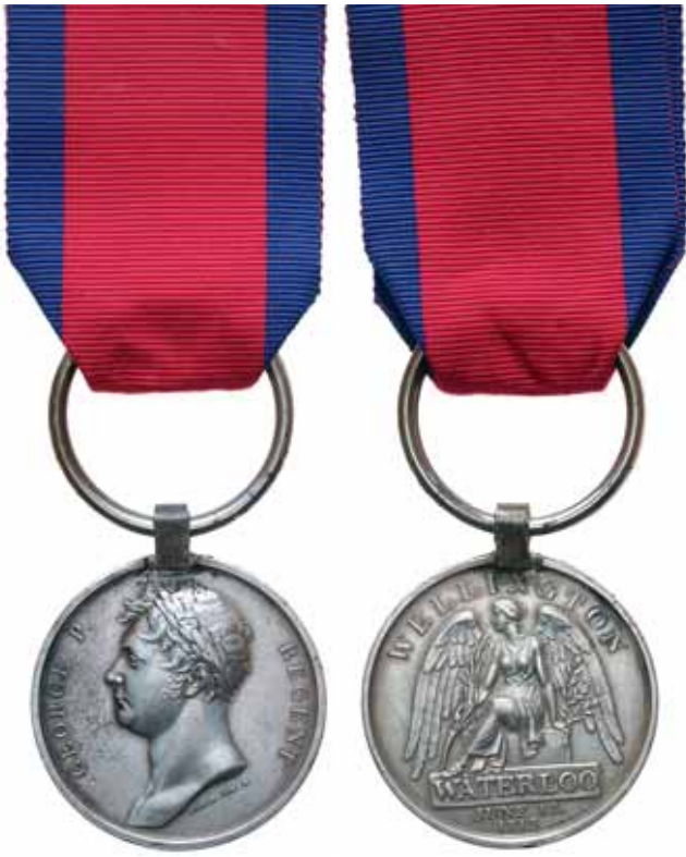
3400* Waterloo Medal 1815. Frederick Gilbert, 3rd Line Batt. K.G.L. Impressed. Suspension repaired, very fine. $1,000

Cannot locate on medal roll but naming appears to be genuine and unaltered.