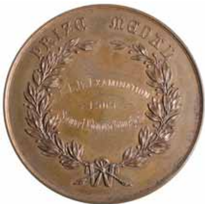
lot 3498 part