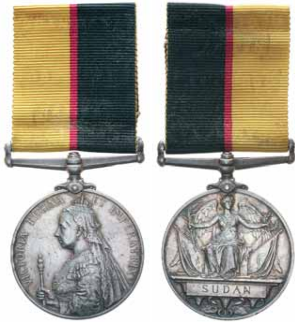
3414* Queen's Sudan Medal 1899. 2636-9 in Arabic numerals. Impressed. Contact marks and edge ripple where impressed, otherwise very fine.