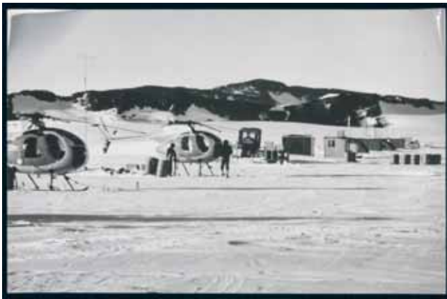
Mount King, Enderby Land, AAT