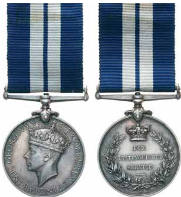
3394* Distinguished Service Medal (GVIR Indiae Imp). LT/KX.106291 P.Bradley. Sto. R.N.P.S. Impressed. Nearly extremely fine.

See lot 3424 to same name but unknown if related.