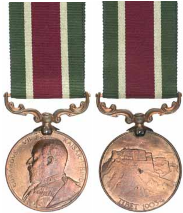
3418* Tibet Medal 1905, in bronze. 521 Mute Sum Sher S & T Corps. Engraved. Extremely fine.