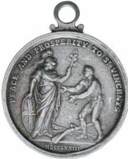
3397* Carib War Medal, 1773, George III, in silver (54mm) cast and chased as issued with loop suspension. Good very fine and very rare.