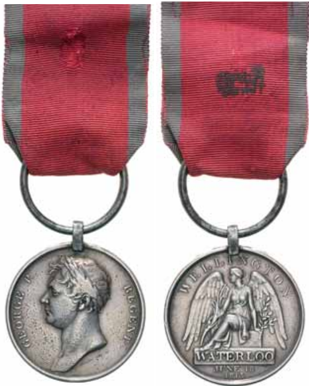
3401* Waterloo Medal 1815, John Pasket 1st Batt 95th Regt Foot. Impressed. Fitted with steel clip and ring suspension, contact marks in field, fine. $4,750

Cannot locate on medal roll but naming appears to be genuine and unaltered.