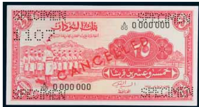
2699* Sudan , Bank of Sudan, specimen twenty five piastres, 25.1.1967 (P.6b) A/00 0 000000, diagonal overprint CANCELLED in red on front and back, punch hole SPECIMEN in each corner and number 1107 below left corner SPECIMEN. Uncirculated.