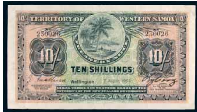
2657* Samoa , Territory of Western Samoa, ten shillings, Wellington, 7 August 1958, 230026 (P.7c). Creases and folds but still crisp, fine.