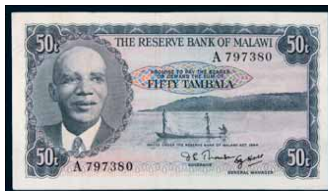
2634* Malawi , The Reserve Bank of Malawi, fifty tambala, (1971), A 797380 (P.5). Very fine and scarce. $70