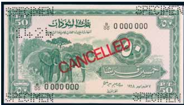
2701* Sudan , Bank of Sudan, specimen fifty piastres, 7.2.1968 (P.7c) B/00 0 000000, diagonal overprint CANCELLED in red on front and back, punch hole SPECIMEN in each corner and number 1424 below left corner SPECIMEN. Uncirculated.