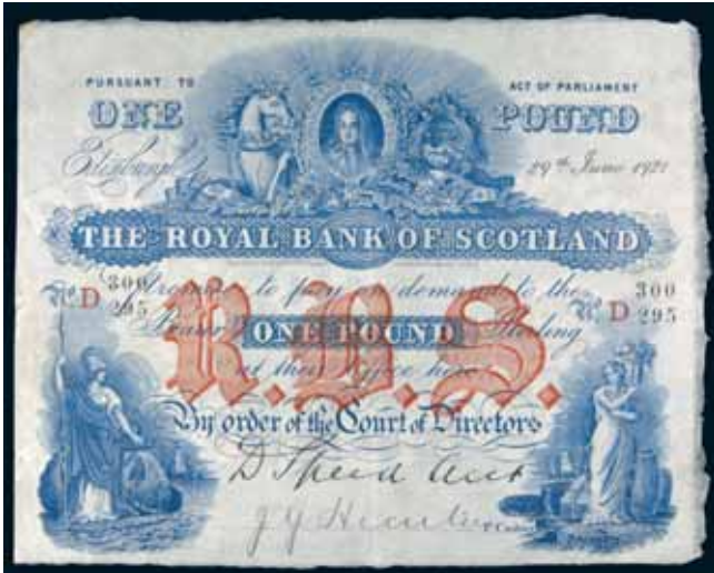
2663* Scotland , The Royal Bank of Scotland, one pound, 29th June 1921, D300/295 (P.316e; D.46e). Good very fine and scarce.