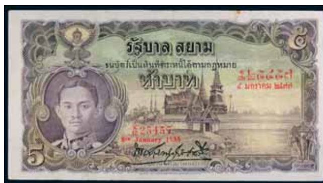
2706* Thailand , five baht, 8th January 1935, K/12 25457, imprint Thomas de la Rue & Company Limited London (P.23). Good fine and scarce.