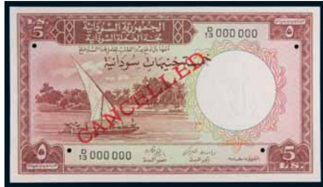
2698* Sudan , Sudan Currency Board, specimen five pounds, 15.9.1956 (P.4) D/13 000000, diagonal overprint CANCELLED in red on front and back, one punch hole cancelled in each corner. Uncirculated.