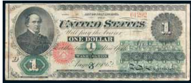
2712* USA , Legal Tender Notes, 1862 Series, one dollar, August 1st 1862, 61292 (P.128). Small paper split at right edge, light foxing, limp, otherwise fine and scarce. $220