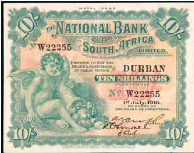
2689* South Africa , The National Bank of South Africa Limited, Natal issue, ten shillings, Durban, 1st July, 1916, No.W22255 (P.S491, Orange Free State). Quarter folds, otherwise crisp, nearly extremely fine and rare.