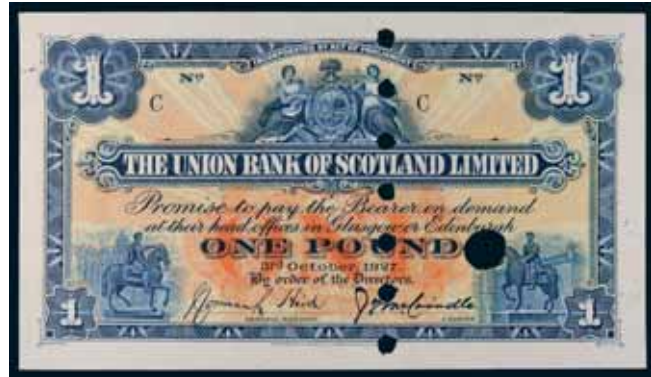
2666* Scotland , The Union Bank of Scotland Limited, specimen one pound, 3rd October, 1927 (P.S815as) no serial number, imprint of Waterlow & Sons Ld London Wall, London, punch hole cancelled in vertical line and one large single punch hole. A few folds and light creasing, therefore very fine.