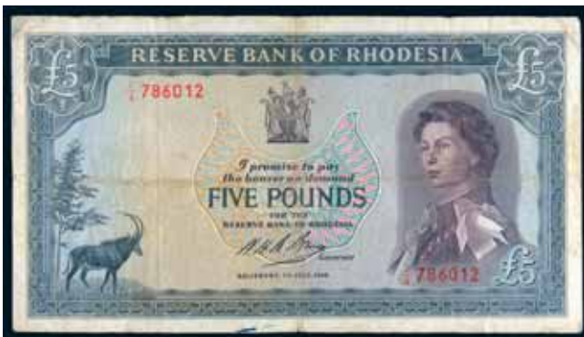
2655* Rhodesia , Reserve Bank of Rhodesia, Elizabeth II, five pounds, Salisbury, 1st July 1966 (P.29a). Good fine.