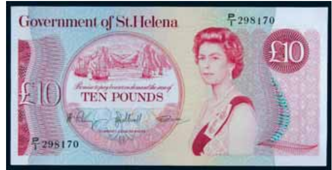
2692* St Helena , Government of St. Helena, ten pounds, undated (1985)(P.8b). Uncirculated.