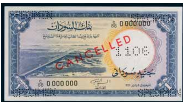
2703* Sudan , Bank of Sudan, specimen one pound, 20.1.1966 (P.8c) C/00 0 000000, diagonal overprint CANCELLED in red on front and back, punch hole SPECIMEN in each corner and number 1106 in watermark area. Uncirculated.