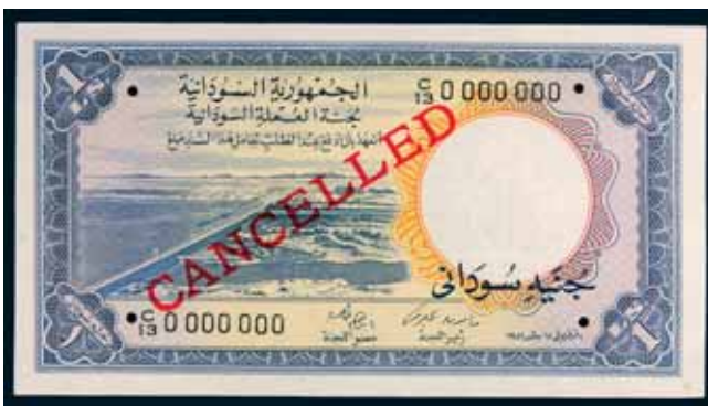
2697* Sudan , Sudan Currency Board, specimen one pound, 15.9.1956 (P.2Bs) C/13 0 000000, diagonal overprint CANCELLED in red on front and back, one punch hole cancelled in each corner. Uncirculated.