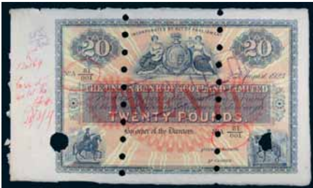
2665* Scotland , The Union Bank of Scotland, twenty pounds, printer's proof, Glasgow or Edinburgh, 2nd August 1923, No.A 51/001, fully printed front and back, printer's notation in red, left margin 'Correct as 1st No 28/3/27', serial numbers ringed in red, CANCELLED in purple stamped front and back with punch hole cancellations (cfP.S813a; D.39b-1). Paper remnants on back left edge, otherwise extremely fine.