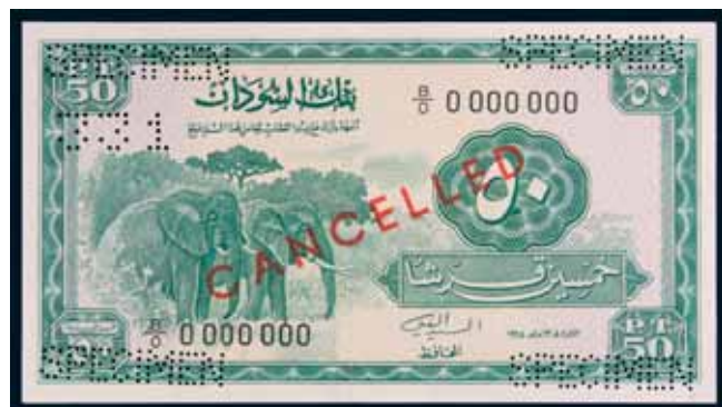
2700* Sudan , Bank of Sudan, specimen fifty piastres, 6.3.1964 (P.7a) B/0 0 000000, diagonal overprint CANCELLED in red on front and back, punch hole SPECIMEN in each corner and number 331 below left corner SPECIMEN. Uncirculated.