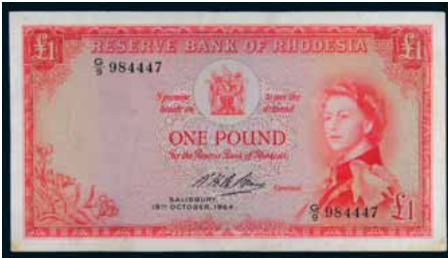
2654* Rhodesia , Reserve Bank of Rhodesia, Elizabeth II, one pound, Salisbury, 19th October 1964, G/9 984447 (P.25a). Very fine.