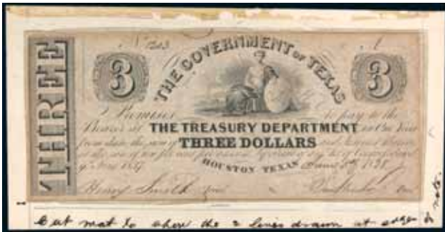
2709* USA , Texas, Republic, third issue, three dollars, June 1st 1838, No 1203 (P.17). Stuck down on card, otherwise good fine. $300

In an old frame with newspaper cutting about signatory Henry Smith stuck on the back, partly torn.