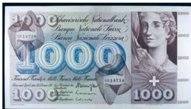
2705* Switzerland , Schweizerische Nationalbank, one thousand francs, Bern and Zurich, 10 Februar 1971, 5D14734 (P.52j). Bright, crisp note, flattened of centre fold, good extremely fine.