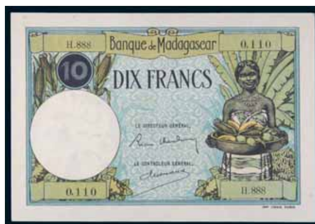
2633* Madagascar , Banque de Madagascar, ten francs, (1937), H.888 0,110, signature 2 (P.36); five francs (1937), same signatures, 170N.3241 81012170 (P.35). Nearly uncirculated, the first with two pin holes. (2) $120