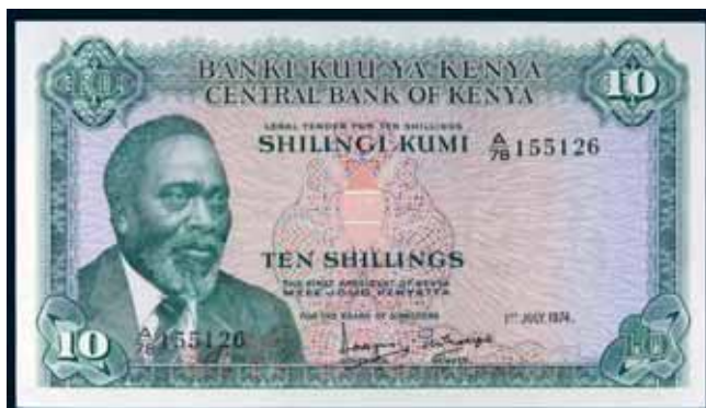
2627* Kenya , Central Bank of Kenya, ten shillings, 1st July 1974, A/78 155126 (P.7e). Uncirculated. $90