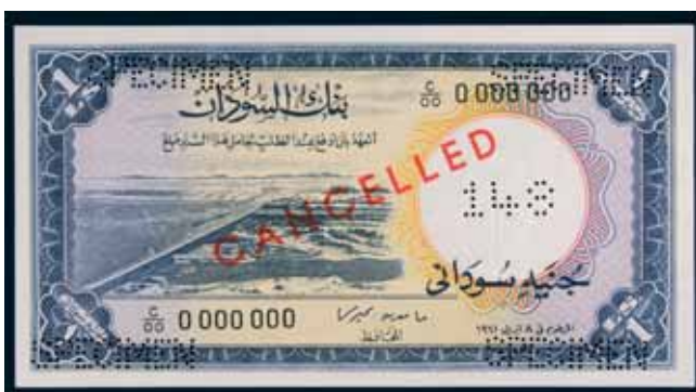
2702* Sudan , Bank of Sudan, specimen one pound, 8.4.1961 (P.8a) C/00 0 000000, diagonal overprint CANCELLED in red on front and back, punch hole SPECIMEN in each corner and number 148 in watermark area. Uncirculated.