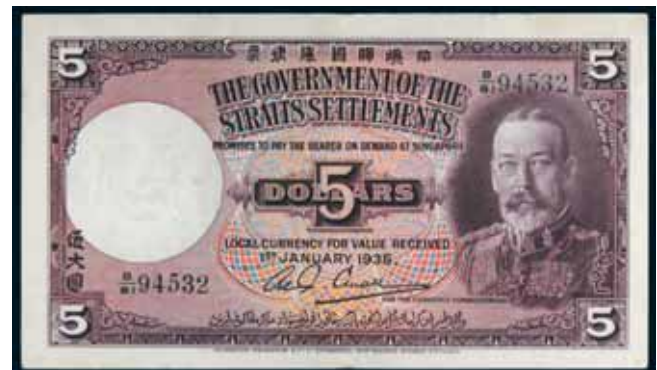
2694* Straits Settlements , George V, one dollar, L/40 48167 (P.16b) and five dollars B/81 94532 (P.17b) both 1st January 1935. Crisp nearly uncirculated; crisp extremely fine, slight toning. (2)