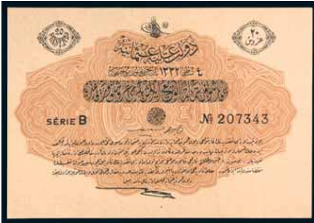
2708* Turkey , Law of 4 February AH1332 (1916-17), twenty piastres (P.97), Series B No.207343. Uncirculated. $100