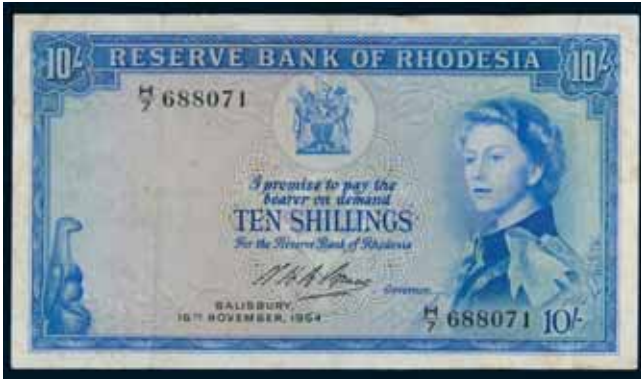
2653* Rhodesia , Reserve Bank of Rhodesia, Elizabeth II, Salisbury 16th November 1964, ten shillings (P.24a) H/7 688071. Flattened, with some foxing on back, otherwise very fine and scarce.