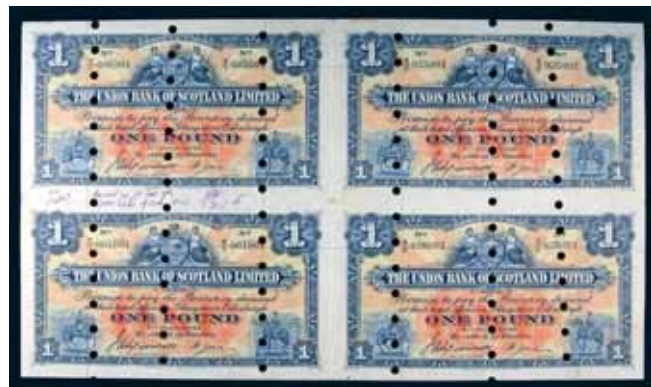
2668* Scotland , The Union Bank of Scotland Limited, one pound, uncut sheet of four printer's proofs, all Glasgow or Edinburgh, 1st June 1948, X/1 000001, X/1 001001, X/2 025001, X/2 026001, notations 'Correct as 1st Nos. for 25,000 notes of each serie 20.9.48' across part of central margin, three vertical lines of small punch holes and bankstamps on back (P.S815c; D.41a-4). Some mount marks on back, otherwise extremely fine. (4)