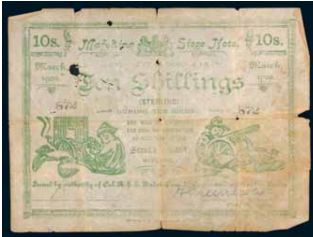
2688* South Africa , Mafeking Siege Note, ten shillings March 1900, 872 (P.S654b). Quarter folds, frail, tears on folds, otherwise very good.