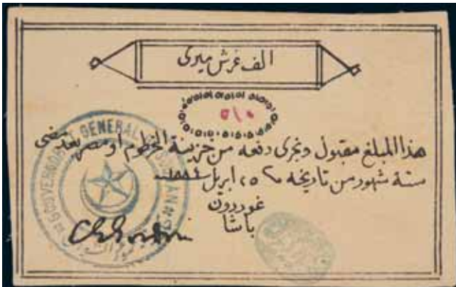
2696* Sudan , one thousand piastres, 25.4.1884 in Arabic (P.S107b), serial number 510, hectographic signature and seal of General Gordon, hand stamped seal of Governor General of Sudan, cloth backed card. Fresh, clear, extremely fine.