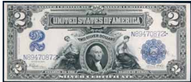
2713* USA , silver certificate two dollars, series of 1899, N89470872 (F.258; P.339). Crisp uncirculated and rare thus. $900 Ex Kagin in 1983 as gem CU65.