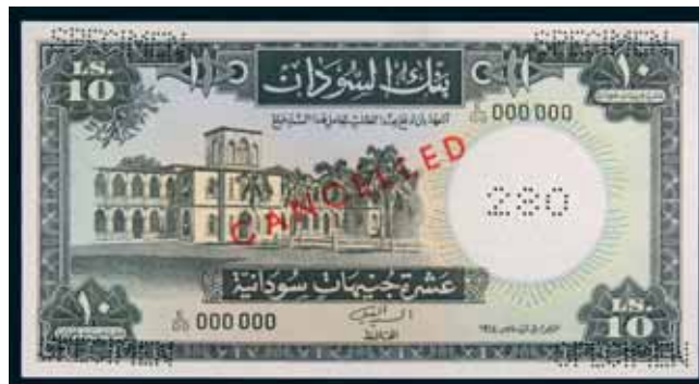
2704* Sudan , Bank of Sudan, specimen ten pounds, 6.3.1964 (P.10a) E/00 000000, diagonal overprint CANCELLED in red on front and back, punch hole SPECIMEN in each corner and number 280 in watermark area. Uncirculated.