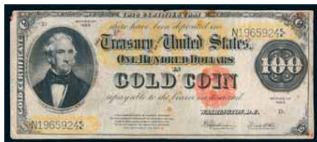
2715 USA , Treasury of the United States, gold certificate, one hundred dollars, series of 1922D, N1965924 (P.277). Tone spots, minor tears, top left margin with small piece missing, two pin holes, otherwise still with good body to paper, fine and scarce. $300